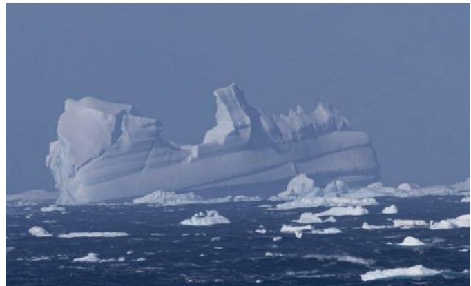
Ship-Sized Iceberg

Captain Cook was the first to lay eyes on South Georgia and his great hope was that he had found the tip of a great southern continent. The name Cape Disappointment reflects his feelings when he found that South Georgia was no continent at all. He was not too impressed with South Georgia without apparent exploitable resources, but the black-browed albatross that breed in large numbers on the sheer slopes did not mind his departure. Although they are less numerous because of long-line fishing practices, they are still impressive in numbers.