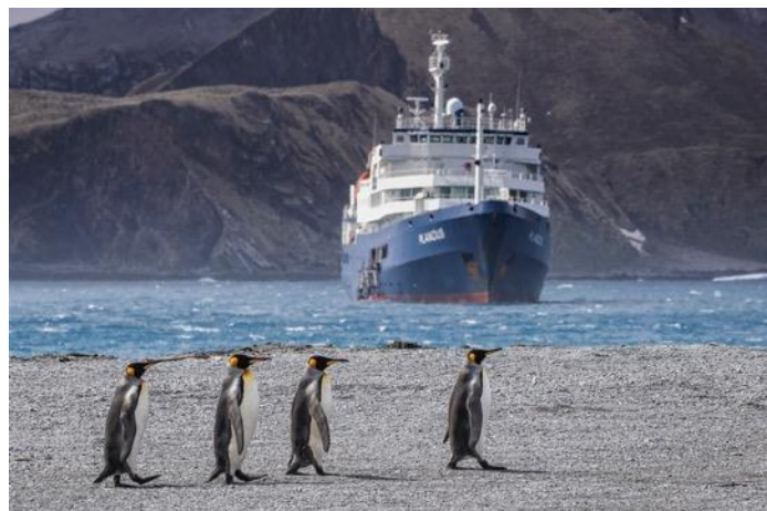
King Penguins

( https://cheesemans.com/extension/falklands-extension-oct2025 ), you will be in Stanley already to board the ship. Stanley is an attractive town and the last center of human population you will see until your arrival in Ushuaia, Argentina at the voyage's end. You should have some time before boarding to walk through town and explore this small corner of the British Empire that appears as if time has forgotten it. You will then be welcomed aboard by our Captain and our fine staff and crew and enjoy your first dinner aboard the ship before departing for South Georgia!