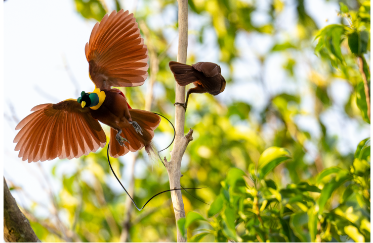
Red bird-of-paradise