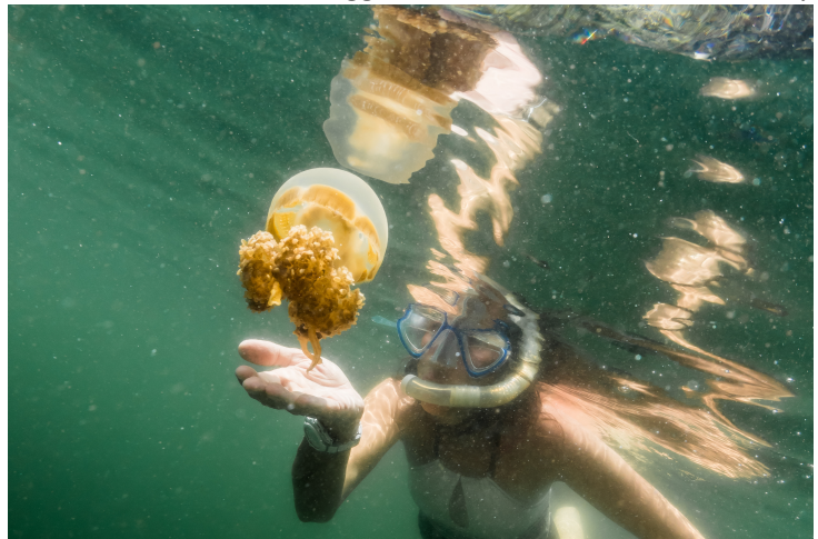
Snorkeler with Harmless Jellyfish

If conditions allow, continue to the nearby jellyfish lake—a hidden gem where you can drift among thousands of harmless jellyfish in a serene, secluded lagoon. The gentle pulsations of these ethereal creatures create a truly magical and otherworldly experience, unlike anywhere else in the world.