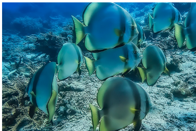
Golden Spadefish