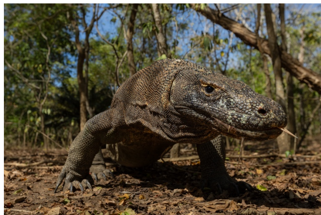
Komodo Dragon