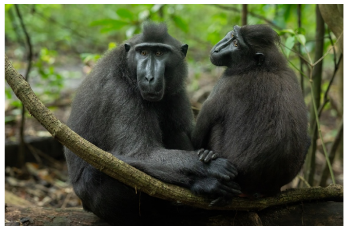
Black-crested Macaques

You'll spend three full days exploring Tangkoko National Park on foot. Daily treks average 3 to 4 miles over mostly flat terrain, with some gentle inclines as you ascend the foothills of the volcano. Tangkoko is renowned as one of the best places to experience tropical wildlife in Wallacea. Named after famed naturalist Alfred Wallace, this unique region along the Wallace Line is home to a remarkable array of endemic species. Highlights include black-crested macaques, bear cuscus, spectral tarsiers, and a dazzling variety of birds, such as the striking Red-knobbed Hornbill—considered one of the most beautiful hornbills in the world. Other notable birds you may encounter include five species of kingfishers, the Red-bellied Pitta, Purple Dollarbird, Eclectus Parrots, and many more.