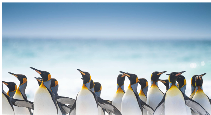
King Penguins

Andrews Bay and Salisbury Plain, absorbing the great richness and variety offered by South Georgia to voyagers so fortunate as ourselves. Here are some of the landing sites we hope to reach, though we will not be able to visit them all.