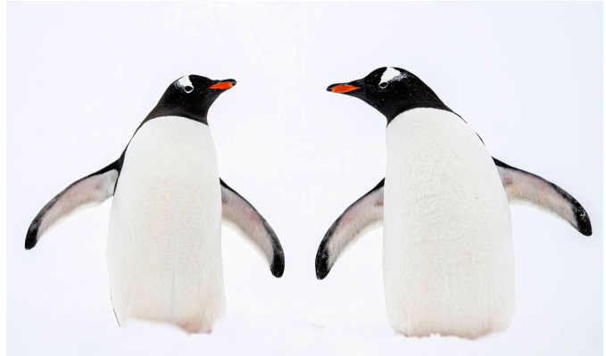
Gentoo Penguins

Weather and ice dictate whether we explore the Danco Coast or navigate east into the Weddell Sea. On the western side, the Danco Coast dazzles with deep fjords, towering peaks, and tidewater glaciers. Zodiac cruises and landings at sites like Wilhelmina Bay, Neko Harbor, and Paradise Bay offer excellent whale encounters—humpback, minke, and orca—and close-ups of Gentoo and Chinstrap