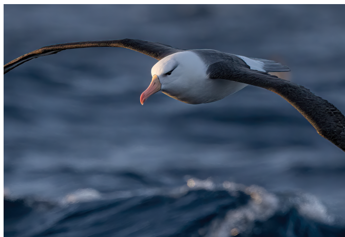
Black-browed Albatross

Nestled on the northwestern tip of South Georgia along the rugged Paryadin Peninsula, Elsehul is a sheltered cove with 400-meter walls of folded sedimentary rock that buffer it from Southern Ocean winds. Visit early in the season, before fur seals overwhelm the beaches, and you'll find Gray-headed Albatrosses nesting on steep tussock slopes—they are often the first to lay eggs here. Also watch for Black-browed Albatrosses, Macaroni, Gentoo, and King Penguins, and Southern Giant-Petrels quietly incubating nearby.