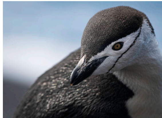
Chinstrap Penguin

A bit of a South Georgia hotspot featuring South Georgia's only Chinstrap Penguin colony and a thriving group of Macaroni Penguins. Climb through tussock grass to watch breeding activity up close. Though land access to Chinstrap Penguin colonies may still be restricted due to past avian cholera outbreaks, Cooper Island—rat-free and designated a Site of Special Scientific Interest—remains critical for South Georgia Pipits and burrow-nesting seabirds.