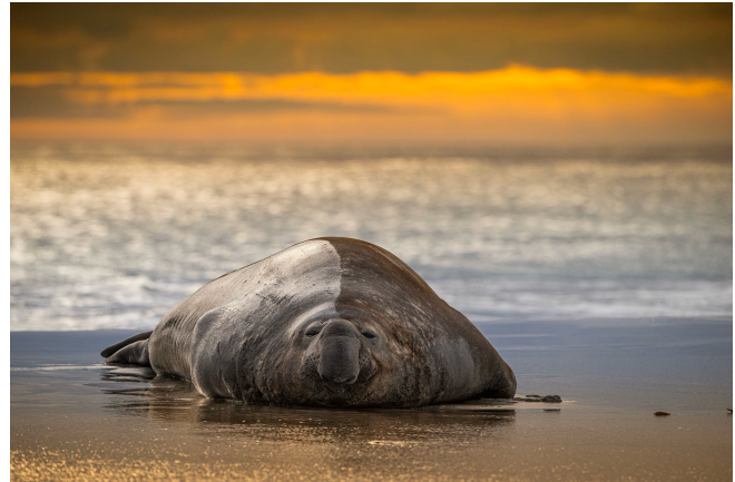
Southern Elephant Seals

One of the planet's most awe-inspiring wildlife spectacles, St. Andrews Bay hosts over 150,000 pairs of King Penguins stretching across the glacial moraine. The scene is alive with sound, color, and scent. Thousands of southern elephant seals gather here during pupping season—watch for beachmaster battles and tender nursing pups. Weather can turn rapidly with katabatic winds flowing off surrounding glaciers, so heed your expedition leaders.