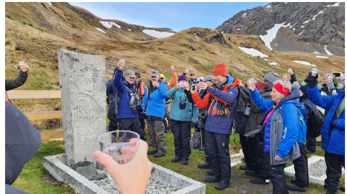
Shackleton's Grave

Sheltered by South Georgia's spine, Fortuna often enjoys calm skies. A King Penguin colony thrives on the grass-covered glacial plain. Above, scan the tussock slopes for Light-mantled Albatrosses performing graceful aerial displays.