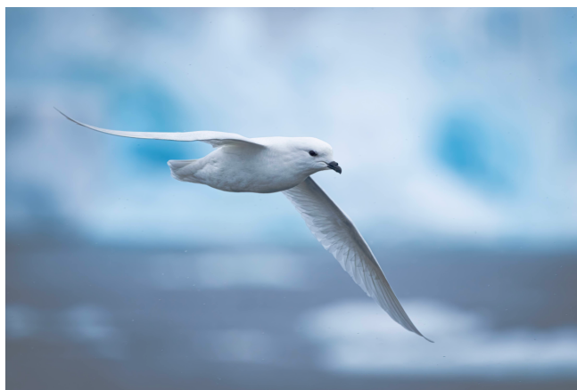
Snow Petrel

Due to the expeditionary nature of our voyage, our passage length may vary depending on ice, weather, and wildlife conditions. Cruising time may exceed two days between South Georgia Island and the Antarctic Peninsula and South Shetland Islands.