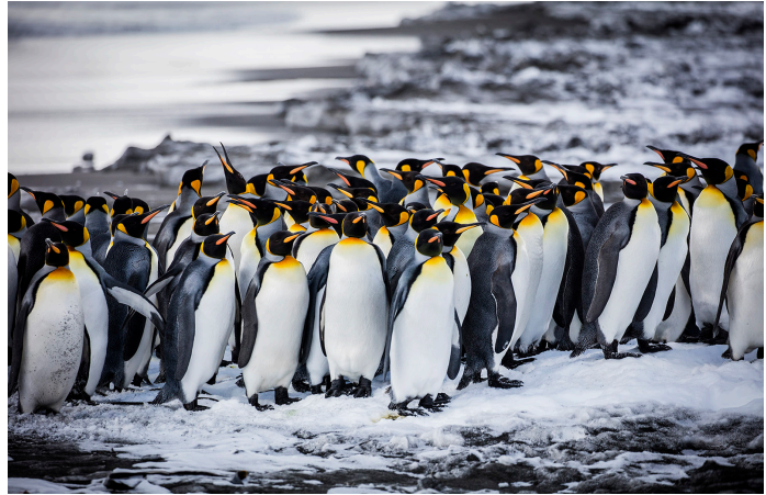
King Penguins

A glacial plain in the Bay of Isles, Salisbury hosts around 60,000 pairs of King Penguins. With staggered breeding cycles, you'll see courting pairs, molting adults, and chicks in various stages of development. South Georgia Pipits, the world's southernmost perching birds, sing from nearby grasses. Fur and elephant seals share the shore, while Southern Giant-Petrels circle overhead, scavenging the edges of the colony.