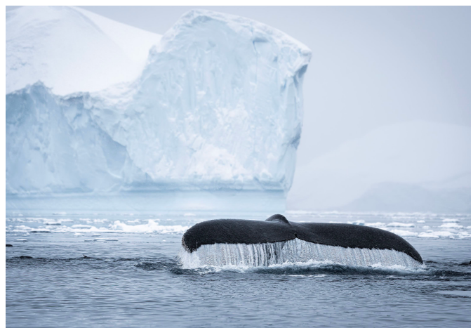
Humpback Whale