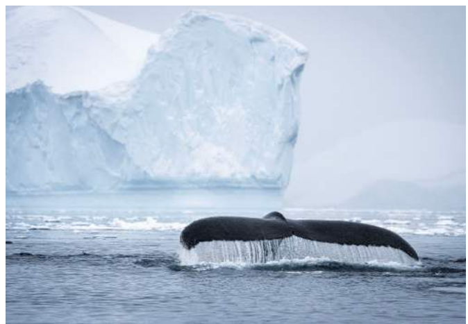
Humpback Whale

Weather and ice dictate whether we explore the Danco Coast or navigate east into the Weddell Sea. On the western side, the Danco Coast dazzles with deep fjords, towering peaks, and tidewater glaciers. Zodiac cruises and landings at sites like Wilhelmina Bay, Neko Harbor, and Paradise Bay offer excellent whale encounters—humpback, minke, and orca—and close-ups of Gentoo and Chinstrap