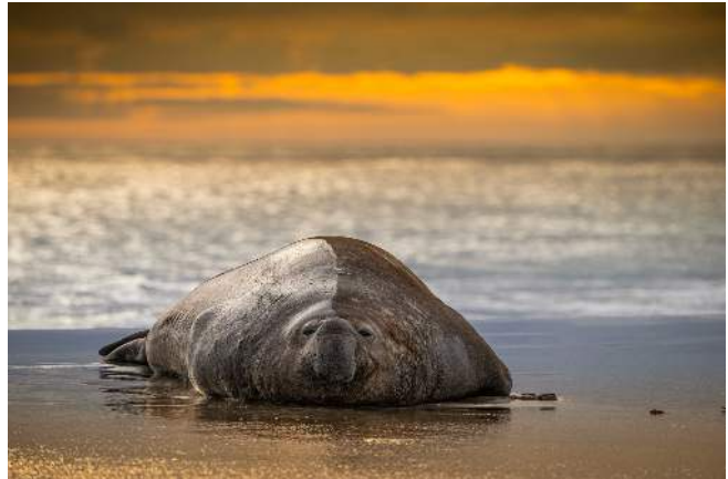
Southern Elephant Seals

One of the planet's most awe-inspiring wildlife spectacles, St. Andrews Bay hosts over 150,000 pairs of King Penguins stretching across the glacial moraine. The scene is alive with sound, color, and scent. Thousands of southern elephant seals gather here during pupping season—watch for beachmaster battles and tender nursing pups. Weather can turn rapidly with katabatic winds flowing off surrounding glaciers, so heed your expedition leaders.