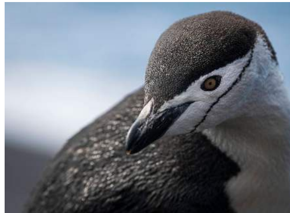
Chinstrap Penguin

A bit of a South Georgia hotspot featuring South Georgia's only Chinstrap Penguin colony and a thriving group of Macaroni Penguins. Climb through tussock grass to watch breeding activity up close. Though land access to Chinstrap Penguin colonies may still be restricted due to past avian cholera outbreaks, Cooper Island—rat-free and designated a Site of Special Scientific Interest—remains critical for South Georgia Pipits and burrow-nesting seabirds.