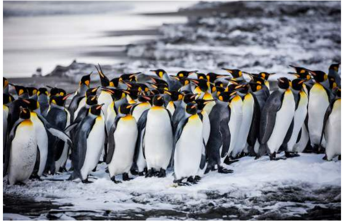
King Penguins

A glacial plain in the Bay of Isles, Salisbury hosts around 60,000 pairs of King Penguins. With staggered breeding cycles, you'll see courting pairs, molting adults, and chicks in various stages of development. South Georgia Pipits, the world's southernmost perching birds, sing from nearby grasses. Fur and elephant seals share the shore, while Southern Giant-Petrels circle overhead, scavenging the edges of the colony.