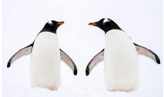
Gentoo Penguins

At Half Moon Island, Chinstrap Penguins nest against the dramatic backdrop of Livingston Island. Nearby Aitcho Island—blanketed in lush moss and lichen—hosts colonies of both Gentoo and Chinstrap Penguins, along with excellent opportunities to see southern elephant seals, Weddell seals, and South American fur seals.