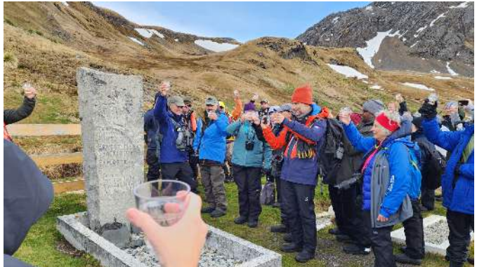
Shackleton's Grave

Sheltered by South Georgia's spine, Fortuna often enjoys calm skies. A King Penguin colony thrives on the grass-covered glacial plain. Above, scan the tussock slopes for Light-mantled Albatrosses performing graceful aerial displays.