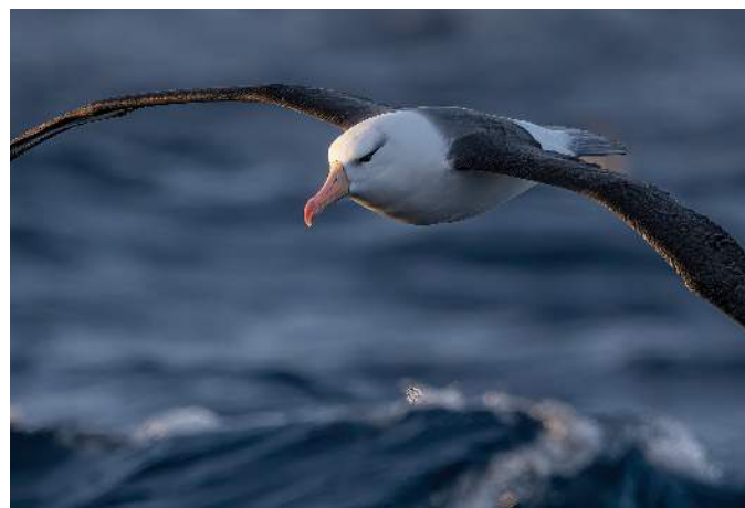
Black-browed Albatross © Scott Davis