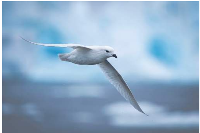
Snow Petrel

Due to the expeditionary nature of our voyage, our passage length may vary depending on ice, weather, and wildlife conditions. Cruising time may exceed two days between South Georgia Island and the Antarctic Peninsula and South Shetland Islands.