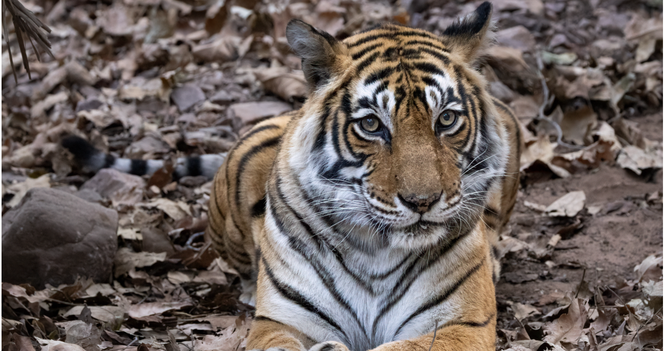
Bengal Tiger © Georgia Struhsaker