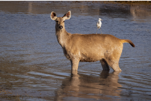
Barasingha © Georgia Struhsaker

Transfer to the airport for your flight. Continue on our Nepal trip or depart for home.