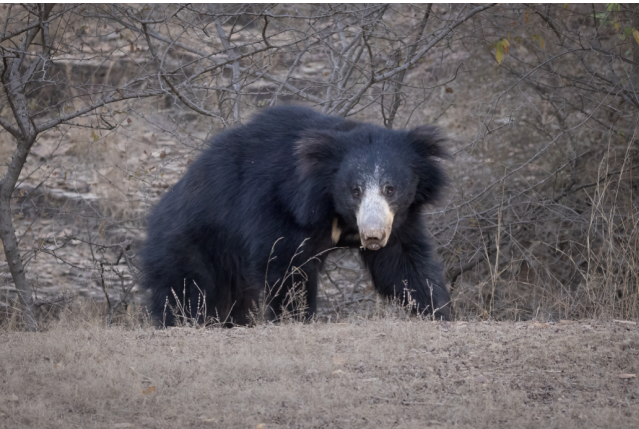
Sloth Bear © Georgia Struhsaker