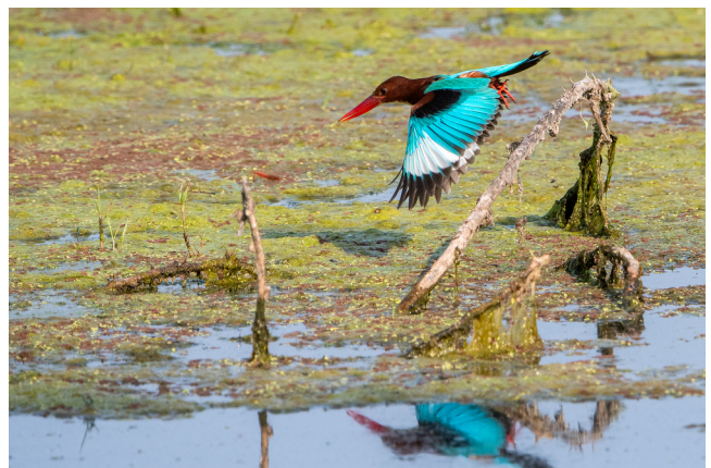
White-throated Kingfisher

After the safari return to the lodge for lunch then continue by road to Bandhavgarh National Park, arriving in the evening. Settle into your lodge and prepare for your first glimpse into one of India's most celebrated tiger reserves.