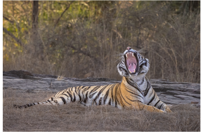
Bengal Tiger

Bandhavgarh is one of India’s most iconic tiger habitats, known for its high density of tigers and striking landscape of hills, river valleys, grasslands, and forested ridges. The park supports a rich diversity of life, with over 34 species of mammals , nearly 260 species of birds , and 70 types of butterflies recorded. While tracking tigers is the focus, sightings may also include leopards, jackals, sambar deer, and langurs, along with a vibrant variety of birdlife.