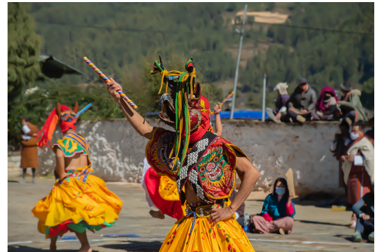
Festival

Bhutan is a country of festivals. The most important are the religious dance festivals, known as Tshechus, which are held in different districts throughout the year. In a swirl of color and noise, the gods and demons of Buddhist mythology come to life. Masked and sword dances and other rituals are performed by monks and villagers. The performances have deep religious significance but are not somber affairs. The Atsaras (traditional clowns of the Tshechu) add color and merriment to the festival with their bawdy antics.