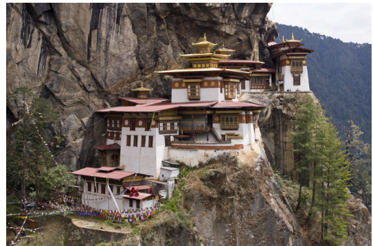
Tiger’s Nest Monastery

Bhutan’s most famous site is the Tiger’s Nest Monastery, impressively built on the side of a cliff just west of Paro. Halfway up you may relax at a cafe and enjoy the view of the monastery across a gorge. If you continue, you will discover increasingly dramatic views leading to a picturesque waterfall and bridge just below the monastery. You may tour the inside to see the rocks protruding from within; however, photography is not permitted inside. Keep an eye out for monkeys playing in the trees near the trail.