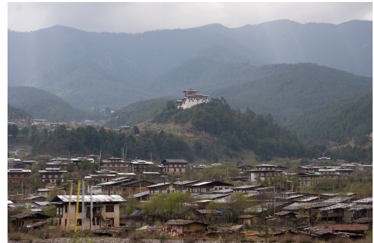
Jakar

Central to the Tshechu are the Cham dances, sacred masked performances that depict stories from the life of Guru Rinpoche (Padmasambhava) and other Buddhist deities. These dances are believed to confer blessings upon spectators and serve as a means of spiritual purification. Beyond its religious aspects, the festival is a major social event. Locals dress in their finest traditional attire, gather with family and friends, and enjoy communal meals. The Tshechu fosters community bonding and offers a platform for cultural expression through music, dance, and traditional arts.