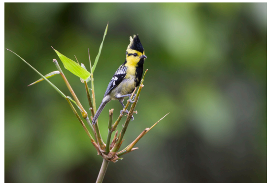
Yellow-cheeked Tit

During your time in the Zhemgang District, and along the Zhemgang-Tingtibi Road, you may find many special species, like Fire-tailed Myzornis, Cutia, Sultan Tit, Yellow-cheeked Tit, several species of Fulvettas and Laughingthrushes, Golden Babbler, Rust-fronted Barwing, Red-headed Trogon, Beautiful Nuthatch, Blue-bearded Bee-eater, Pin-tailed Pigeon, White-browed and Speckled Piculet, and more. Watch for the endemic and rare golden langur, well known for its presence in this region, and encounter the black giant squirrel and yellow-throated marten while exploring the mixed broadleaved evergreen forests at elevations from 2,000 to 8,000ft. Tingtibi is a birding hotspot, however, the overnight accommodations are very basic here, with hopes that the prolific wildlife present and authentic experience are an even exchange.