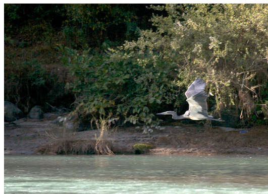
White-bellied Heron © Namgay Tshering

The drive from Tingtibi to Panbang in southern Bhutan is a journey through one of the country's richest biodiversity corridors, offering exceptional birdwatching and immersion in lush subtropical forests. Spanning approximately 96 kilometers and taking about 3 to 4 hours, this route descends from the mid-hills of Zhemgang into the lowland forests bordering the Royal Manas National Park, Bhutan's oldest national park and a UNESCO tentative site. The park encompasses a mosaic of habitats, including tropical and subtropical broadleaf forests, riverine grasslands, and bamboo groves. These diverse ecosystems support a wide array of flora and fauna, making the area a hotspot for biodiversity. Beyond birds, the area is rich in other wildlife. The Panbang valley is known for its vast variety of butterflies and moths, with numerous species recorded in the region. Mammals such as the golden langur, an endangered primate endemic to Bhutan, can also be spotted in the forests along the route.