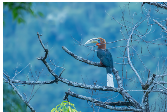
Rufous-necked Hornbill

This corridor traverses the fringes of Royal Manas National Park, Bhutan's oldest protected area. The landscape is characterized by dense broadleaf forests, bamboo thickets, and riverine ecosystems. These habitats support a rich diversity of flora and fauna, making the region a hotspot for biodiversity.