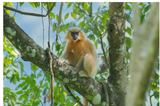
Golden Langur © Namgay Tshering