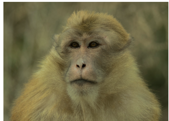
Assam Macaque

Bhutan is a country and culture that embodies the art of living in the moment. As this nation is experiencing rapid growth and a newly emerging tourist industry, the itinerary must be flexible to take advantage of the best Bhutan has to offer. Your trip will start and end in Paro. From Paro you begin your journey through the country, have binoculars and camera ready in hand as the beauty of Bhutan unfolds immediately. Keep an eye out for the enigmatic Isisbill, one of the most sought-after Himalayan shorebirds, and the beautiful Wallcreeper as you venture further into the country. You will drive through many districts (or dzongkhags) to visit the best regions for birdwatching, observe acrobatic langurs, view beautiful mountain scenery, and experience unique cultural attractions. Among many unforgettable sites along the way, you will return to Paro and hike Bhutan's famous Tiger's Nest Monastery. Read on for highlights of each district you may visit.