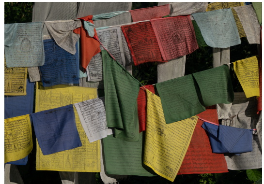
Prayer Flags

Beyond its spiritual significance, Bumthang offers a unique glimpse into traditional Bhutanese life. The region is renowned for its distinctive textiles, particularly the intricate woolen weaves known as yathra , which are produced in villages like Zugney. Visitors can explore quaint farming communities, taste locally made cheese and honey, and enjoy scenic hikes through pine forests and along pristine rivers. Despite its growing popularity among tourists, Bumthang has retained its charm and authenticity, making it a captivating destination for those seeking both natural beauty and cultural depth.