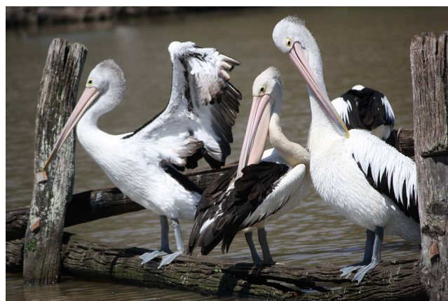
Pelicans

Arrive in Cairns, a laid-back town on the Coral Sea. We will have time to stroll along the waterfront park a few steps from your hotel, to look for local specialties like Varied Honeyeater, Torresian Imperial Pigeon, Rainbow Lorikeet, Mangrove Robin, Torresian Kingfisher, Rose-crowned Fruit-dove and Sahul Sunbird . We will be able to see several different shorebirds out on the extensive mudflats, such as Far Eastern Curlew, Great Knot, Sharp-tailed Sandpiper and Terek Sandpiper . There should also be Gull-billed Tern, Australian Pelican, Eastern Osprey and maybe an Eastern Reef Egret or two.