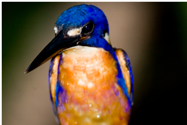
Azure Kingfisher

Enjoy a boat cruise on the Daintree River, where we will hopefully catch up with Azure and Little Kingfisher , Large-billed Gerygone, Black Bittern, Pacific Baza, Varied Triller, Shining Flycatcher, Chestnut-breasted Mannikin, Brown-backed Honeyeater, and Fairy Martin, as well as a chance of the rare and localized Great-billed Heron. Additional species we may see in the area include Bar-shouldered Dove, Pacific Koel, Papuan Frogmouth , Scaly-breasted Lorikeet, Hornbill (Helmeted) Friarbird , Dusky Myzomela, and White-breasted Woodswallow. Reptiles to see include saltwater crocodile, amethystine python, and common tree snake. We will then make our way back to Cairns where, depending on what species we have yet to see, we will spend the rest of the afternoon exploring.