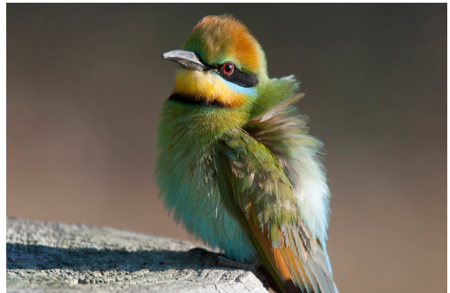
Rainbow Bee-eater

This morning, we will make an early visit to Nourlangie Rock , where we have a reasonable chance of seeing the range-restricted black Wwallaroo , Banded Fruit-dove , White-lined Honeyeater , Little Woodswallow, Black-tailed Treecreeper, and Helmeted Friarbird. Elsewhere throughout the park, we'll hope to connect with tropical woodland species like Partridge Pigeon (red-eyed form, subsp smithii), Rainbow Bee-eater , Black Bittern, Long-tailed Finch, and both Rufous-banded and Rufous-throated Honeyeaters. There is a reasonable chance of spotting a Red Goshawk in Kakadu as well, so we'll need to scrutinize the skies at all times. We'll spend the heat of the day in the Jabiru area of Kakadu, which will include a visit to the Bowali Information Centre, where an interpretive walk-through display explains in some detail the cultural heritage and natural history of the Gagadju (Kakadu) region. The Bininj-Mungguy Indigenous culture dates back tens of thousands of years, and there are some fascinating insights there at the center; the surrounding grounds provide a good chance to see a range of birds. After dinner, if we're feeling energetic, we can spotlight for mammals like Black-footed tree-rat and savannah (sugar) glider .