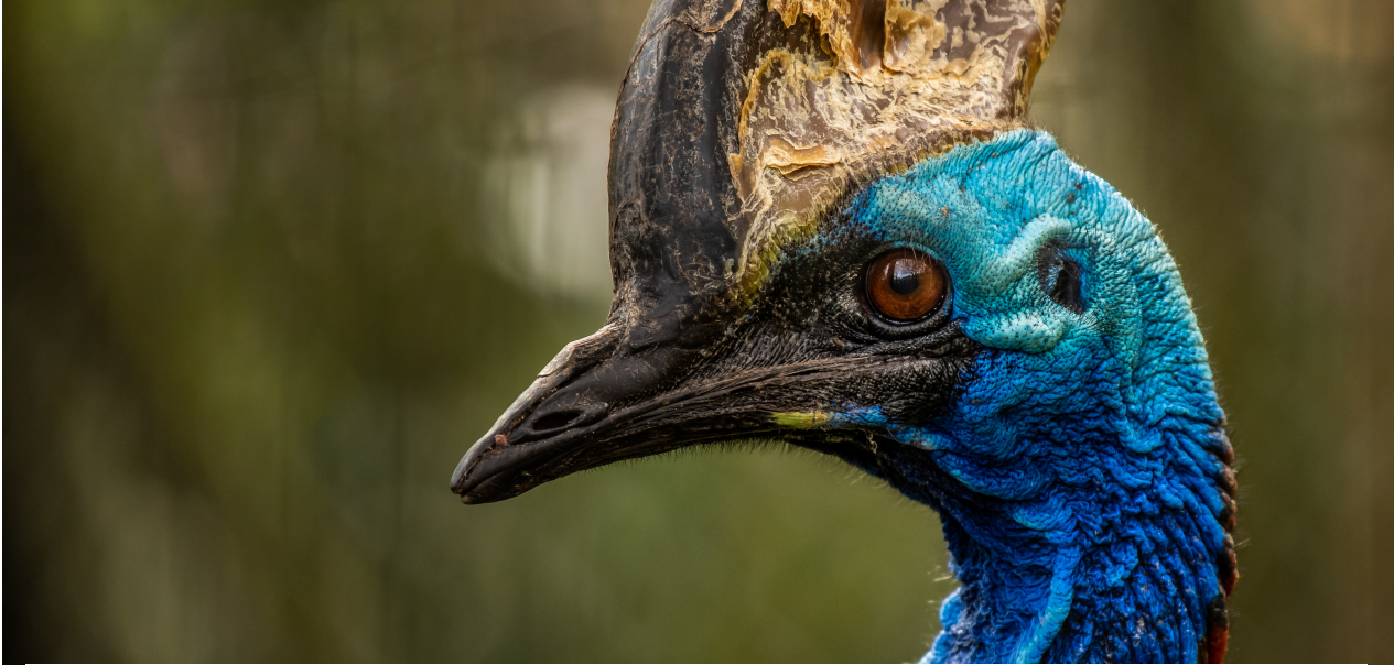
Southern Cassowary