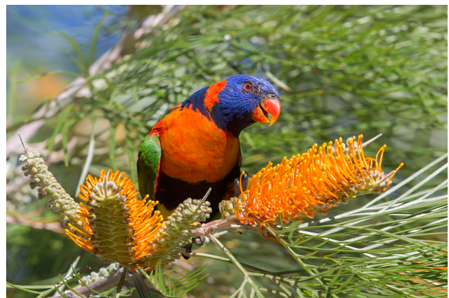
Red-collared Lorikeet

Today we will fly from Cairns to Darwin, capital of the Northern Territory and Australia's northernmost city. We will spend some time in the mangrove and monsoon forests looking for the elusive Chestnut Rail , Rufous Owl, Orange-footed Scrub-fowl, Rose-crowned Fruit Dove, the striking Rainbow Pitta , Forest Kingfisher, Red-headed Myzomela, Mangrove Robin, Green Oriole, Blue-faced Honeyeater, Green-backed Gerygone, Spangled Drongo, Blue-winged Kookaburra, Great Bowerbird, Pheasant Coucal, Pied and Silver-backed Butcherbird, and Red-collared Lorikeet. Little red flying-fox and agile wallaby are possible mammal highlights.