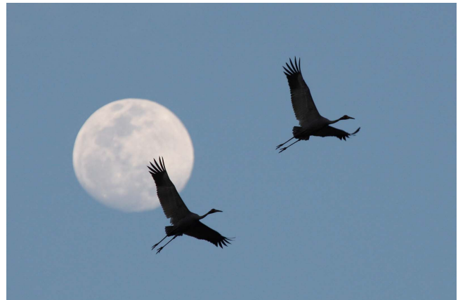
Sarus Cranes

With this as our base for the next three days, we will explore the wide variety of habitats that are within our reach here on the Atherton Tablelands. With upland rainforest, tropical savannah woodlands, grassland and agricultural fields, wetlands, and swamps to explore, we will be looking for birds like Brolga, Sarus Crane, Great Crested Grebe, Plumed Whistling-Duck , Nankeen Night-heron, Royal and Yellow-billed Spoonbill, White-necked Heron, Black-necked Stork, Buff-banded Rail, White-headed Pigeon, Pacific Baza, Spotted Harrier, Lesser Sooty Owl , the rainforest-inhabiting form (subsp lurida ) of Australian Boobook , Tooth-billed Bowerbird, Fernwren, Bridled Honeyeater, Atherton Scrubwren, Fairy and Brown Gerygones, Mountain Thornbill , Chowchilla, Bower's Shrike-thrush, Double-eyed Fig-Parrot (Wet Tropics subsp macleayana ), Black-faced, Pied, Spectacled and White-eared Monarchs, Shining Bronze-cuckoo, Fan-tailed Cuckoo , and Grey-headed Robin.