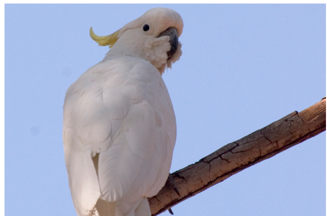
Sulphur-crested Cockatoo

After a morning's birding in the rainforest looking for any bird species we may still be missing, we will leave the higher altitude rainforests and head north to the Daintree River region, via a range of open woodland habitats and tropical savannahs. Birds we hope to connect with today include Australian Bustard, Black-necked Stork, Red-tailed Black-Cockatoo, Sulphur-crested Cockatoo , Squatter Pigeon, White-throated Honeyeater, Grey-crowned Babbler, Noisy & Little Friarbirds, White-throated Gerygone, Red-winged Parrot,