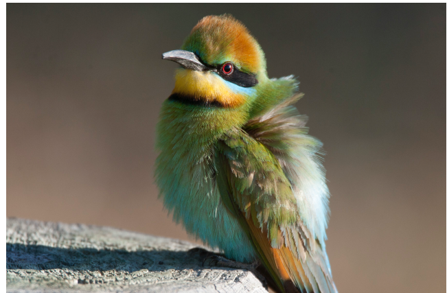
Rainbow Bee-eater

This morning, we will make an early visit to Nourlangie Rock , where we have a reasonable chance of seeing the range-restricted black Wwallaroo , Banded Fruit-dove , White-lined Honeyeater , Little Woodswallow, Black-tailed Treecreeper, and Helmeted Friarbird. Elsewhere throughout the park, we'll hope to connect with tropical woodland species like Partridge Pigeon (red-eyed form, subsp smithii), Rainbow Bee-eater , Black Bittern, Long-tailed Finch, and both Rufous-banded and Rufous-throated Honeyeaters. There is a reasonable chance of spotting a Red Goshawk in Kakadu as well, so we'll need to scrutinize the skies at all times. We'll spend the heat of the day in the Jabiru area of Kakadu, which will include a visit to the Bowali Information Centre, where an interpretive walk-through display explains in some detail the cultural heritage and natural history of the Gagadju (Kakadu) region. The Bininj-Mungguy Indigenous culture dates back tens of thousands of years, and there are some fascinating insights there at the center; the surrounding grounds provide a good chance to see a range of birds. After dinner, if we're feeling energetic, we can spotlight for mammals like Black-footed tree-rat and savannah (sugar) glider .