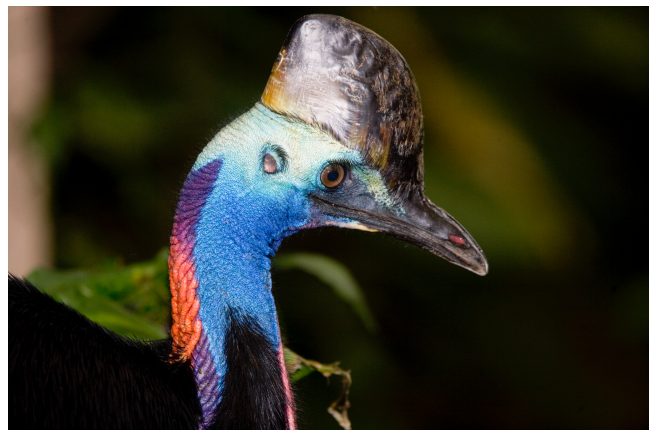
Southern Cassowary

Arrive in Cairns, a laid-back town on the Coral Sea. We will have time to stroll along the waterfront park a few steps from your hotel, to look for local specialties like Varied Honeyeater, Torresian Imperial Pigeon, Rainbow Lorikeet, Mangrove Robin, Torresian Kingfisher, Rose-crowned Fruit-dove and Sahul Sunbird . We will be able to see several different shorebirds out on the extensive mudflats, such as Far Eastern Curlew, Great Knot, Sharp-tailed Sandpiper and Terek Sandpiper . There should also be Gull-billed Tern, Australian Pelican, Eastern Osprey and maybe an Eastern Reef Egret or two.