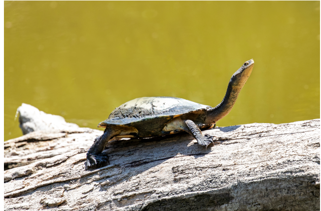
Long-Necked Turtle

In the morning, we will make a stop at the impressive Mamukala Wetlands , where, if conditions are right, we can enjoy thousands of birds of many species. Plumed and Wandering Whistling-ducks, Radjah Shelduck, Black-necked Stork, Magpie Goose, and Green Pygmy-goose are possible bird highlights, and Arafura File Snakes and Long-necked Turtles can also be found here, a traditional hunting ground for the local Indigenous people. There will also be an option to visit Ubirr, a site of rock outcrops in Kakadu that is home to some impressive Aboriginal rock art . The art depicts creation ancestors and animals of the area, including several fish and turtle species, wallabies, and possums. In the late afternoon, Wilkin's rock wallabies (a relatively recent split from Short-eared rock wallabies) may be seen emerging from their shelters. Bird specialties found here include Sandstone Shrike-Thrush, Chestnut Quilled Rock Pigeon, Partridge Pigeon (red-eyed form), and Rufous-throated Honeyeater.