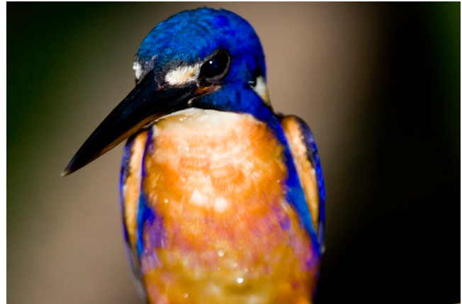
Azure Kingfisher

Enjoy a boat cruise on the Daintree River, where we will hopefully catch up with Azure and Little Kingfisher , Large-billed Gerygone, Black Bittern, Pacific Baza, Varied Triller, Shining Flycatcher, Chestnut-breasted Mannikin, Brown-backed Honeyeater, and Fairy Martin, as well as a chance of the rare and localized Great-billed Heron. Additional species we may see in the area include Bar-shouldered Dove, Pacific Koel, Papuan Frogmouth , Scaly-breasted Lorikeet, Hornbill (Helmeted) Friarbird , Dusky Myzomela, and White-breasted Woodswallow. Reptiles to see include saltwater crocodile, amethystine python, and common tree snake. We will then make our way back to Cairns where, depending on what species we have yet to see, we will spend the rest of the afternoon exploring.