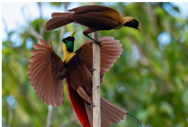
Red Birds of Paradise

In the afternoon, immerse yourself in the vibrant local culture with a visit to Arborek Village . Wander through the village, where you can join in a friendly soccer match with locals or shop for handmade sunhats crafted from pandan leaves. The warm hospitality and sense of community here make it an unforgettable cultural highlight.