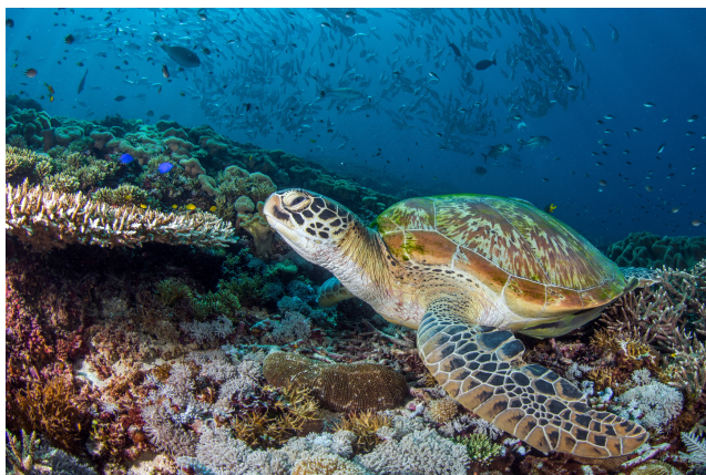
Green Sea Turtle © Cheesemans' Ecology Safaris

Penemu Island is home to some of the most spectacular coral gardens in Indonesia. Your first stop is Melissa's Garden , a breathtaking site known for its vibrant hard-coral plateaus that stretch as far as the eye can see. Snorkel among fields of staghorn and table corals, where swarms of anthias, butterflyfish, and damselfish dance through the currents. Keep your eyes peeled for green sea turtles grazing lazily along the coral heads.