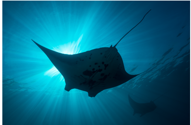
Manta Rays