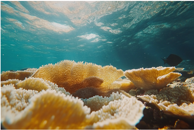
Soft Coral

One of Triton Bay’s most iconic residents is the majestic whale shark , a bucket-list encounter for marine enthusiasts and snorkelers. These gentle giants frequently gather around traditional fishing platforms known as bagans , feeding on small fish and shrimp that escape from the nets. Whale shark sightings occur year-round , with peak encounters from October to April. Snorkelers can enjoy intimate, awe-inspiring experiences as the whale sharks glide gracefully near the surface, accustomed to the activity surrounding the platforms. Triton Bay offers a truly unforgettable blend of adventure and tranquility , making it a must-visit destination for nature lovers.