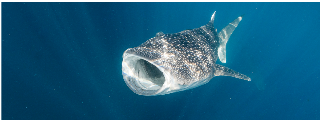
Whale Shark