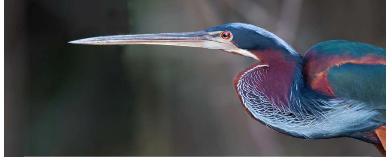
Agami Heron