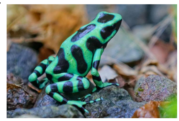
Green-black Poison Dart Frog

Mar 21 ~ Return to San José & Farewell Dinner Depart Tortuguero National Park by boat, keeping an eye out for three-toed sloths