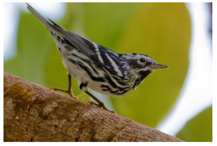
Black-and-White Warbler

Descend the Caribbean slope to Selva Verde Lodge , a 500-acre private reserve bordering Braulio Carrillo National Park. This region is home to the endangered Great Green Macaw , which depends on the almendron tree ( Dipteryx panamensis) for survival. Explore riparian forests along the Sarapiquí River , where vibrant poison dart frogs , millipedes, and an array of bird species thrive. Enjoy morning coffee at the fruit feeding station, where a spectacle of bird activity unfolds.