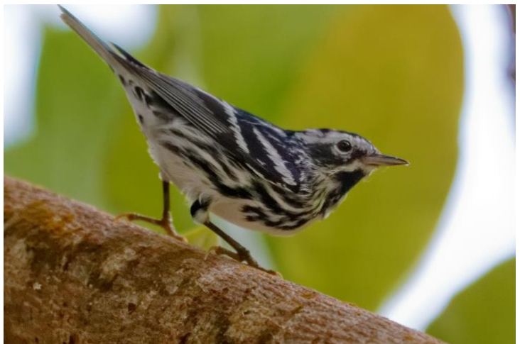
Black-and-White Warbler

Descend the Caribbean slope to Selva Verde Lodge , a 500-acre private reserve bordering Braulio Carrillo National Park . This region is home to the endangered Great Green Macaw , which depends on the almendron tree ( Dipteryx panamensis ) for survival. Explore riparian forests along the Sarapiquí River , where vibrant poison dart frogs , millipedes, and an array of bird species thrive . Enjoy morning coffee at the fruit feeding station, where a spectacle of bird activity unfolds .