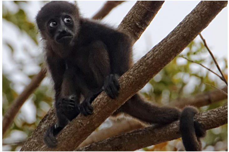
Howler Monkey

Explore the refuge’s rich habitats, searching for Pacific Screech-owls, white-headed capuchins, northern tamanduas, and white-nosed coatis . Walk coastal trails where white-tailed deer graze and, as the sun sets, spot Ferruginous Pygmy-owls and Bat Falcons perched in the trees.