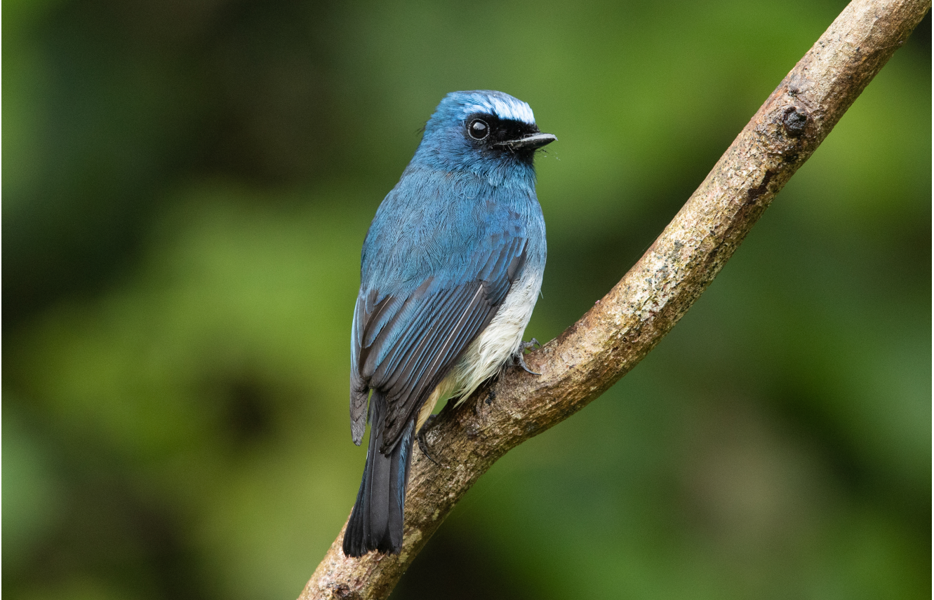
Indigo Flycatcher