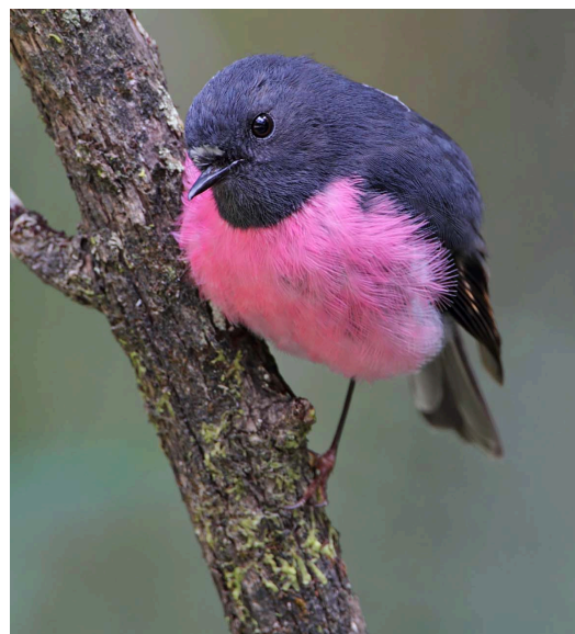
Pink Robin

Set out on an exhilarating wilderness cruise along Bruny's rugged southern coastline, where towering sea cliffs and caves provide sanctuary for Black-faced Cormorants , Shy Albatross , and Australian Fur Seals. Keep an eye out for dolphins , humpback whales , and southern right whales as they migrate through the region. Later, venture into Adventure Bay, where Hooded Plovers nest along the sandy shores. A highlight will be searching for Bruny's rare "white wallabies," an almost albino form of Bennett's Wallaby. End the day with a guided night safari, offering unparalleled opportunities to observe brushtail possums , Tawny Frogmouths , Tasmanian pademelons, eastern quolls (a relative of the Tasmanian devil), Bennett's wallabies, and other nocturnal creatures.