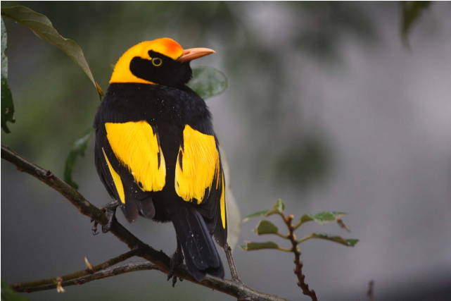
Regent Bowerbird

Fly to Queensland and immerse yourself in the World Heritage-listed rainforests of Lamington National Park, one of Australia’s most renowned birding destinations. Explore towering subtropical forests, lush fern gullies, and misty waterfalls, home to over 200 bird species, including the striking Paradise Riflebird, Albert’s Lyrebird, and Regent Bowerbird . Walk beneath ancient fig trees while keeping an eye out for Australian Brush-turkeys, Noisy Pittas, and Logrunners . In the evenings, enjoy guided night walks, where you may encounter greater gliders, ringtail possums, and sugar gliders gliding through the canopy.