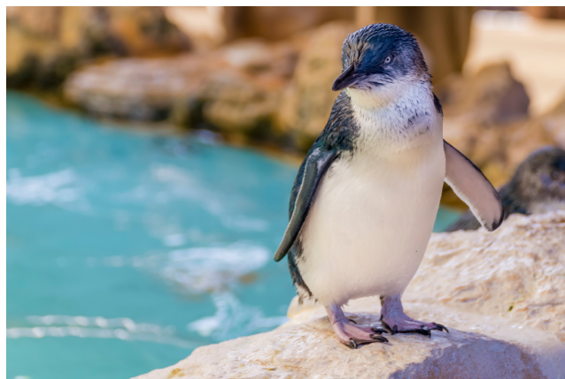
Little Penguin

Our local agent will transfer you from the airport to the hotel. If you would like to arrive earlier, we can arrange divergent airport transfers and extra nights. Today you'll begin your explorations of spectacular Tasmania by visiting several reserves in the Hobart area including kunanyi/Mount Wellington. This mountain affords spectacular views of the city and surrounding landscape on a clear day. Here you'll also take a walk through a glade with towering tree ferns where you'll have your first chance to see the endemic and rather shy Scrubtit as well as Tasmanian Scrubwren and the stunning Pink Robin . Further endemic highlights you will look for today include Green Rosella , Tasmanian Native Hen , Black Currawong and Yellow Wattlebird .