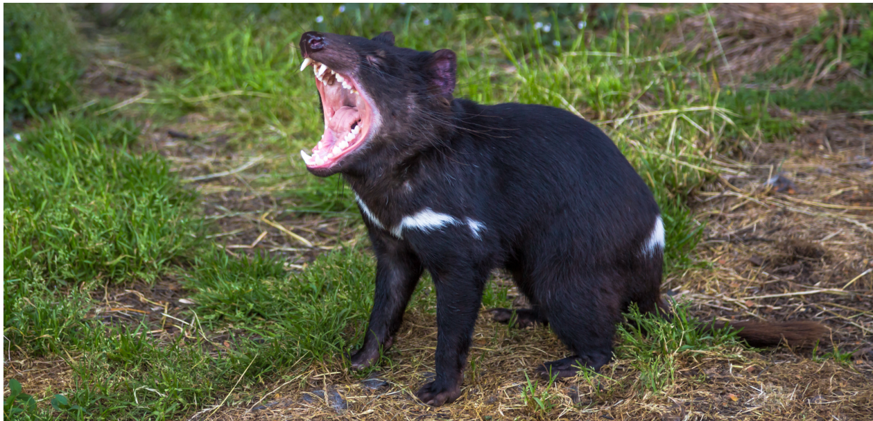
Tasmanian Devil