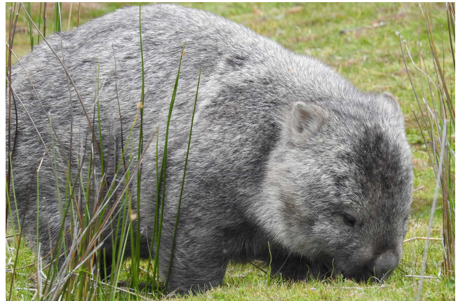
Common Wombat

On your second day at Cradle Mountain you will continue to search for some of Tasmania's endemic bird species . This area also offers a good chance to spot the common wombat. You'll enjoy discovering fascinating plant species, including ancient rainforest varieties and Gondwanan relics such as Pencil and King Billy Pines, Myrtle, and the famous Fagus (Nothofagus gunnii) , Tasmania's only deciduous tree. You'll also visit the replica of "Waldheim," the home of Austrian Gustav Weindorfer, whose passion for the area inspired the creation of the national park. Tonight, you'll return to the National Park, hoping to spot a Tasmanian devil or spotted-tailed quoll .