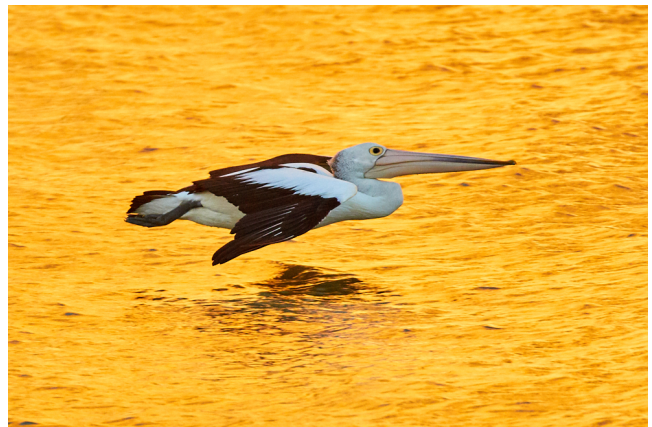
Australian Pelican

This morning, you'll travel to Bruny Island, 40km south of Hobart, separated from Tasmania by the D'Entrecasteaux Channel. The 15-minute ferry crossing often features sightings of Little Penguins or dolphins . At 'Inala,' a 1,500-acre wildlife sanctuary, you'll explore habitats for all 12 Tasmanian endemic bird species, including the endangered Forty-spotted Pardalote ,