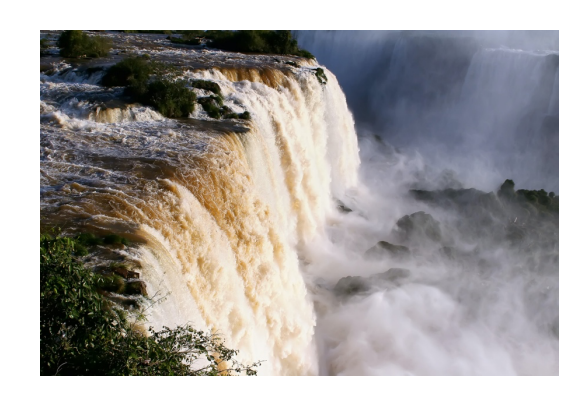
Victoria Falls

Start the next day with a tasty early morning breakfast then head to Victoria Falls town for a guided tour of Zimbabwe's foremost attraction – the Victoria Falls! Also known as Mosioa-Tunya in the local language, "The Smoke that Thunders," is a UNESCO World Heritage Site and at 360ft (108m) high, and 5,306ft (1708m) wide, remains one of the most spectacular natural wonders in the world. While not the widest or highest waterfall, Victoria Falls is considered to be the largest curtain of falling water in the world thanks to its incredible volume of water.