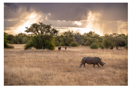
Rhino Sanctuary

Cobras basecamp where you'll learn more about their work along with Imvelo's many other community and conservation programs. Hear a short talk on the origins and ideas behind the formation of the Cobras unit and how they protect the rhino as well as the future plans for the ground-breaking Community Rhino Conservation Initiative. Then, head off on foot or by vehicle with the Cobras to meet Thuza and Kusasa! There will be plenty of photo opportunities and quality time to watch and enjoy the rhinos in their natural environment.