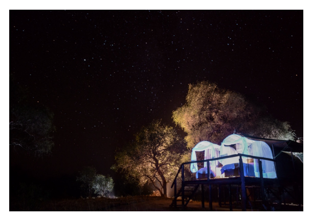
Camp Under the Stars

Jozibanini has an interesting story which reinforces the importance of your visit here. A ranger station named Jozibanini was abandoned in the early 2000's due to lack of park funds, leaving the southern and western parts of the park largely unpatrolled by rangers and never visited by tourists. As a result, elephant poaching raised its ugly head in this area in 2013. After these poaching incidents,