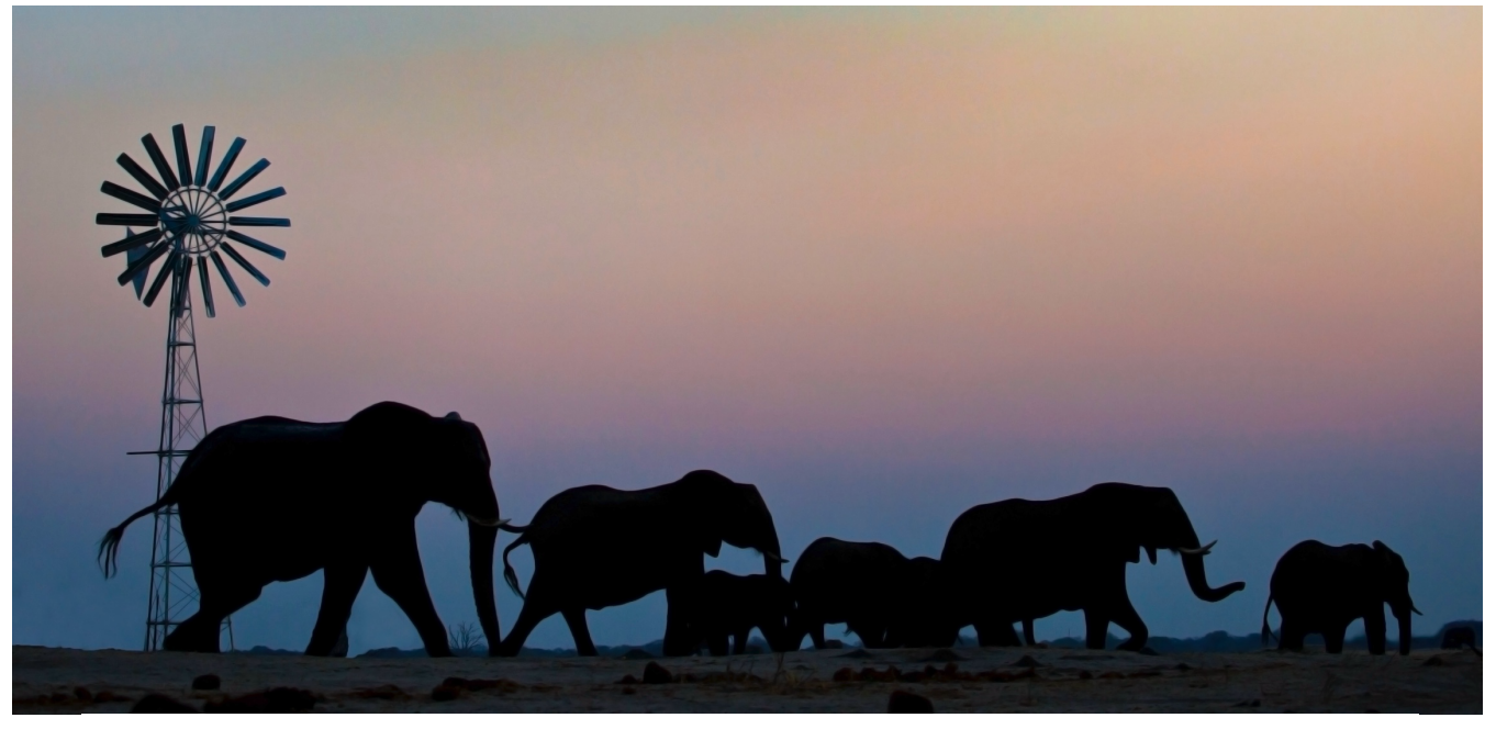
African Elephants