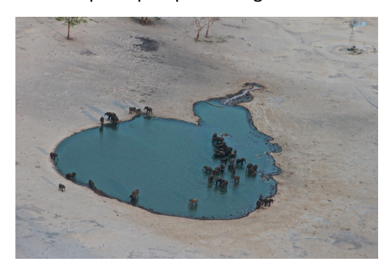
African Elephants at Watering Hole

Arrive at Jozi for dinner and then have your first look at the Milky Way four hours from any other camps. After a night's rest, enjoy an early morning game drive or a guided game