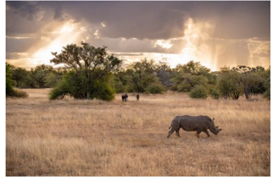
Rhino Sanctuary

In the afternoon, you head to the Imvelo Ngamo Rhino Sanctuary where you'll meet the resident white rhino, Thuza and Kusasa, as well as the Cobra Rangers guarding them 24/7. Start with a behind-the-scenes look at the Cobras basecamp where you'll learn more about their work along with Imvelo's many other community and conservation programs. Hear a short talk on the origins and ideas behind the formation of the Cobras unit and how they protect the rhino as well as the future plans for the ground-breaking Community Rhino Conservation Initiative. Then, head off on foot or by vehicle with the Cobras to meet Thuza and Kusasa! There will be plenty of photo opportunities and quality time to watch and enjoy the rhinos in their natural environment.