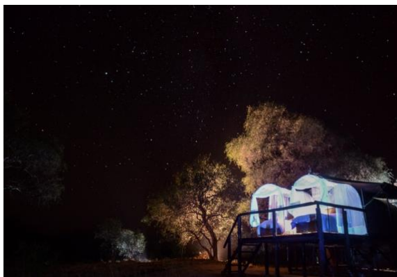
Camp Under the Stars

Jozibanini has an interesting story which reinforces the importance of your visit here. A ranger station named Jozibanini was abandoned in the early 2000's due to lack of park funds, leaving the southern and western parts of the park largely unpatrolled by rangers and never visited by tourists. As a result, elephant poaching raised its ugly head in this area in 2013. After these poaching incidents, Imvelo Safari Lodges decided to establish an outpost at Jozibanini which staff and a privileged few tourists could use as a base for both management of water resources and a safari experience unlike any other. Presence in the area would also deter poachers, and who better to employ to protect the new project than ex-poachers who have turned over a new leaf? By introducing tourism, the Jozi project has helped protect and conserve hundreds of kilometers of remote park, and regular traffic on the route has translated into reliable support for both parks pump attendants and about 25% of Hwange's thirsty wildlife in the dry season.