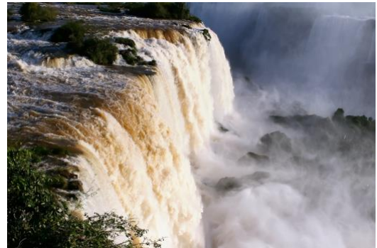
Victoria Falls

Start the next day with a tasty early morning breakfast then head to Victoria Falls town for a guided tour of Zimbabwe's foremost attraction – the Victoria Falls! Also known as Mosi-oa-Tunya in the local language, "The Smoke that Thunders," is a UNESCO World Heritage Site and at 360ft (108m) high, and 5,306ft (1708m) wide, remains one of the most spectacular natural wonders in the world. While not the widest or highest waterfall, Victoria Falls is considered to be the largest curtain of falling water in the world thanks to its incredible volume of water.