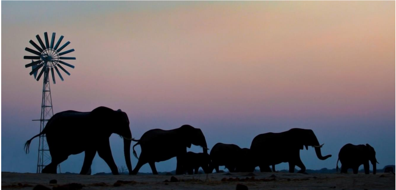
African Elephants