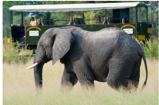
African Elephant and the Elephant Express

After arriving at Ngamo in the early evening, you'll disembark the Elephant Express and climb aboard 4 x 4 safari vehicles for the short ride to camp. You can settle in before returning to the main lodge for a pre-dinner drink at the bar or around the campfire. A delectable 3-course dinner will be served under the Milky Way and the Southern Cross followed by coffee or a nightcap around the campfire.