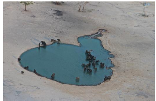
African Elephants at Watering Hole

You will also make a stop at the Makona Ranger Station near Jozibanini Camp and meet some of the national park rangers who patrol in this remote corner of the park. Imvelo funded and installed a state-of-the-art solar powered water pump at Makona which provides water for the rangers, their organic vegetable garden, and for wildlife at the nearby Makona pan. In addition, the solar array provides power for lights and radios at the station.