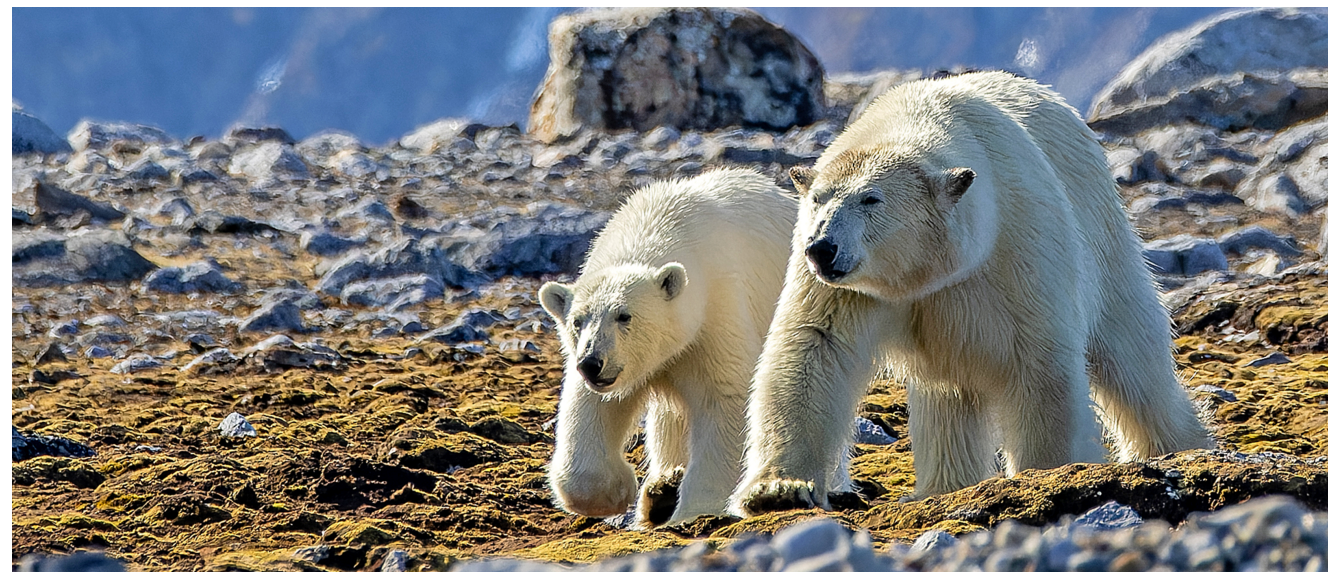
Polar Bears