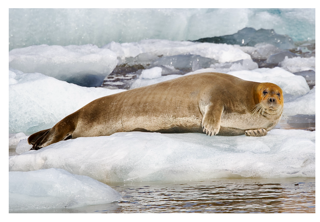
Bearded Seal

We emphasize photography and observation of iconic Arctic wildlife and unique and beautiful landscapes, complying with local regulations regarding wildlife