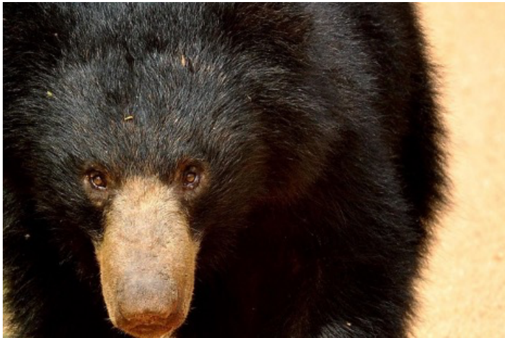
Sloth Bear

Wilpattu retains its status as a preferred safari destination due to a strong prevalence of elusive leopards. Though the present number of Sri Lankan leopards in the park is unknown, it is one of the best wildlife safari destinations to observe these big cats. Another highlight is the dense population of Sri Lankan sloth bears, which are a highly threatened sub species of sloth bear that exists only on the island.