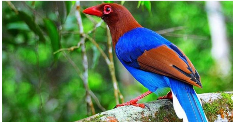
Blue Magpie

Walk along the twisting footpaths over wooden bridges built above small streams, through endless soothing greenery accompanied by bird songs with the smell of the good earth all around, totally surrounded by the beauty of nature. The wilderness with its shady trees and spectacular bird life consists of jungle magpie robins, jungle fowl, the red vented and black capped bulbuls, black headed orioles, crimson backed woodpeckers, brown headed barbets, black headed orioles, paradise flycatchers, flower peckers, sun birds, tailor birds, parakeets, eagles, and plenty more. This natural treasure trove is also home to spotted deer, wild boar, porcupine, mouse deer, black-naped hare, rock squirrels, and the rare (endemic) slender loris.