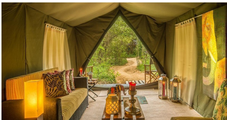
Walpattu Lodge

After a delectable lunch, you begin your afternoon safari until dusk falls. You will be returning to the campsite to enjoy a drink in the jungle bar before dinner in a specially-selected location.