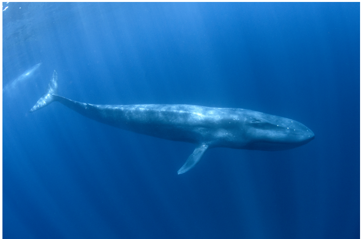
Blue Whale