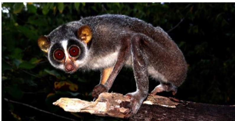
Loris