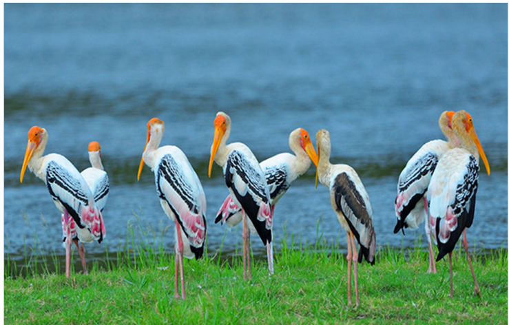
Painted Stork

Gal Oya Lodge is a unique Sri Lankan ecolodge spread across 20 acres of private jungle. Take your time enjoying this natural paradise through the experiences offered, which include a walk with the Vedda neighbors, one of the last remaining communities of the forest-dwelling, indigenous people of Sri Lanka. As the tribesman discusses the utilization of medicinal plants, the whereabouts of their age-old hunting territories and cavernous residences, and the means by which the hunters and gatherers thrived within the historic Gal Oya jungles, the forest springs to life.