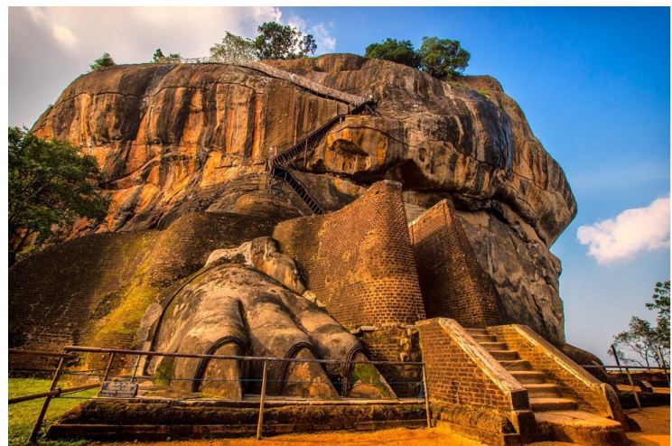
Sigiriya Rock Fortress

Sigiriya Rock Fortress is one of the most outstanding architectural wonders in Sri Lanka. Rising nearly 700 feet above one of Asia's most well-preserved, ancient, landscaped gardens, the rock fortress of Sigiriya, a giant granite monolith, is an unforgettable sight. Sigiriya, a UNESCO World Heritage Site, is one of the most dramatic, inspiring, and beautiful historical locations in the world. A mythical past of feuding dynasties suits Sigiriya's striking setting – it was built in 5th century AD by King Kasyapa as a fortress-palace. Legend says that King Kasyapa murdered his father, Dhatusena, and claimed the throne for himself. However, Kasyapa was not the direct heir (his mother was one of Dhatusena's concubines), and he was fearful that his half-brother, Prince