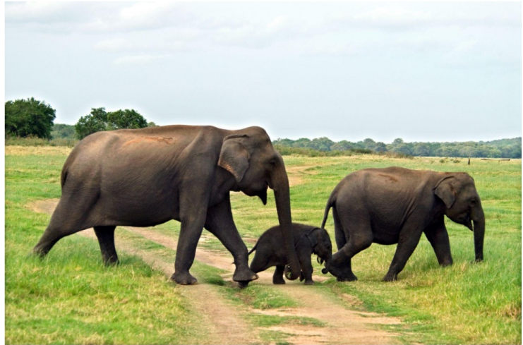
Elephants

In the evening, you'll head for the Minneriya National Park. The park is a protected wildlife reserve in the heart of Sri Lanka's Dry Zone. Its main feature is the Minneriya Reservoir, a true engineering marvel, the largest of 16 built in the 3rd Century AD by King Mahasena. Minneriya National Park is home to 24 species of mammals including the world's largest gathering of Asian elephants. Moreover, Minneriya National Park plays a pivotal role in Sri Lanka's conservation efforts, particularly in safeguarding vital habitats for elephants and other wildlife. This destination is not merely a testament to nature's wonders but also a testament to the rich history and culture of Sri Lanka.