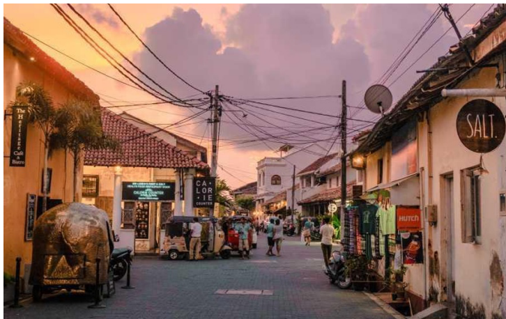
Galle Fort

Take time to explore Galle Fort, a UNESCO World Heritage Site, which is incomparable to anywhere else in Sri Lanka. Entering through the `new` English gate or the `old` Dutch gate is akin to stepping into a different realm. Within, about 600 houses, each with various degrees of renovation to their original Dutch architecture, crowd narrow, cobblestone streets with Old World charm. The thick, high ramparts that protect and distinguish the fort are today used for romantic evening strolls, early morning power walks, and convenient viewpoints to catch the sweaty action of the local village's cricket games and the international games held in the adjacent Galle cricket stadium. Visit Dutch period churches and the museums.