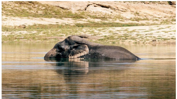
Elephant

Gal Oya National Park is one of Sri Lanka's undiscovered natural treasures. Today, take a jeep into the forgotten Nilgala section of the park, once the protectorate of ancient royalty for the abundant medicinal plants and endemic birdlife unique to this ecosystem. Although shy and sometimes hard to spot, most of the animals found on the island reside in this park. Some of the more likely species to look out for include herds of elephants, four species of deer, as well as many bird species. More intrepid guests may opt for a hike to the Makara River mouth with one of our expert naturalists to further experience the jungle by seeing wildlife on foot.