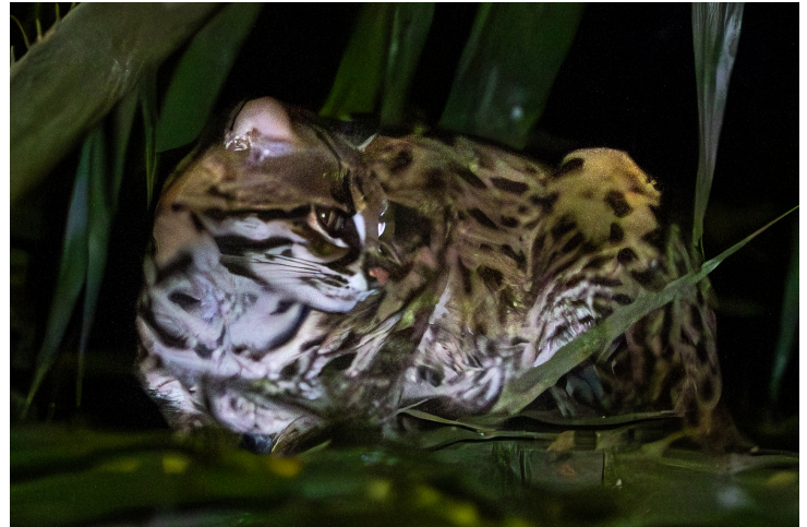
Clouded Leopard

Spend two more days in this magical location. Set out on an early morning river cruise through the panoramic hues of sunrise to explore this region's natural beauty and rich wildlife diversity. Trek through the jungle to search for wildlife. Learn from an orangutan expert. Embark on a short boat ride and transfer to the famous Gomantong Caves to spend an afternoon exploring. At dusk, see a mind-boggling bat exodus, where over one million bats emerge from the cave to feed. Cruise at night in search of nocturnal wildlife on the riverbanks.