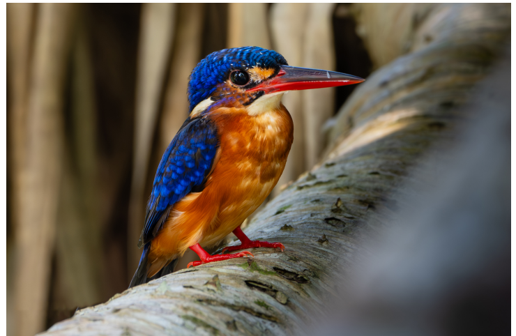
Blue-eared Kingfisher

Explore the Sepilok Forest Reserve and its surroundings. Take an early morning canopy walk searching for birds and mammals unique to this region. Visit the Sepilok Orangutan Rehabilitation Centre and witness these gentle primates feed and interact in the rainforest. Enjoy day and night treks through the forest to observe wildlife including a canopy walk at dusk to witness giant red flying squirrels emerging from their nests and “flying” up to 500ft between trees.