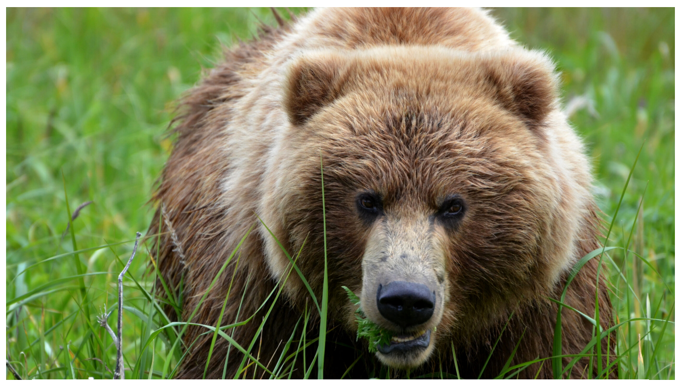
Alaskan Brown Bear