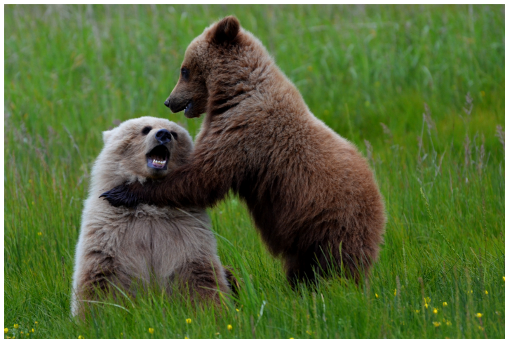
Alaskan Brown Bear Cubs

Falls to work on observing and photographing the iconic Alaskan brown bears fishing for jumping salmon.