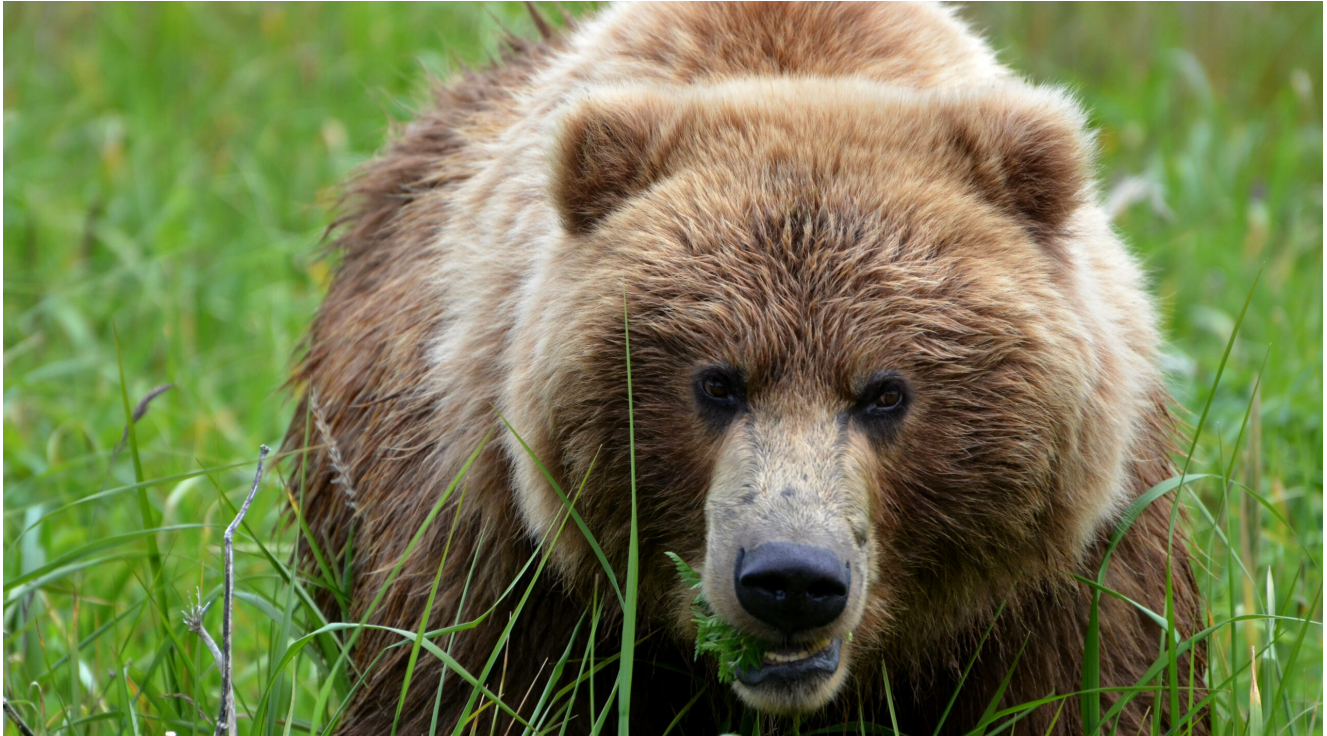
Alaskan Brown Bear