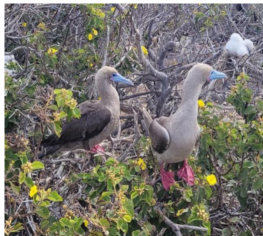
Red-footed Boobies

Anchor in the huge flooded volcanic caldera that created Darwin Bay. As you approach, observe the walls of the caldera, which provide wonderful ledges for the very rare Galápagos fur seals and nesting sites of Red-billed Tropicbirds. You will hike up a stony stairway known as Prince Philip's Steps for great views of Red-footed and Nazca Booby colonies on the way to the Wedge-rumped (Galápagos) Storm-Petrel colony. The island's largest Red-footed Booby nesting site is located here too. Keep an eye out for the elusive Short-Eared owl that hunts for Storm-Petrels during the day.