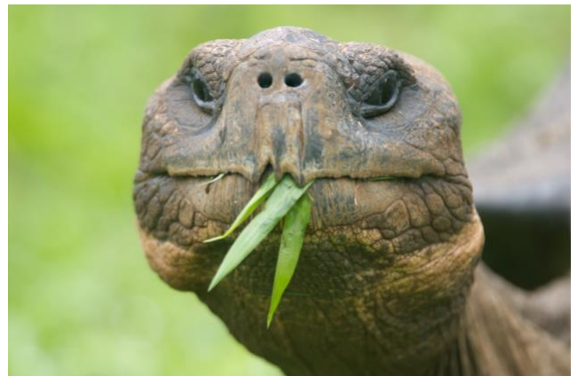
Giant Tortoise

After breakfast, you'll stop briefly at Post Office Bay, where you can continue the whalers' tradition of dropping a letter or postcard in the box and taking one to hand deliver to someone else. The fantastic landscape of the Floreana highlands is decorated with lichens and epiphytes, while the waters around the island are great for dolphins so keep your eyes open! These waters are also rich with seabirds, such as Waved Albatross, three species of Storm-Petrels, Galápagos Shearwaters, and large flocks of diving boobies. You'll spend time visiting Champion Islet off the coast of Floreana before navigating to Santa Cruz Island for a quiet dinner in Academy Bay.