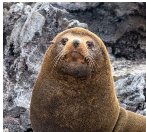
Galapagos Fur Seal

You'll enjoy the last landing site teeming with wildlife and wander past many breeding Blue-footed Boobies and a large colony of Magnificent Frigatebirds. Hopefully, you'll find males of both species in full display, the boobies sky-pointing and showing off their bright blue feet as they dance and the frigates calling for females with their wings spread wide and their dramatic red throat pouches inflated – an unforgettable sight! You also have the chance to see Galápagos sea lions, marine iguanas, Striated Herons, Brown Noddies, Swallow-tailed Gulls, and Lava Gulls. The endemic palo santo and low, bushy prickly pear cacti add great scenery to the amazing abundance of Galápagos wildlife. You'll reluctantly depart for Baltra and bid farewell to the Samba and its crew.