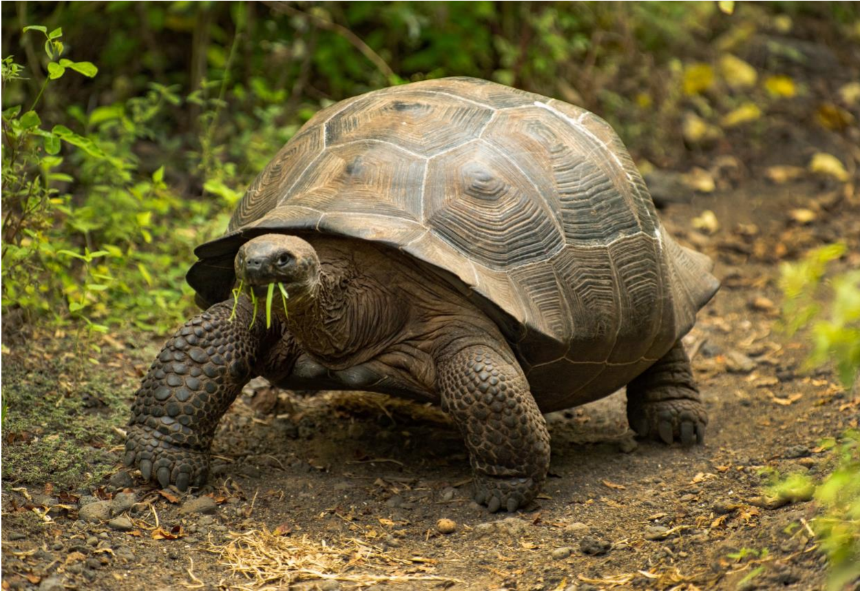
Galapagos Giant Tortoise