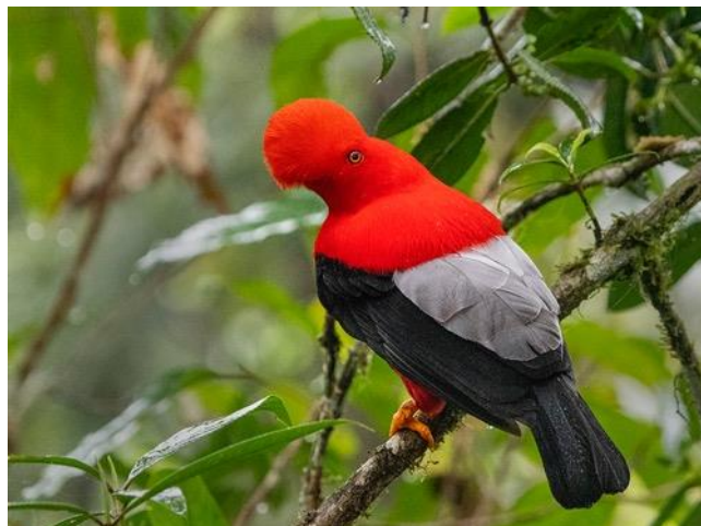
Andean Cock-of-the-rock

Spend the morning bird-watching a variety of dazzling, colorful birds around the lodge at Bellavista, including countless colorful hummingbirds that frequent feeders on the lodge grounds. Return to Quito after lunch.