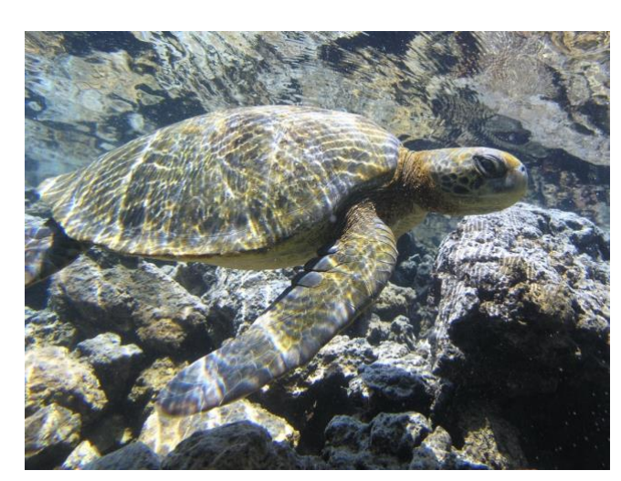
Green Sea Turtle

En route to Fernandina, keep your eyes out for whales in the cold, deep water on the western side of the