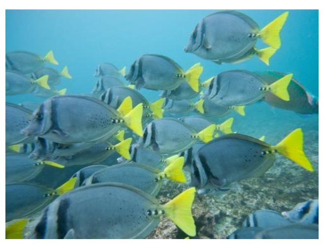
Yellow-tailed Surgeonfish

If the light is good in the early morning, you'll visit the surreal landscape of Sombrero Chino (Chinese Hat), a symmetrical cinder cone. Lava tubes run like petrified rivers and white sand from eroded coral surrounds the black rock. This afternoon, land at Bartolomé and climb to the 360ft-high summit for a gorgeous, iconic view of Pinnacle Rock and the surrounding bays. Then land on the beach for a short walk through mangroves and dune vegetation. Galápagos Penguins are often present in small numbers near Pinnacle Rock so you will have a decent chance to snorkel with or near the penguins, and maybe even whitetip reef sharks (harmless but exciting)! Also enjoy colorful starfish, tropical fish, and amazing underwater lava formations.