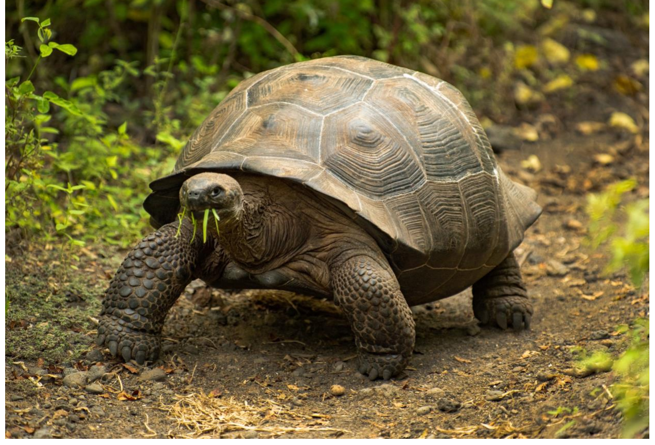
Galapagos Giant Tortoise