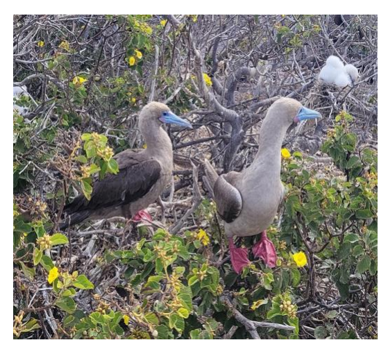
Red-footed Boobies

Frigatebirds are ceaseless with aerial displays of kleptoparasitism as they "dog-fight" along the cliffs for scarce nesting material. Genovesa's four species of Darwin's finches – Common Cactus-Finch, Green Warbler-Finch, Gray Warbler-Finch, and Large Ground-Finch – show huge variation in bill size, and you can find all four species Cheesemans' Ecology Safaris