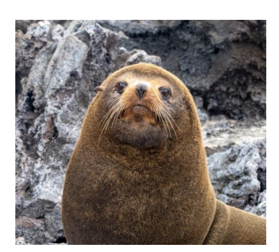
Galapagos Fur Seal

You'll enjoy the last landing site teeming with wildlife and wander past many breeding Blue-footed Boobies and a large colony of Magnificent Frigatebirds. Hopefully, you'll find males of both species in full display, the boobies sky-pointing and showing off their bright blue feet as they dance and the frigates calling for females with their wings spread wide and their dramatic red throat pouches inflated — an unforgettable sight! You also have the chance to see Galápagos sea lions, marine iguanas, Striated Herons, Brown Noddies, Swallowtailed Gulls, and Lava Gulls. The endemic palo santo and low, bushy prickly pear cacti add great scenery to the amazing abundance of Galápagos wildlife. You'll reluctantly depart for Baltra and bid farewell to the Samba and its crew.