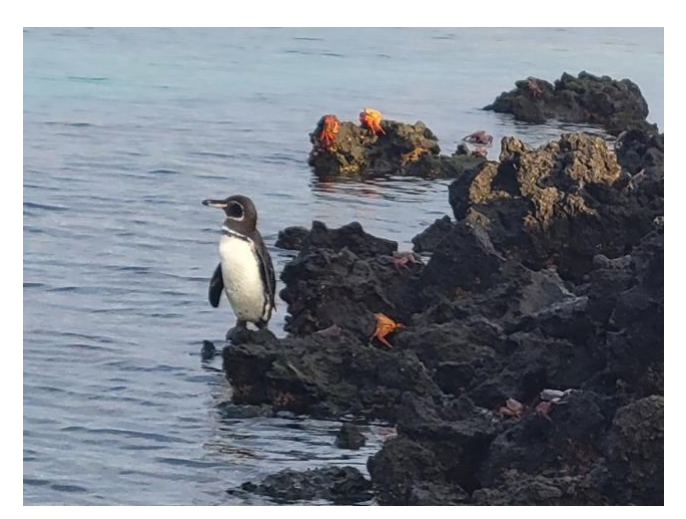
Galapagos Penguin

fresh lava. To protect the algae-covered coastline that marine iguanas depend on for food, snorkeling is no longer allowed.