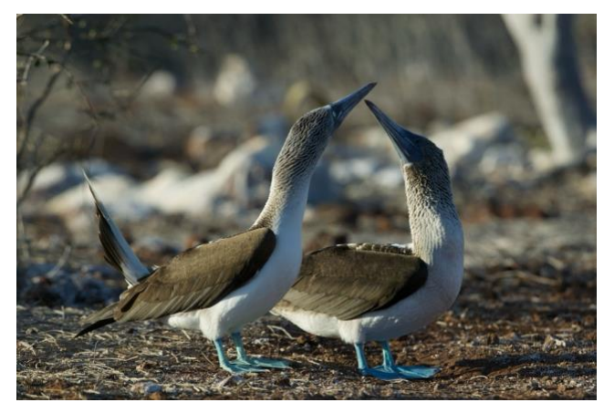
Blue-footed Boobies

In the morning you will land behind Punta Cormorant for a walk to the Flamingo Lagoon in search of shorebirds and a few flamingoes. The plant life here is unique and includes another species of the endemic composite Scalesia . After returning to the Samba , you will sail to one of the best spots in the world for snorkeling – Devil's Crown. You normally see rays, sea turtles, surgeonfish, parrotfish, jacks, wrasses, and many other tropical fish. Floreana also holds compelling human history that includes pirate caves, European settlers, the islands' first citizen birth, and unexplained disappearances. Experience a piece of this history with a visit to Baroness Lookout.