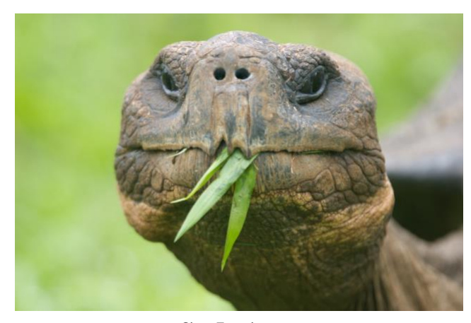
Giant Tortoise

After breakfast, you'll stop briefly at Post Office Bay, where you can continue the whalers' tradition of dropping a letter or postcard in the box and taking one to hand deliver to someone else. The fantastic landscape of the Floreana highlands is decorated with lichens and epiphytes, while the waters around the island are great for dolphins so keep your eyes open! These waters are also rich with seabirds, such as Waved Albatross, three species of Storm-Petrels, Galápagos Shearwaters, and large flocks of diving boobies. You'll spend time visiting Champion Islet off the coast of Floreana before navigating to Santa Cruz Island for a quiet dinner in Academy Bay.