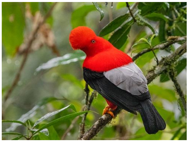
Andean Cock-of-the-rock

After your first snorkeling of the trip, you'll end your day with excellent views of Red-footed Boobies and Great Frigatebirds nesting with unparalleled density. Following the cliff edge, photograph and observe incoming boobies and frigatebirds.