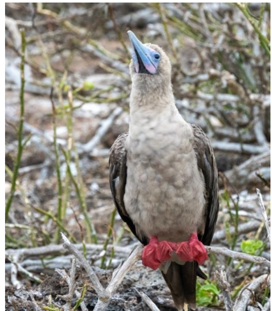
Red-footed Booby

After your first snorkeling of the trip, you'll end your day with excellent views of Red-footed Boobies and Great Frigatebirds nesting with unparalleled density. Following the cliff edge, photograph and observe incoming boobies and frigatebirds. Frigatebirds are ceaseless with aerial displays of kleptoparasitism as they "dog-fight" along the cliffs for scarce nesting material. Genovesa's four species of Darwin's finches – Common Cactus-Finch, Green Warbler-Finch, Gray Warbler-Finch, and Large Ground-Finch – show huge variation in bill size, and you can find all four species here (one of the most outstanding sites that you will visit for Darwin's finches along with the Highlands of Santa Cruz). Unlike trips with shorter itineraries, you'll have the luxury of anchoring in the calm waters of Darwin Bay for the night.