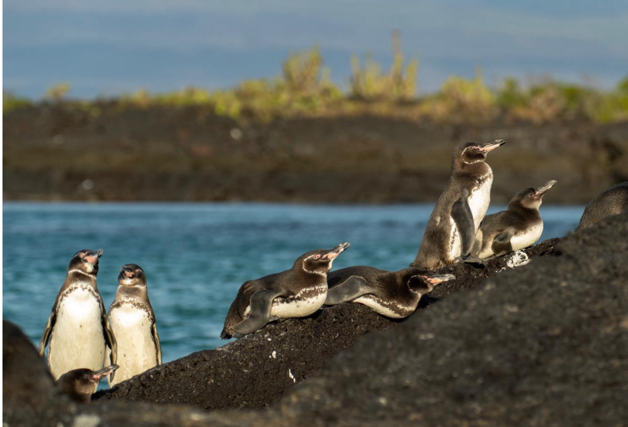
Galapagos Penguins