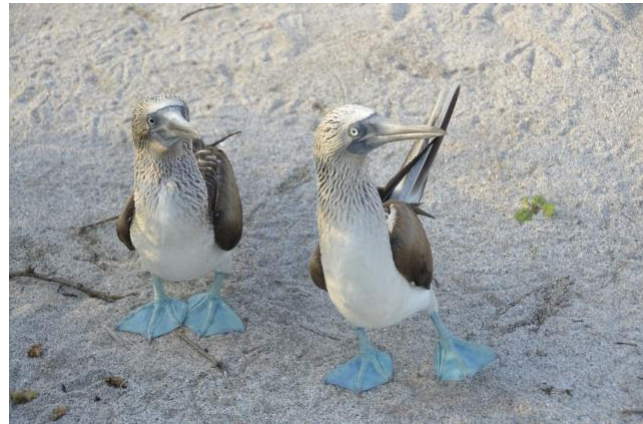
Blue-footed Boobies

The small yet incredible island of Plaza Sur (South Plaza) is your afternoon destination. This beautiful island is home to many land and marine iguanas. The colorful landscape is covered with reds and greens of Portulaca that may have yellow flowers the iguanas enjoy eating. In the giant prickly pear cactus, you can compare the Common Cactus-Finch alongside Small and Medium Ground-Finches. At the top of the island bachelor sea lions escape from the competition of stronger males as Red-billed Tropicbirds fly gracefully by.