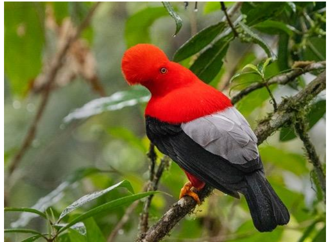
Andean Cock-of-the-rock

All routings and visitor sites on the Galápagos Islands are subject to change by the Galápagos National Park Service to minimize traffic and impact.