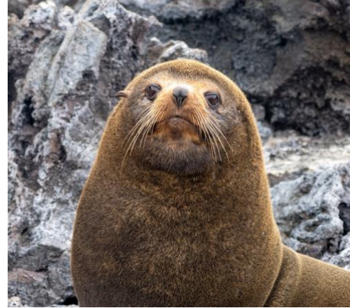
Galapagos Fur Seal

You'll enjoy the last landing site teeming with wildlife and wander past many breeding Blue-footed Boobies and a large colony of Magnificent Frigatebirds. Hopefully, you'll find males of both species in full display, the boobies sky-pointing and showing off their bright blue feet as they dance and the frigates calling for females with their wings spread wide and their dramatic red throat pouches inflated – an unforgettable sight! You also have the chance to see Galápagos sea lions, marine iguanas, Striated Herons, Brown Noddies, Swallow-tailed Gulls, and Lava Gulls. The endemic palo santo and low, bushy prickly pear cacti add great scenery to the amazing abundance of Galápagos wildlife. You'll reluctantly depart for Baltra and bid farewell to the Samba and its crew.