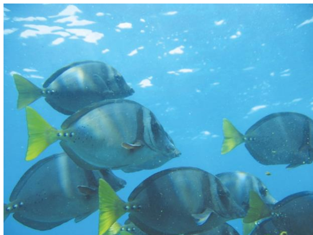
Yellow-tailed Surgeonfish

This afternoon, you'll sail to Gardner Bay, one of the most beautiful beaches in the Galápagos. A nearby snorkel is likely to find you in the water with playful sea lions. Galápagos sea lions populate the surf while the remarkably brave Española Mockingbird may peck your water bottle for water. Enjoy photographing shorebirds and sea lions, looking for the Large Cactus-Finch, or walking along the beautiful beach.