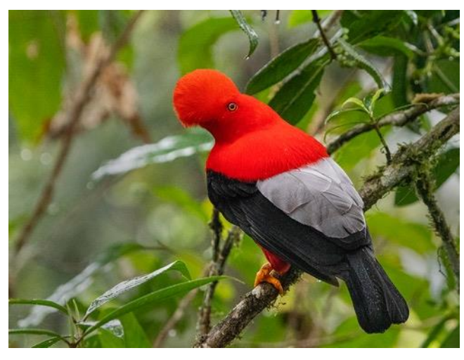
Andean Cock-of-the-rock

All routings and visitor sites on the Galápagos Islands are subject to change by the Galápagos National Park Service to minimize traffic and impact.