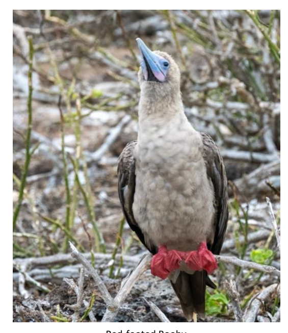
Red-footed Booby © Eddy Thys

After your first snorkeling of the trip, you'll end your day with excellent views of Red-footed Boobies and Great Frigatebirds nesting with unparalleled density. Following the cliff edge, photograph and observe incoming boobies and frigatebirds. Frigatebirds are ceaseless with aerial displays of kleptoparasitism as they "dog-fight" along the cliffs for scarce nesting material. Genovesa's four species of Darwin's finches — Common Cactus-Finch, Green Warbler-Finch, Gray Warbler-Finch, and Large Ground-Finch — show huge variation in bill size,