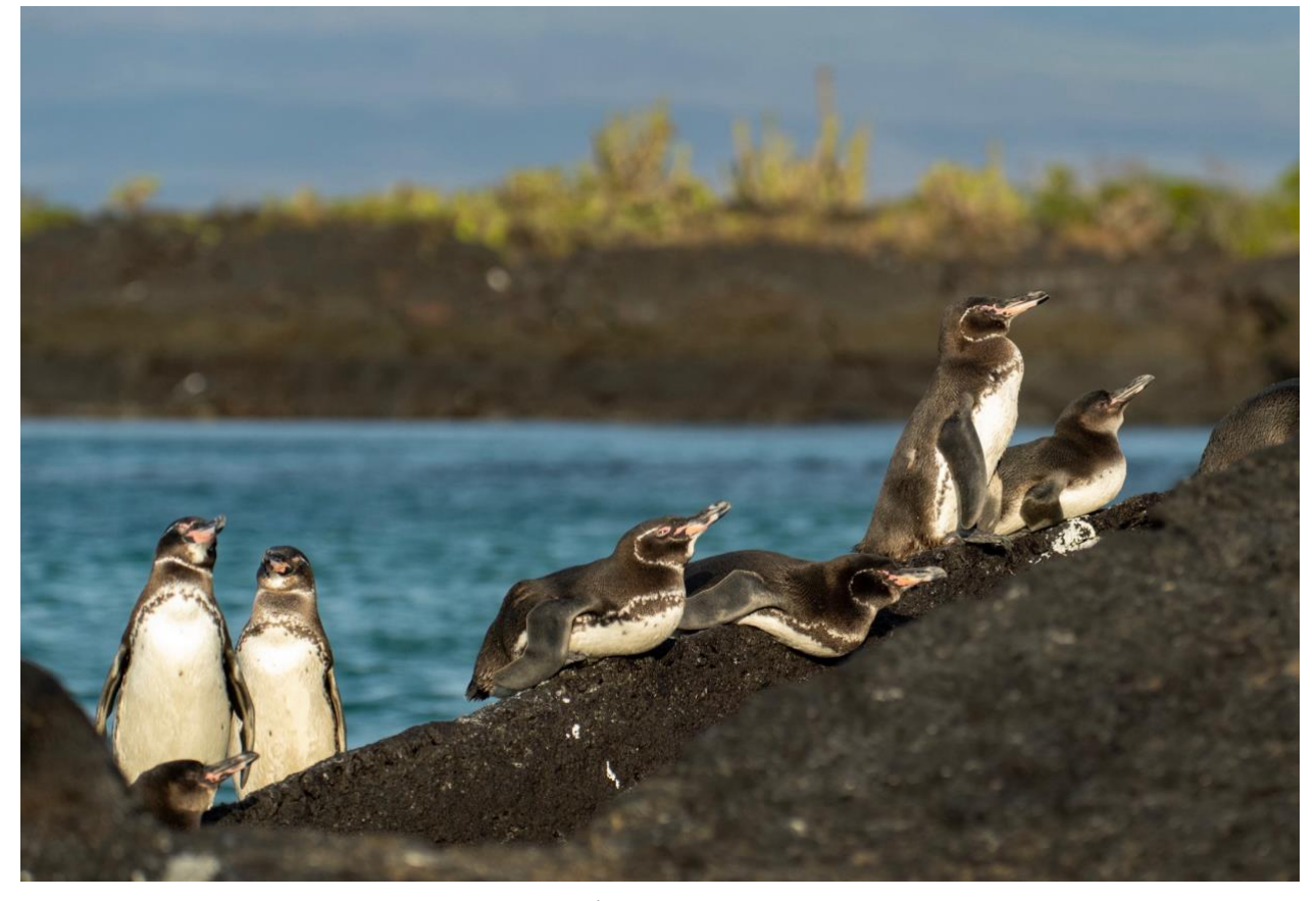
Galapagos Penguins