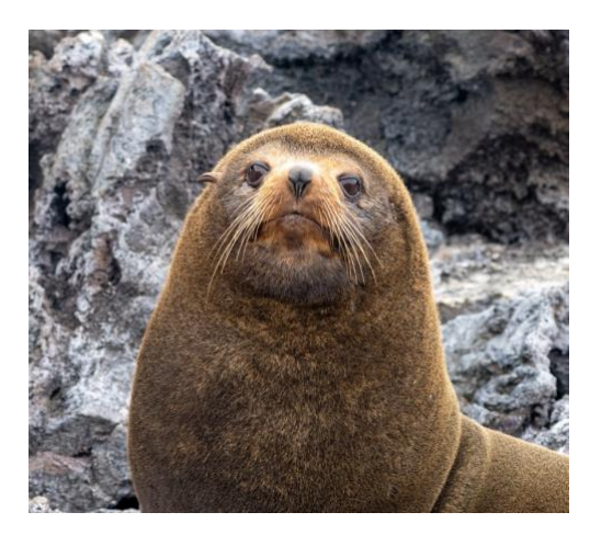
Galapagos Fur Seal

You'll enjoy the last landing site teeming with wildlife and wander past many breeding Blue-footed Boobies and a large colony of Magnificent Frigatebirds. Hopefully, you'll find males of both species in full display, the boobies sky-pointing and showing off their bright blue feet as they dance and the frigates calling for females with their wings spread wide and their dramatic red throat pouches inflated — an unforgettable sight! You also have the chance to see Galápagos sea lions, marine iguanas, Striated Herons, Brown Noddies, Swallowtailed Gulls, and Lava Gulls. The endemic palo santo and low, bushy prickly pear cacti add great scenery to the amazing abundance of Galápagos wildlife. You'll reluctantly depart for Baltra and bid farewell to the Samba and its crew.