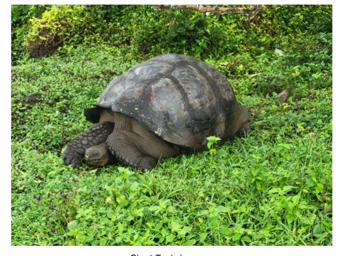
Giant Tortoise

Upon reaching Santa Cruz, you'll anchor in Academy Bay beside the bustling small town of Puerto Ayora, the islands' primary population center. You'll travel to the Santa Cruz highlands to seek out elusive island endemics in beautifully unique habitats. You will