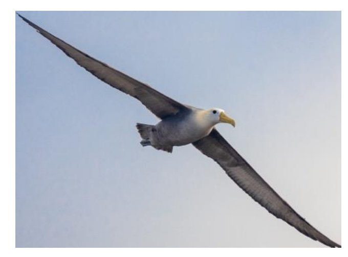
Waved Albatross

In the morning, you will land behind Punta Cormorant for a walk to the Flamingo Lagoon in search of shorebirds and a few flamingoes. The plant life here is unique and includes another