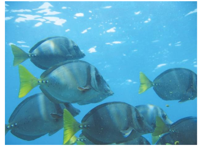
Yellow-tailed Surgeonfish

This afternoon, you'll sail to Gardner Bay, one of the most beautiful beaches in the Galápagos. A nearby snorkel is likely to find you in the water with playful sea lions. Galápagos sea lions populate the surf while the remarkably brave Española Mockingbird may peck your water bottle for water. Enjoy photographing shorebirds and sea lions, looking for the Large Cactus-Finch, or walking along the beautiful beach.