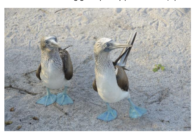
Blue-footed Boobies

The small yet incredible island of Plaza Sur (South Plaza) is your afternoon destination. This beautiful island is home to many land and marine iguanas. The colorful landscape is covered with reds and greens of Portulaca that may have yellow flowers the iguanas enjoy eating. In the giant prickly pear cactus, you can compare the Common Cactus-Finch alongside Small and Medium Ground-Finches. At the top of the island bachelor sea lions escape from the competition of stronger males as Red-billed Tropicbirds fly gracefully by.