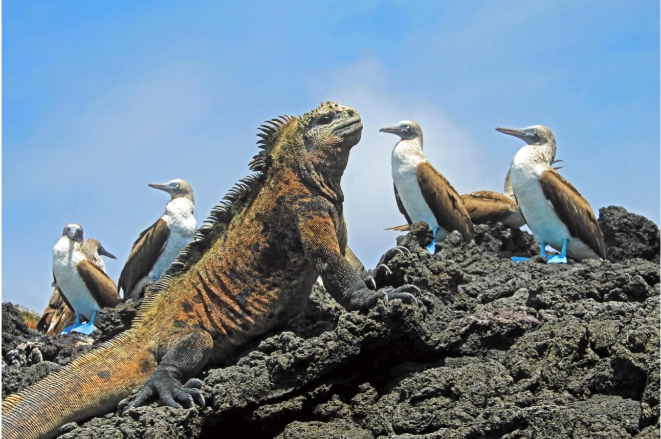
Marine Iguana and Blue-footed Boobies