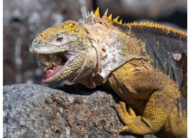
Land Iguana

You will have the rare opportunity to visit Marchena, making your experience truly unique. Although landings are not permitted, it is one of the best places to snorkel with tropical fish, rays, sea turtles, sharks, and eels. You may also find hermatypic (reef building) coral formations here, an uncommon sight in the rest of the archipelago. During your navigation to and from Marchena, you sail through some of the most whale-rich waters in the region, so keep your eyes on the horizon and your binoculars ready!