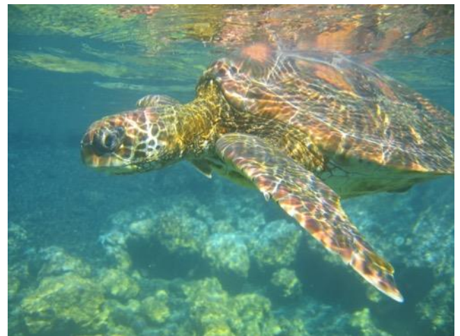
Green Sea Turtle