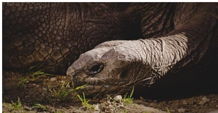
Giant Tortoise

Upon reaching Santa Cruz, you'll anchor in Academy Bay beside the bustling small town of Puerto Ayora, the islands' primary population center. You'll travel to the Santa Cruz highlands to seek out elusive island endemics in beautifully unique habitats. You will explore Los Gemelos, two incredible volcanic sinkholes surrounded by Scalesia forest. The elegantly tall Scalesia trees evolved from beach composites, making it essentially the world's largest daisy. In the highlands you may see the shy Galápagos Rail, Short-eared Owl, Large and Small Tree Finches, Vegetarian Finch, and the famous tool-using Woodpecker Finch. You will also walk through a lava tube left over from Santa Cruz's active volcanic island-building days.