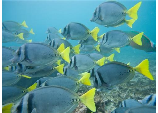
Yellow-Tailed Surgeonfish

In the morning you will land behind Punta Cormorant for a walk to the flamingo lagoon in search of shorebirds and a few flamingoes. The plant life here is unique and includes another species of the endemic composite Scalesia . After returning to the Samba , you will sail to one of the best spots in the world for snorkeling – Devil’s Crown. You normally see rays, sea turtles, surgeonfish, parrotfish, jacks, wrasses, and many other tropical fish. Floreana also holds a compelling human history that includes pirate caves, European settlers, the islands’ first citizen birth, and unexplained disappearances. Experience a piece of this history with a visit to Baroness Lookout.