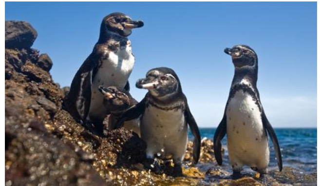
Galápagos Penguins

Across the calm Canal Bolivar, separating Isabela from Fernandina, sits Punta Espinoza, one of the most wildlife-rich sites of the trip. Fernandina, the youngest of the Galápagos Islands, is one of the world's most pristine islands because no known introduced animals have become established here. You'll have the unique opportunity to observe and photograph marine iguanas sunbathing in piles by the hundreds. The famous flightless cormorant also inhabits this island along with Galápagos penguins, lava lizards, and pelicans. Take a walk along the relatively young basalt (lava rock) to find lava cactus ( Brachycereus nesioticus ), the only species in its genus, growing directly out of what still seems like fresh lava. While snorkeling is not allowed to protect the algae-covered coastline that marine iguanas depend on for food, you will have ample opportunity to observe them as they navigate the reefs.