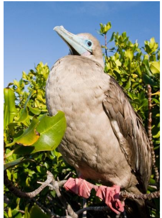
Red-footed Booby

After your first snorkeling of the trip, you'll end your day with excellent views of Red-footed Boobies and Great Frigatebirds nesting with unparalleled density. Following the cliff edge, photograph and observe incoming boobies and frigatebirds. Frigatebirds are ceaseless with aerial displays of kleptoparasitism as they "dog-fight" along the cliffs for scarce nesting material. Genovesa's four species of Darwin's finches – Common Cactus Finch, Green Warbler Finch, Gray Warbler Finch, and Large Ground Finch – show huge variation in bill size, and you can find all four species here (one of the most outstanding sites that you will visit for Darwin's finches along with the Highlands of Santa Cruz). Unlike trips with shorter itineraries, you'll have the luxury of anchoring in the calm waters of Darwin Bay for the night.