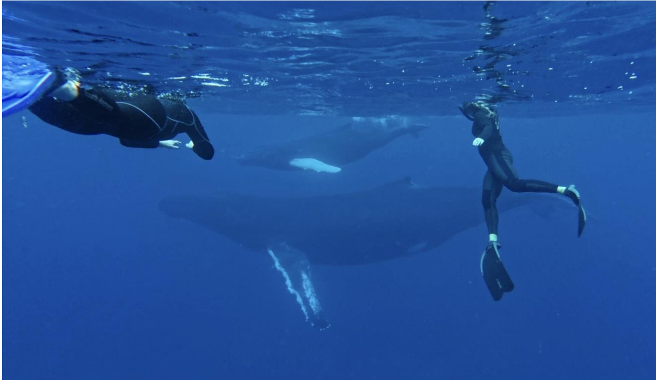
Humpback Whales