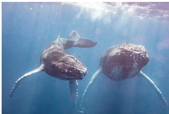
Humpback Whales

You may have some “whale-waiting” time while looking for cooperative humpback whales, but that time is quickly forgotten when you are amid surface activity and soft in-water encounters. Most of the time you will find whale activity nearby. In fact, you will more often ask, “Which whale should we watch?” rather than, “Where are the whales?” The biggest obstacle to success is spending too much time with uncooperative whales, so be prepared to leave one group in search of more cooperative ones; be patient as you may approach many whales before finding an interested group that allows us to join them in their element and on their terms.