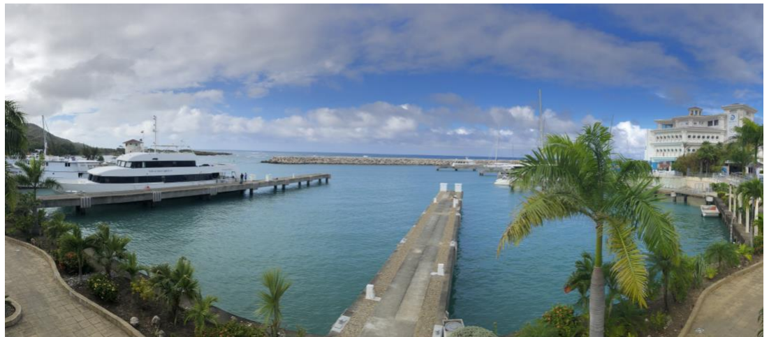
Ocean World Marina

Arrive at the marina in the early evening to board the Turks and Caicos Explorer II . After dinner, you'll navigate to the mooring site while you spend the night in your comfortable cabin.