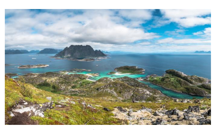
Ile de Skrova

Sail towards Trollfjord, a steep and narrow fjord that epitomizes the rugged beauty of the Lofoten Archipelago. Take in the towering walls as you drift through the passage before disembarking at the base of the fjord to begin your trek to Trollfjordhytta. This hut-like cabin serves as a refuge by the lake where you'll have