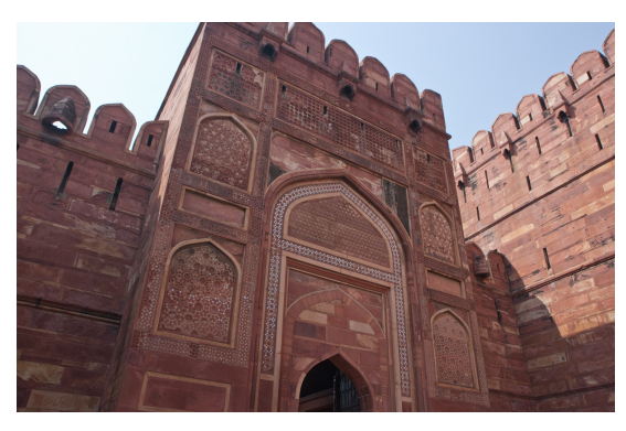
Agra Fort

Wake up early to capture colors of the Taj at sunrise, a truly magical experience! Return to your hotel for breakfast, then visit the remarkable Agra Fort. This historic fortress features imposing 70-foot-high walls that stretch 1.5 miles around the complex. Inside, you'll find a range of well-preserved buildings including palaces, mosques, and audience halls, many of which were constructed during Emperor Shah Jahan's rule. The fort offers a fascinating insight into Mughal architecture and the grandeur of the era.