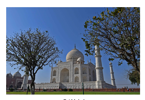
Taj Mahal

Later, enjoy a beautiful sunset view of the Taj Mahal from Mehtab Bagh, a serene garden providing a unique perspective of this iconic monument across the Yamuna River. Little needs to be said about the allure of the Taj Mahal, which is always the main reason for every tourist's visit to Agra. Built by Shah Jahan, the Taj Mahal is a white