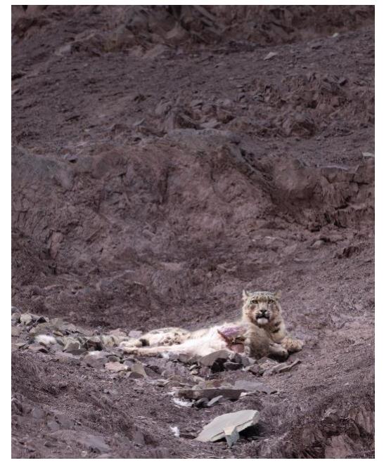
Snow Leopard

Each morning, and throughout the day, the spotters will split up to track for snow leopards in abutting valleys. Your daily movements will be based on reports from the spotters. If they spot a snow leopard, you will use a combination of driving and hiking to get to a vantage point. While waiting for word of a spotting, you'll have ample time for birdwatching, nature walks, and visits to local communities to learn more about conservation, local ways of life, and the storied region you are immersed in.