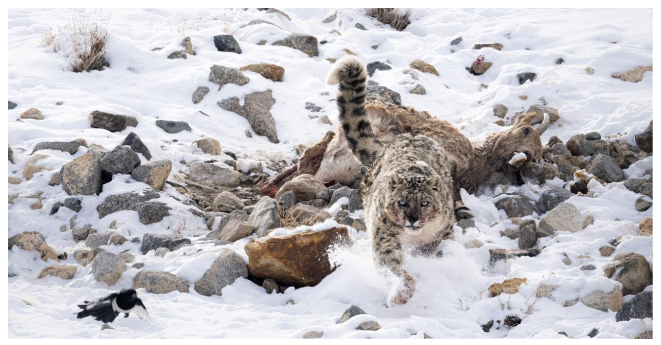
Snow Leopard