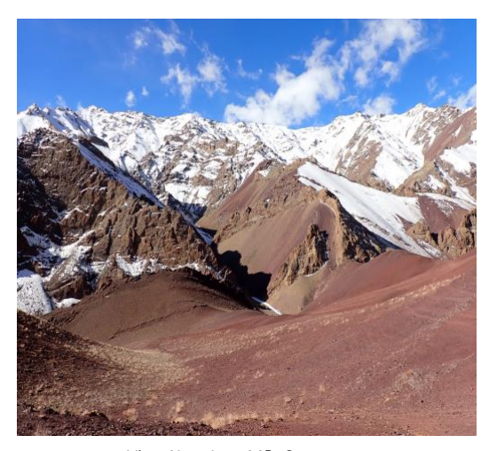
View Near LungMār Camp

Nestled in a remote valley in Ladakh's Trans-Himalayas, the camp creates an exclusive and authentic experience in a stunningly beautiful setting. As permanent construction is not allowed in this ecologically sensitive landscape, camp infrastructure is thoughtfully designed to keep your footprint to a minimum while providing you with top-notch facilities. This is combined with a focus on empowering community-based