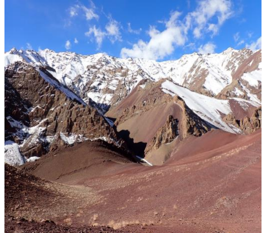
View Near LungMār Camp

Nestled in a remote valley in Ladakh's Trans-Himalayas, the camp creates an exclusive and authentic experience in a stunningly beautiful setting. As permanent construction is not allowed in this ecologically sensitive landscape, camp infrastructure is thoughtfully designed to keep your footprint to a minimum while providing you with top-notch facilities. This is combined with a focus on empowering community-based conservation, so for each guest that stays at camp, $350 is contributed towards projects including dog sterilization programs in wildlife areas to reduce dog-wildlife conflict and building predator-proof corrals in the region which aid in snow leopard conservation by protecting valuable livestock. Tracking the most elusive big cat requires years of expertise and a focus on location – LungMār has both.