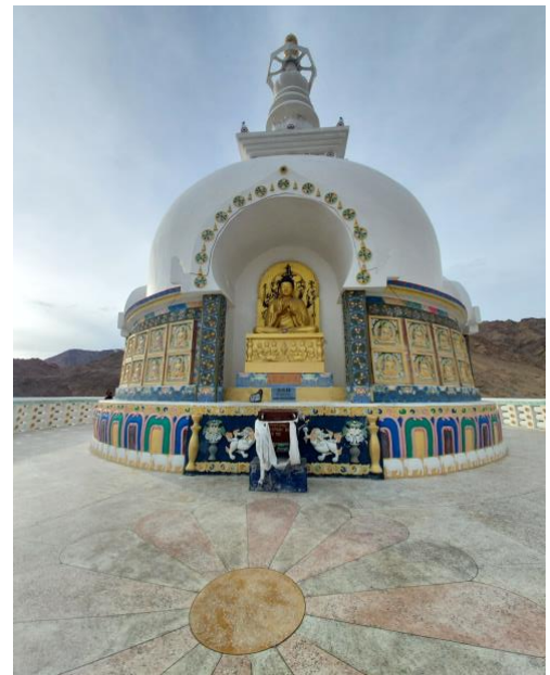
Shanti Stupa

After the morning prayer visit, return to the hotel for breakfast. Spend the afternoon acclimating and resting, then take an early evening walk around the town of Leh and watch for a beautiful sunset.