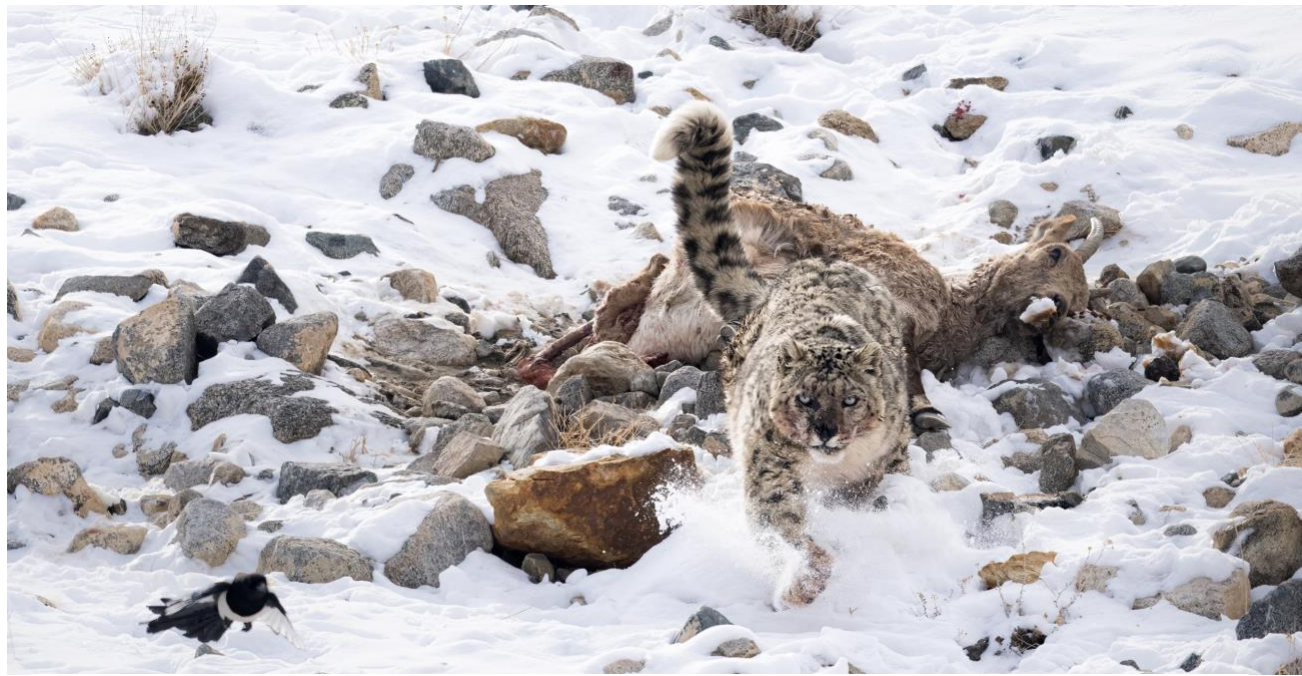
Snow Leopard