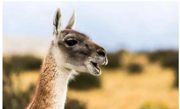
Guanaco

If arriving from our South Georgia and Antarctic Peninsula trip , you will take a direct flight to El Calafate. There are no direct flights from Ushuaia to Punta Arenas. Our local agent will transfer you from the airport to the hotel. If you would like to arrive earlier, we can arrange divergent airport transfers and extra nights.