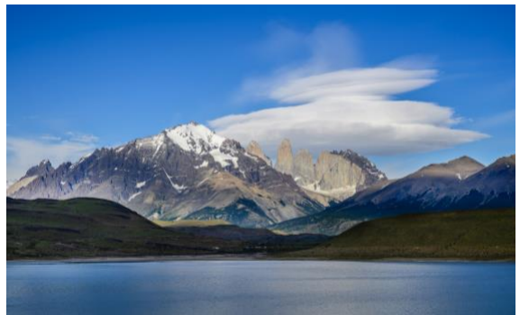
Landscape

You will explore the puma hunting grounds located on the eastern flank of the park and throughout the property of Estancia Laguna Amarga, where exclusive access and a strong rapport with the owners provide a unique advantage. This area, encompassing the northern coast of Sarmiento Lake, Laguna Amarga, and Laguna Azul, is renowned for its dense puma population, one of the largest concentrations in the wild.