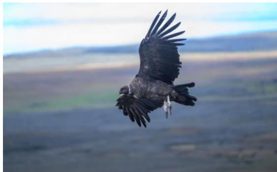
Andean Condor

After a final morning enjoying Torres del Paine, you'll spend the afternoon at Olga Teresa Ranch which boasts the world's largest concentration of Andean Condor roosts. The steep cliffs host as many as 100 birds with excellent access for viewing and photography, and you'll have a chance to climb to the top of Cerro Palomares, a 700-foot-high hill to view the condors. Olga Teresa Ranch is a protected space for these beautiful birds, as well as an important research site.