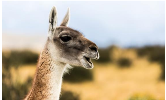
Guanaco

If arriving from our South Georgia and Antarctic Peninsula trip , you will take a direct flight to El Calafate. There are no direct flights from Ushuaia to Punta Arenas. Our local agent will transfer you from the airport to the hotel. If you would like to arrive earlier, we can arrange divergent airport transfers and extra nights.