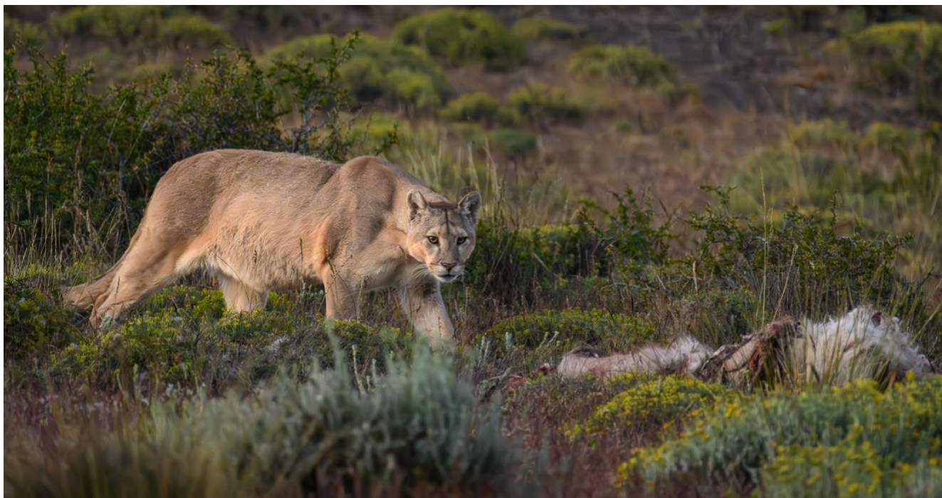
Puma