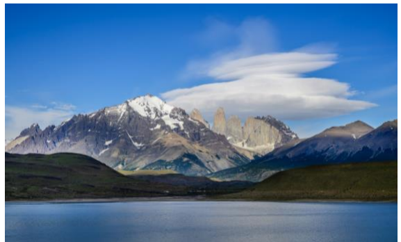
Landscape

You will explore the puma hunting grounds located on the eastern flank of the park and throughout the property of Estancia Laguna Amarga, where exclusive access and a strong rapport with the owners provide a unique advantage. This area, encompassing the northern coast of Sarmiento Lake, Laguna Amarga, and Laguna Azul, is renowned for its dense puma population, one of the largest concentrations in the wild.