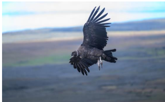
Andean Condor

After a final morning enjoying Torres del Paine, you'll spend the afternoon at Olga Teresa Ranch which boasts the world's largest concentration of Andean Condor roosts. The steep cliffs host as many as 100 birds with excellent access for viewing and photography, and you'll have a chance to climb to the top of Cerro Palomares, a 700-foot-high hill to view the condors. Olga Teresa Ranch is a protected space for these beautiful birds, as well as an important research site.