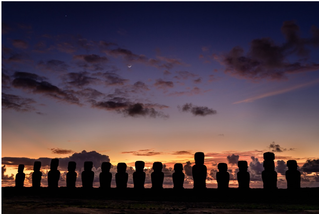
Easter Island Moai