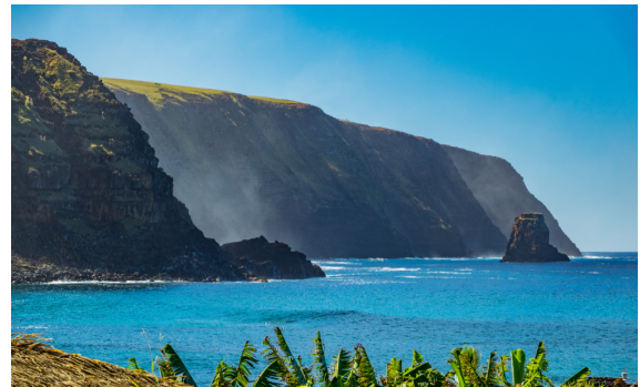
Orongo Village Cliff Face

Situated high on a cliff overlooking the motus on the southwest end of Easter Island, Orongo is a stone village , ceremonial center, and traditional site of the Tangata Manu , a dangerous annual competition between the clans of Easter Island. Last held in 1867, the Tangata Manu competition began when the islanders expected sooty terns to return to nest. Each clan leader chose a member to race and be the first to get and return a sooty tern egg. Contestants scrambled down the steep rock face, braved sharks while swimming across to Motu Nui , then waited on the islet, often for days or weeks, until a sooty tern laid an egg. Once the first egg was found, the contestant would take the egg and race back, all while keeping the egg intact in a reed basket attached to his forehead. The winning clan leader gained prestige and power as the birdman , shaved his head, and lived in ceremonial seclusion for a year while his clan gained sole rights to collect the eggs and birds of Motu Nui for the season. Look along the cliff for petroglyphs revealing the famous birdman motif.