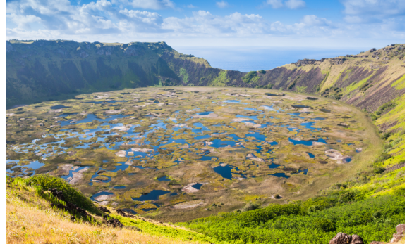
Rano Raraku

This ahu (platform) is the burial site of the first king of Easter Island. In most ahu , the moai lie face down, but here you can find them both face-up and face-down.