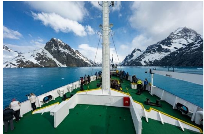
Cooper Bay

A colony of marvelous macaroni penguins and South Georgia's only colony of chinstrap penguins reside here. A hike up through tussock slopes will reward you with macaronis in a frenzy of early breeding season activity. You are sure to see chinstraps traveling through the surf and loafing on the beach or an iceberg. The Government of South Georgia has restricted access to the main chinstrap colony here and on Cooper Island due to a 2004 outbreak of avian cholera, and the