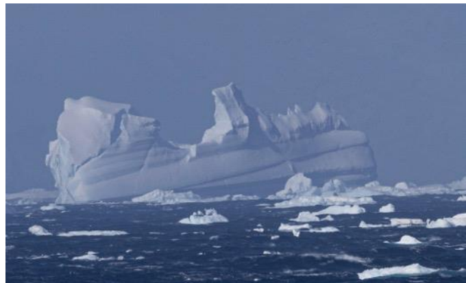
Ship-Sized Iceberg

Captain Cook was the first to lay eyes on South Georgia and his great hope was that he had found the tip of a great southern continent. The name Cape Disappointment reflects his feelings when he found that South Georgia was no continent at all. He was not too impressed with South Georgia without apparent exploitable resources, but the black-browed albatross that breed in large numbers on the sheer slopes did not mind his departure. Although they are less numerous because of long-line fishing practices, they are still impressive in numbers.