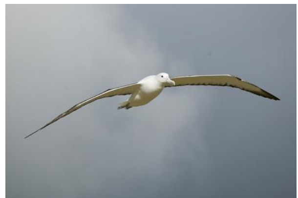
Royal Albatross

Named after the 16th Century English seaman, Sir Francis Drake, this waterway of about 600 miles separates the southernmost tip of South America from Antarctica. You cross the Polar Front approximately halfway across Drake Passage. Those on watch may sight several species of albatross and petrel following the ship; it is a particularly good area for royal albatross and blue petrel. Stay on the lookout for pods of sperm whales and other whales. Almost 500 miles north of the South Shetlands, you will near Cape Horn, with a distant view before turning northeast toward the Beagle Channel. The offshore area is as rich as seawaters can be and seabirds are usually present in huge numbers, especially sooty shearwaters and black-browed albatross if the sea is calm. Sometimes you may see Peale's dolphins in schools of hundreds of individuals. This evening you'll navigate back up the Beagle Channel to dock in Ushuaia.