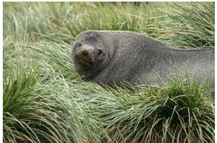
Fur Seal

By morning you'll be far from the Falklands, heading southeast with albatross and other seabirds following the ship. You'll stay busy by joining lectures on photography, wildlife, and ecology, familiarizing yourself on all aspects of ship life, preparing for what to expect on South Georgia Island, and enjoying views from the ship. You'll cross the Polar Front (aka the Antarctic Convergence) where two bodies of water meet, and as the salty, cold Antarctic water mixes alongside warmer, fresher water from the north, the water temperatures plummet from about 39 to 43°F (4 to 6°C) to 32°F (0°C) in about eight cruising hours, creating nutrient-rich waters for birds, fur seals, and whales. Watch and photograph birds on the wing; wandering albatross, black-browed albatross, plus a few southern or northern royal albatross should be following the ship. On previous expeditions, almost a dozen species of petrels (including three storm-petrel and common diving-petrel species), six species of albatross, thousands of Antarctic prions, southern fulmars, greater and sooty shearwaters, and snow petrels have all been sighted. Whales you may encounter include fin, Antarctic minke, and southern right whales. During this time at sea, you'll cross about 730 nautical miles with the prevailing current in our direction.