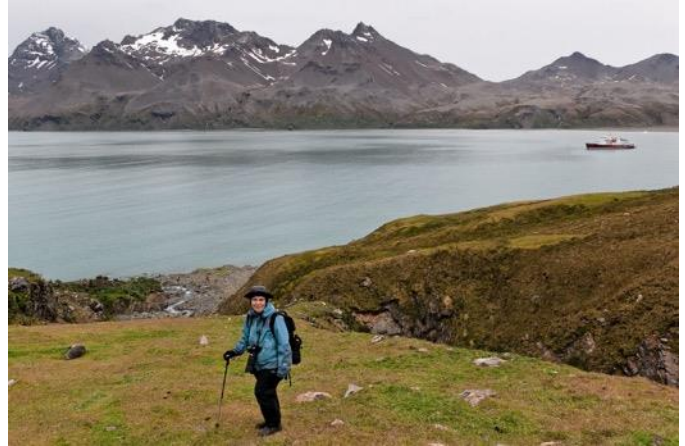
Fortuna Bay

In the lee of the central rib of South Georgia's impressive mountains, you will have good chances for clear skies and calm conditions. Fortuna Bay ends in an extended glacial alluvial plain covered with a fine grass where a photogenic king penguin colony resides. Search for nesting light-mantled albatross on the steep tussock slopes above the king penguin colony.