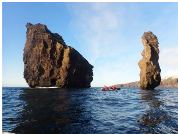
Deception Island

These are a string of volcanic islands, some still active, that run parallel to the Antarctic Peninsula across the Bransfield Strait . Fondly known as the "Banana Belt of Antarctica," these islands boast the richest concentrations of terrestrial wildlife in the Antarctic because of their proximity to the rich upwelling waters from the great Circumpolar Current. Even with our luxuriously in-depth itinerary, we will have to choose between many very compelling sites.