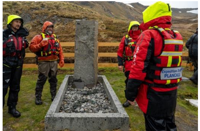
Shackleton's Grave

If open for visitation, you arrive just before the young, overwintering wandering albatross fledge, starting years of seafaring life before finally returning as young adults to breed. Each pair of albatross has a private estate with at least 30 square meters of open space around its nest site for courtship and takeoffs and landings, a real contrast with the king penguin's territory of less than one square meter. Tragically, wandering albatross are declining rapidly because of illegal fishing vessels mining 'white gold', another name for Chilean seabass or Patagonia toothfish.