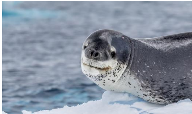
Leopard Seal

From the South Shetlands, we sail southwest across the Bransfield Strait into the fabled Gerlache Strait . Here you can expect whale sightings to ring out from the bridge as the Antarctic Peninsula landscape rises into a glacier-draped view of mountainous proportion. You'll sail the waters around Anvers Island, Dallmann Bay to the north, and the Gerlache to the east. Hope for magnificent sunsets, sculpted blue icebergs, and close penguin and whale encounters, each with the potential for an experience that you will never forget.