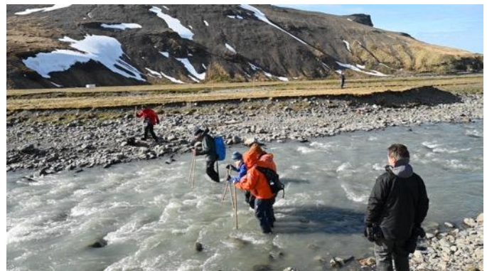
St. Andrew's Bay

Few places in the world are so far beyond description that any attempt rings hollow. St. Andrews Bay is one, with more than 150,000 pairs of king penguins forming a colony that covers a vast landscape. You will be mesmerized as you view penguins spanning multiple football fields. As you walk over the glacial moraine bordering the colony, the large visual mass of penguins along with their calls and smells hit you, and is an experience you will never forget. You must see, hear, and smell it to believe it.