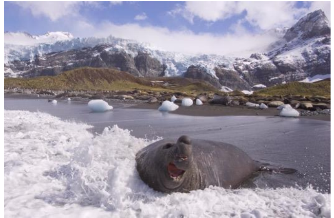
Elephant Seal

During this time of year, king penguins will be far from the only attraction at St. Andrews. The southern elephant seal, the world's largest seal, gather here by the thousands creating one of the densest concentrations of life on the planet. Expect to see thousands of females with young pups nursing. You can hope to witness beachmaster combat and breeding bouts. St. Andrews Bay has a reputation for volatile weather because it lies at the foot of three glaciers, where cold air can pour off these glaciers turning a calm quiet morning into a howling, harrowing landscape of katabatic winds in an astonishingly short time, so do pay attention to our expedition leaders!