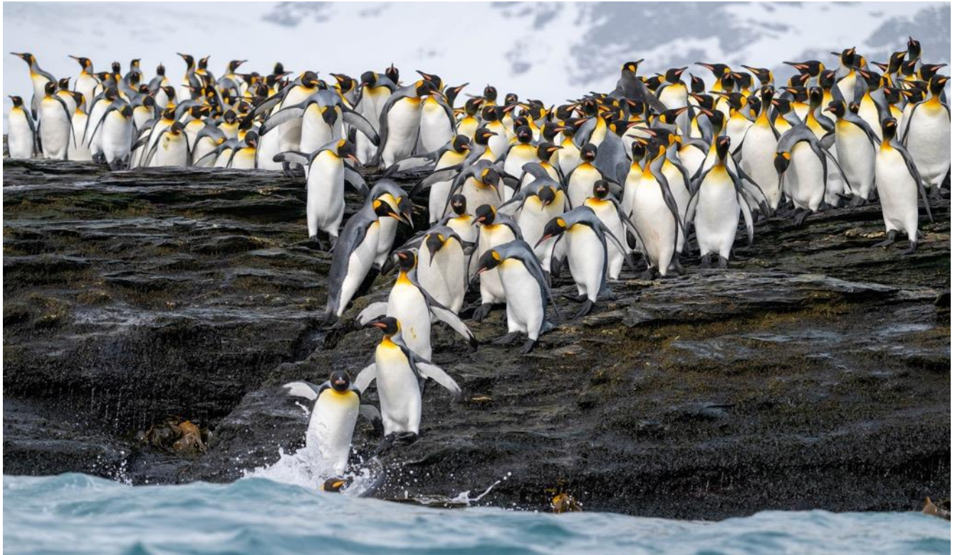
King Penguins