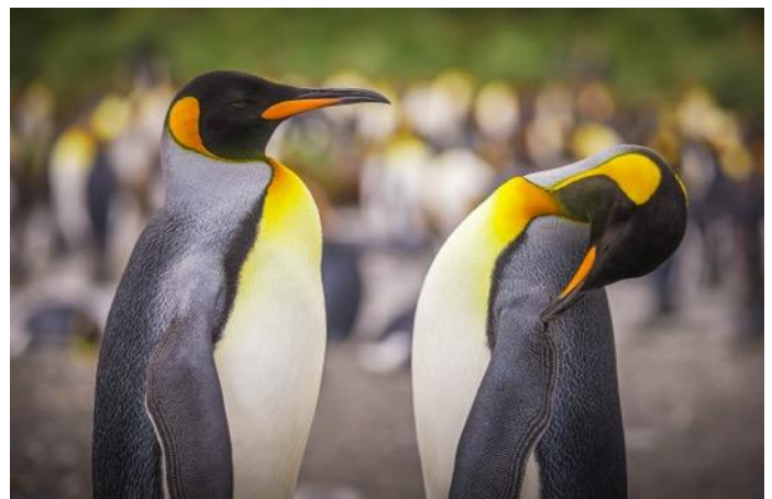
King Penguins

Grytviken was one of the most active whaling stations in the history of whaling, but the flensing plan is now empty and the boilers silent. More than 60 years of whaling history is told in the exhibits of the South Georgia Museum. The natural history exhibits are enriching, and after browsing and perhaps doing a little museum store shopping and mailing postcards, take a short walk around the bay to visit the whaler's graveyard where Shackleton and his right-hand man Frank Wild lie. The history of Antarctic exploration comes alive as you listen to tales of the adventures of Sir Ernest Shackleton. This famous explorer crossed the rugged backbone of South Georgia from the west to arrive at Stromness seeking help for his men