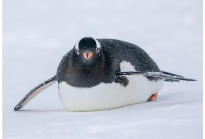
Gentoo Penguin

hanging ice cliffs, the fronts of highly fractured tidewater glaciers, decorate most of the shoreline for unforgettable scenery. At the southern part of the Lemaire Channel you'll arrive at Petermann Island . Located at 65°S, Petermann is outstanding for seeing gentoo and Adélie penguins making feeding trips in large groups along a snow-filled penguin highway to and from their nests. The clear water is beautiful for observing and photographing penguin activities. Petermann has seen a reversal in abundance between the two species, with half the numbers of Adélie penguins found here twenty years ago, but twice the numbers of gentoos.