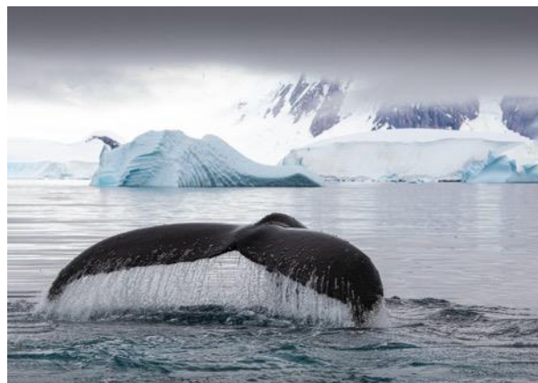
Humpback Whale

Chinstrap and gentoo penguins breed on Aitcho Island , an island covered in mossy green carpets, a surprisingly bright contrast to