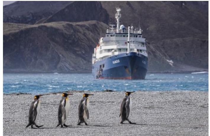
King Penguins

( https://cheesemans.com/extension/falklands-extension-oct2025 ), you will be in Stanley already to board the ship. Stanley is an attractive town and the last center of human population you will see until your arrival in Ushuaia, Argentina at the voyage's end. You should have some time before boarding to walk through town and explore this small corner of the British Empire that appears as if time has forgotten it. You will then be welcomed aboard by our Captain and our fine staff and crew and enjoy your first dinner aboard the ship before departing for South Georgia!