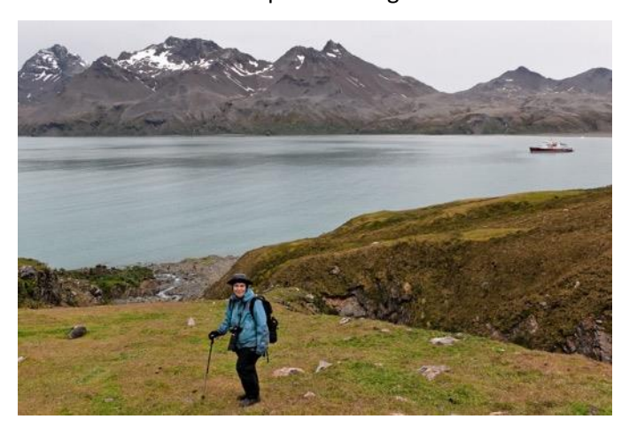
Fortuna Bay

In the lee of the central rib of South Georgia's impressive mountains, you will have good chances for clear skies and calm conditions. Fortuna Bay ends in an extended glacial alluvial plain covered with a fine grass where a photogenic king penguin colony resides. Search for nesting light-mantled albatross on the steep tussock slopes above the king penguin colony.