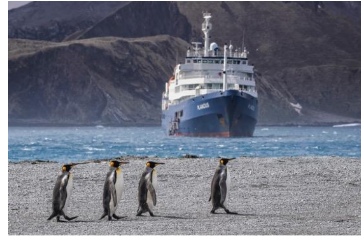
King Penguins

(https://cheesemans.com/extension/falklands-extension-oct2025), you will be in Stanley already to board the ship. Stanley is an attractive town and the last center of human population you will see until your arrival in Ushuaia, Argentina at the voyage's end. You should have some time before boarding to