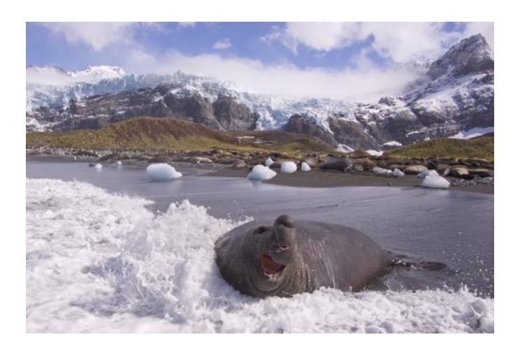
Elephant Seal

During this time of year, king penguins will be far from the only attraction at St. Andrews. The southern elephant seal, the world's largest seal, gather here by the thousands creating one of the densest concentrations of life on the planet. Expect to see thousands of females with young pups nursing. You can hope to witness beachmaster combat and breeding bouts. St. Andrews Bay has a reputation for volatile weather because it lies at the foot of three glaciers, where cold air can pour off these glaciers turning a calm quiet morning into a howling, harrowing landscape of katabatic winds in an astonishingly short time, so do pay attention to our expedition leaders!