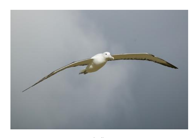
Royal Albatross

Named after the 16th Century English seaman, Sir Francis Drake, this waterway of about 600 miles separates the southernmost tip of South America from Antarctica. You cross the Polar Front approximately halfway across Drake Passage. Those on watch may sight several species of albatross and petrel following the ship; it is a particularly good area for royal albatross and blue petrel. Stay on the lookout for pods of sperm whales and other whales. Almost 500 miles north of the South Shetlands, you will near Cape Horn, with a distant view before turning northeast toward the Beagle Channel. The