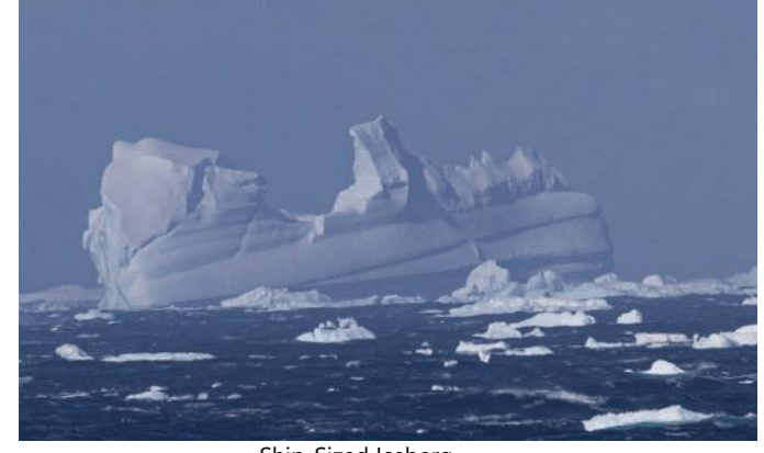
Ship-Sized Iceberg

Your route to Antarctica will be packed with wildlife watching opportunity from the ship's deck and attending informative lectures. The