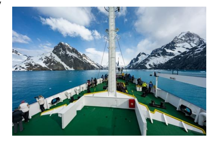
Cooper Bay

A colony of marvelous macaroni penguins and South Georgia's only colony of chinstrap penguins reside here. A hike up through tussock slopes will reward you with macaronis in a frenzy of early breeding season activity. You are sure to see chinstraps traveling through the surf