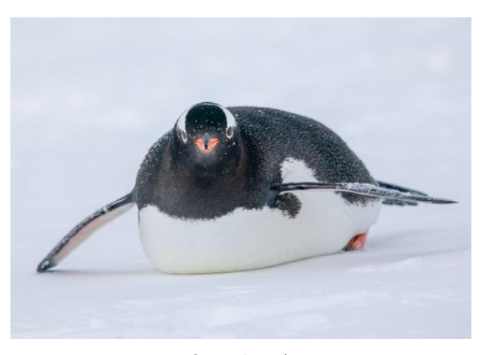
Gentoo Penguin

hanging ice cliffs, the fronts of highly fractured tidewater glaciers, decorate most of the shoreline for unforgettable scenery. At the southern part of the Lemaire Channel you'll arrive at Petermann Island . Located at 65°S, Petermann is outstanding for seeing gentoo and Adélie penguins making feeding trips in large groups along a snow-filled penguin highway to and from their nests. The clear water is beautiful for observing and photographing penguin activities. Petermann has seen a reversal in abundance between the two species, with half the numbers of Adélie penguins found here twenty years ago, but twice the numbers of gentoos.