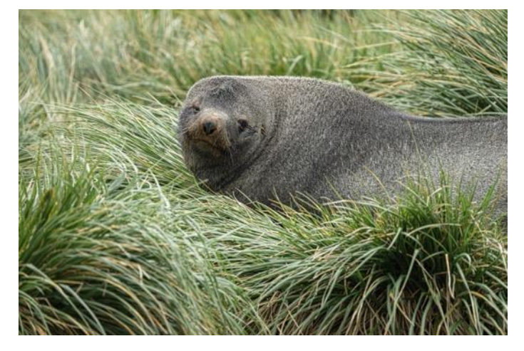
Fur Seal

aspects of ship life, preparing for what to expect on South Georgia Island, and enjoying views from the ship. You'll cross the Polar Front (aka the Antarctic Convergence) where two bodies of water meet, and as the salty, cold Antarctic water mixes alongside warmer, fresher water from the north, the water temperatures plummet from about 39 to 43°F (4 to 6°C) to 32°F (0°C) in about eight cruising hours, creating nutrient-rich waters for birds, fur seals, and whales. Watch and photograph birds on the wing; wandering albatross, black-browed albatross, plus a few southern or northern royal albatross should be following the ship. On previous expeditions, almost a dozen species of petrels (including three storm-petrel and common diving-petrel species), six species of albatross, thousands of Antarctic prions, southern