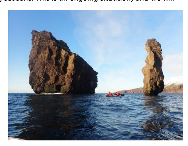
Deception Island

These are a string of volcanic islands, some still active, that run parallel to the Antarctic Peninsula across the Bransfield Strait . Fondly known as the "Banana Belt of Antarctica," these islands boast the richest concentrations of terrestrial wildlife in the Antarctic because of their proximity to the rich upwelling waters from the great Circumpolar Current. Even