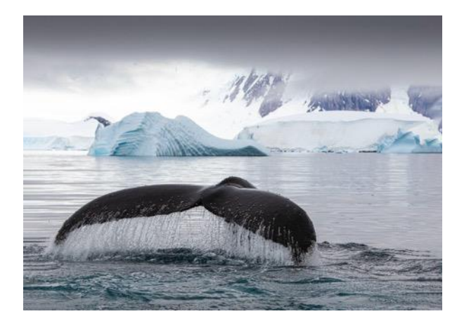
Humpback Whale

Chinstrap and gentoo penguins breed on Aitcho Island , an island covered in mossy green carpets, a surprisingly bright contrast to