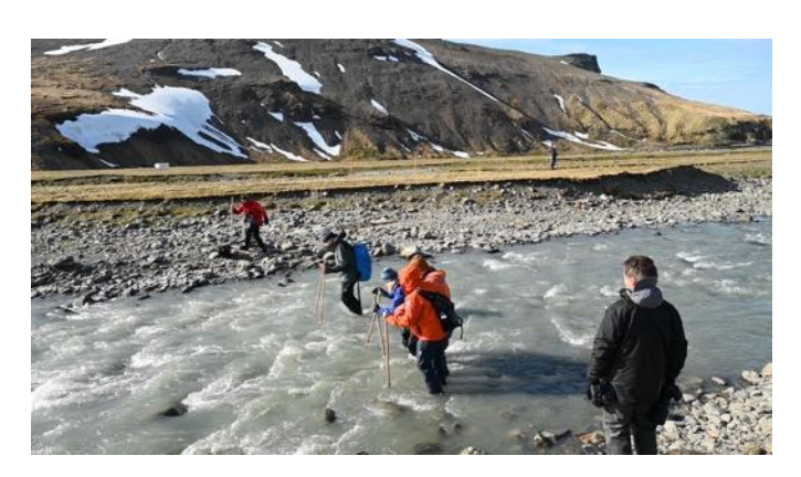
St. Andrew's Bay

Few places in the world are so far beyond description that any attempt rings hollow. St. Andrews Bay is one, with more than 150,000 pairs of king penguins forming a colony that covers a vast landscape. You will be mesmerized as you view penguins spanning multiple football fields. As you walk over the glacial moraine bordering the colony, the large visual mass of penguins along with their calls and smells hit you, and is an experience you will never forget. You must see, hear, and smell it to believe it.