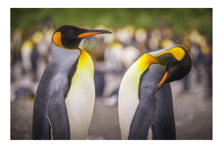
King Penguins