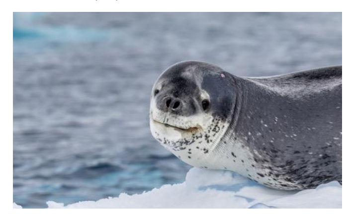
Leopard Seal

Over the last few decades, the Southern Ocean has experienced a significant warming trend, showing clear evidence of climate change. The Antarctic Peninsula has been feeling climate change the most with a massive 9°F (5°C) warming in average winter temperatures