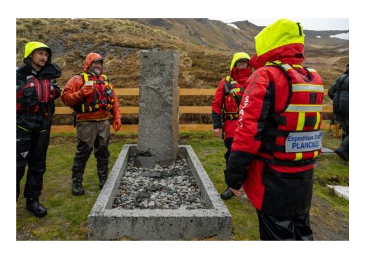
Shackleton's Grave

Grytviken was one of the most active whaling stations in the history of whaling, but the flensing plan is now empty and the boilers silent. More than 60 years of whaling history is told in the exhibits of the South Georgia Museum. The natural history exhibits are enriching, and after browsing and perhaps doing a little museum store shopping and mailing postcards, take a short walk around the bay to visit the whaler's graveyard where Shackleton and his right-hand man Frank Wild lie. The history of Antarctic exploration comes alive as you listen to tales of the adventures of Sir Ernest Shackleton. This famous explorer crossed the rugged backbone of South Georgia from the west to arrive at Stromness seeking help for his men