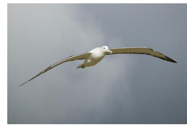
Royal Albatross

This morning you will be reluctant to say goodbye to your spirited shipmates and leaders! After an early breakfast and clearing customs, disembark the ship to transfer to the airport, to Ushuaia to wander town before transferring to the airport, or directly to your hotel.