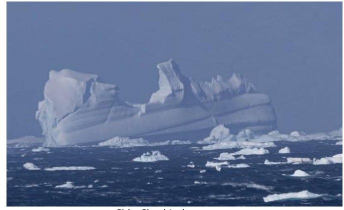
Ship-Sized Iceberg

Due to the expeditionary nature of our voyage, our passage length may vary depending on ice, weather, and wildlife conditions. Sailing time may exceed two days between South Georgia Island and the Antarctic Peninsula and South Shetland Islands. The average cruising speed of the Plancius is 10.5 knots.