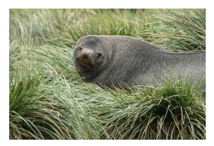
Fur Seal

Arrival time at South Georgia will depend on weather conditions and currents. We aim to spend six full landing days on South Georgia, one of the most remote islands in the world, to explore this wild landscape of penguins, albatrosses, and seals. The mountainous rugged interior, a geologic continuation of the Andes chain, is carved by more than 150 glaciers into spectacular fjords and ringed by islands. Our timing in this voyage is carefully chosen to experience South Georgia in a seldom seen but extremely vibrant time. You'll arrive before the peak of fur seal breeding (usually in November and December), when males stake out territories at densities so high that travel ashore becomes both dangerous and disruptive. Instead, you arrive during