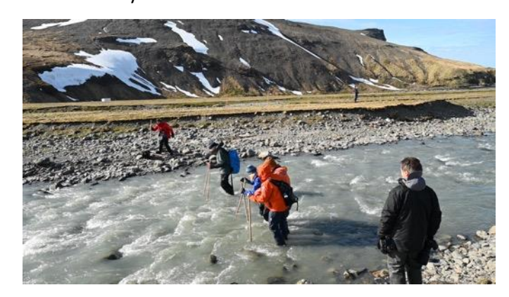
St. Andrew's Bay

elephant seal, the world's largest seal, gather here by the thousands creating one of the densest concentrations of life on the planet. Expect to see thousands of females with young pups nursing. You can hope to witness beachmaster combat and breeding bouts. St. Andrews Bay has a reputation for volatile weather because it lies at the foot of three glaciers, where cold air can pour off these glaciers turning a calm quiet morning into a howling, harrowing landscape of katabatic winds in an astonishingly short time, so do pay attention to our expedition leaders!