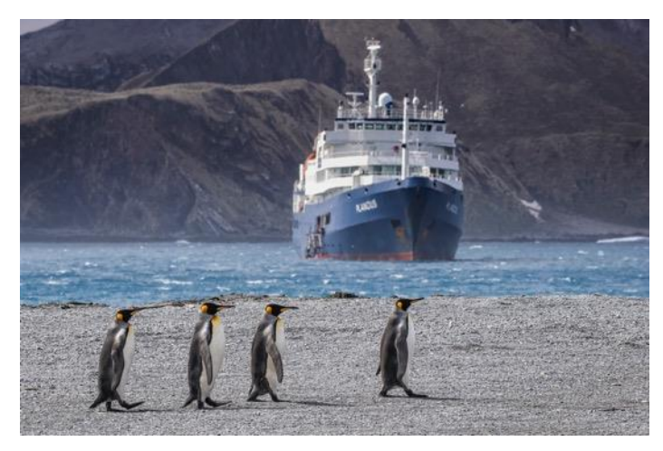
King Penguins

By morning you'll be far from the Falklands, heading southeast with albatross and other seabirds following the ship. You'll stay busy by joining lectures on photography, wildlife, and ecology, familiarizing yourself on all aspects of ship life, preparing for what to expect on South Georgia Island, and enjoying views from the ship. You'll cross the Polar Front (aka the Antarctic Convergence) where two bodies of water meet, and as the salty, cold Antarctic water mixes alongside warmer, fresher water from the north, the water temperatures plummet from about 39 to 43°F (4 to 6°C) to 32°F (0°C) in about eight cruising hours, creating nutrient-rich waters for birds, fur seals, and whales. Watch and photograph birds