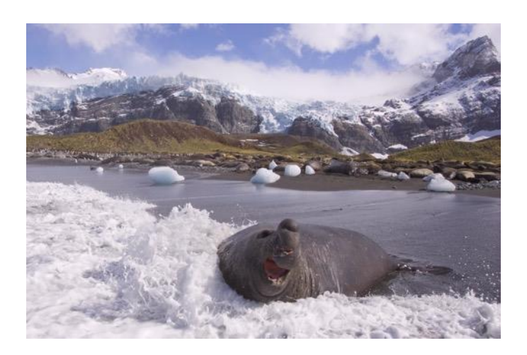
Elephant Seal

This is one of the most protected sites on South Georgia Island with great chances for clear blue skies. Fair or foul, you will find a beach at least as densely packed with southern elephant seals as St. Andrews Bay (though a smaller beach, so fewer numbers overall). In addition, observe about 25,000 pairs of king penguins, which line a glacial meltwater river winding behind the beach, a gentoo penguin colony, and steep slopes with light-mantled albatross nesting on their flanks. A tumbling icefall borders the back of the harbor making for stunning landscapes dramatized by the occasional explosion of glacial blocks tumbling down the cliff face.