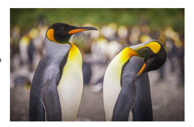
King Penguins

60,000 pairs of king penguins call this glacial plain home, making it a beloved site for any who explore South Georgia. Salisbury is located in the Bay of Isles, looking out on the wandering albatross breeding islands of Prion and Albatross. King penguins have a staggered breeding season where each adult's activities are dependent upon what they did the season before. Those that had no chick or an early fledging chick the previous year will be courting and mating, whereas those that did have a chick in the previous year may delay breeding. These early breeders have the best chances of successfully fledging a chick this year. You will