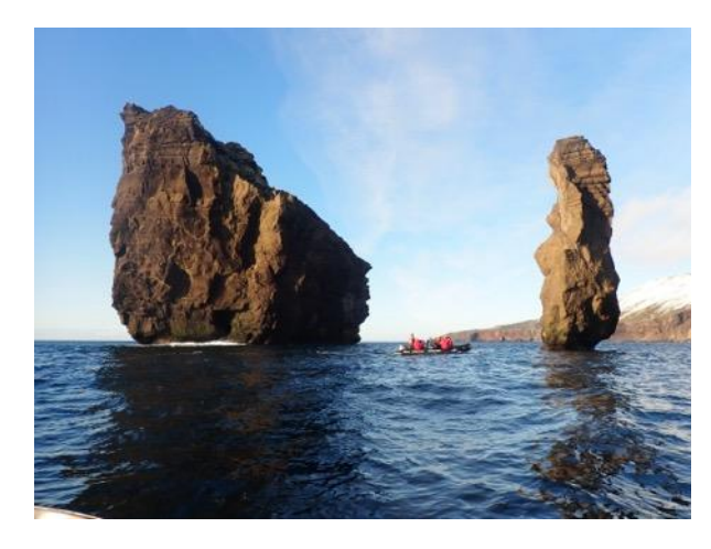
Deception Island

an exposed beach. Inside Deception's huge caldera, a landing at Whaler's Bay may