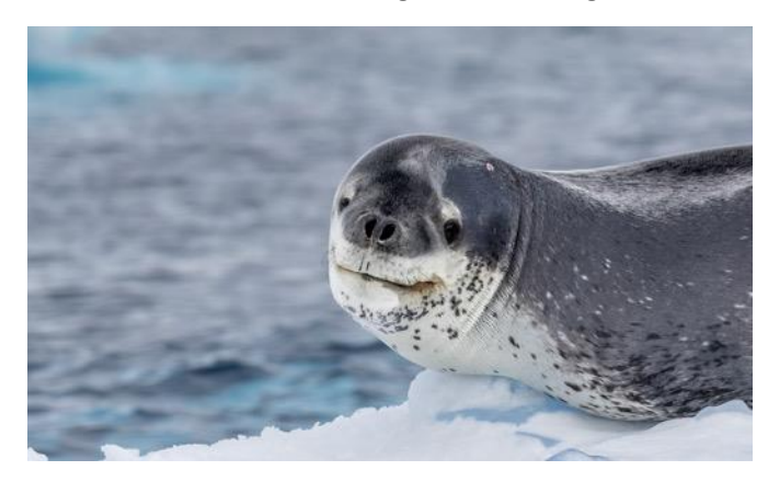
Leopard Seal © Vic Nemeth

Weather and ice distributions will determine whether we travel south down the west coast or sail east through the Antarctic Sound into the Weddell Sea ; happily, you have ample time for a