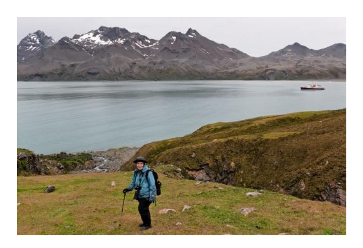
Fortuna Bay

Shackleton, Crean, and Worsley were very near the end of their dramatic and perilous self-rescue when they stumbled down into Fortuna Bay from the interior of the island. They had just one short hike remaining, a westward walk of about three miles to Stromness Harbour to reunite with civilization after over 17 months in the Antarctic. You'll retrace their trek over a 300-meter ridge with a stunning view across the König Glacier down to Stromness's rusting inactive whaling station to reunite with the ship.