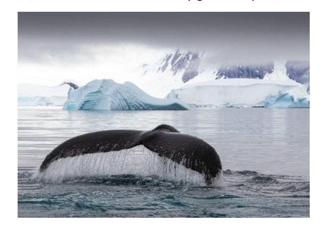
Humpback Whale

From the South Shetlands, we sail southwest across the Bransfield Strait into the fabled Gerlache Strait . Here you can expect whale sightings to ring out from the bridge as the Antarctic Peninsula landscape rises into a