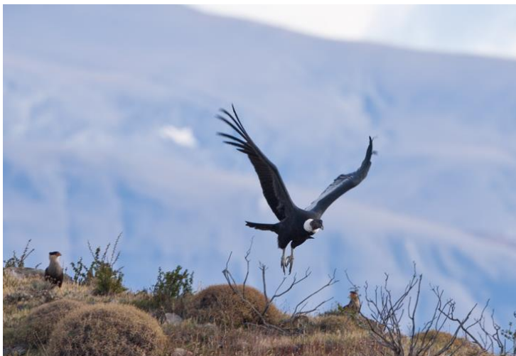
Andean Condor

You will start early to photograph and view the Towers or the Horns with the first light. With the right lighting, the mountain base turns orange and the scene becomes very dramatic with peculiar lenticular clouds moving fast over the peaks. At the eastern corner of Sarmiento Lake, you will reach a location that commands the most incredible views of the towering peaks of Las Torres, the pinnacles from which the park takes its name. As you move around the park, you might observe herds of guanaco, the curious-looking lesser rhea, and impressive Andean condors soaring along the road. During the morning you will visit the eastern side of the park to enjoy the views of one of the impressive waterfalls of Paine River and if it's clear, of the fabulous granite columns of the Paine massif from Laguna Amarga. If you'd prefer to hike to the base of the Towers, you can opt to do this today; your hotel can provide a guide (costs extra). After your picnic lunch, you will head back to Punta Arenas.