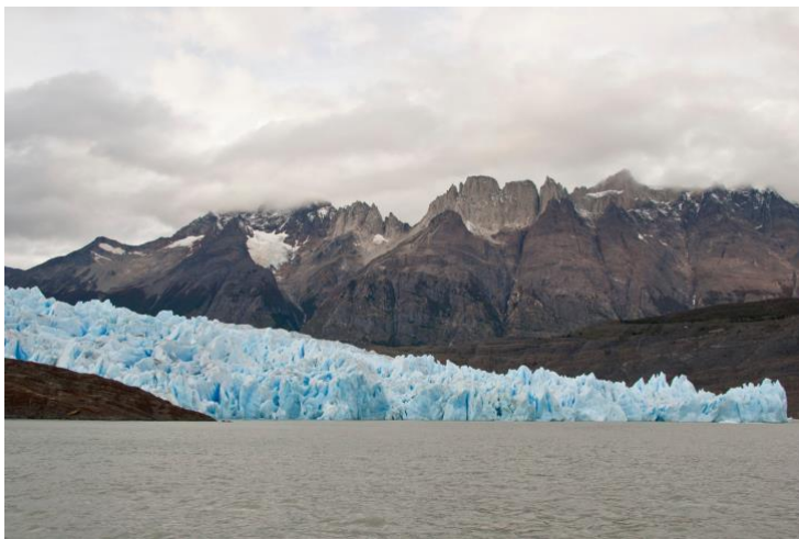
Grey Glacier

You will start early to view and photograph the Paine Massif at dawn. Today you will explore the southern and western regions of this vast national park, which comprises 600,000 acres. The omnipresent Paine Massif, a magnificent set of rugged peaks formed out of granite and sedimentary rock, dominates the landscape. You will have the opportunity to explore the southern beech forests and its diversity of plants and animals; you may find Magellanic woodpecker, austral parakeet and, if you are lucky, the shy Andean deer (huemul). Take in the contrasting mosaic of towering mountains, glaciers, wetlands, steppes, and forests. Lake Grey is one of the highlights of the day where colossal icebergs are stranded on the southern shore of the lake after a long, slow transit from the glacier front.