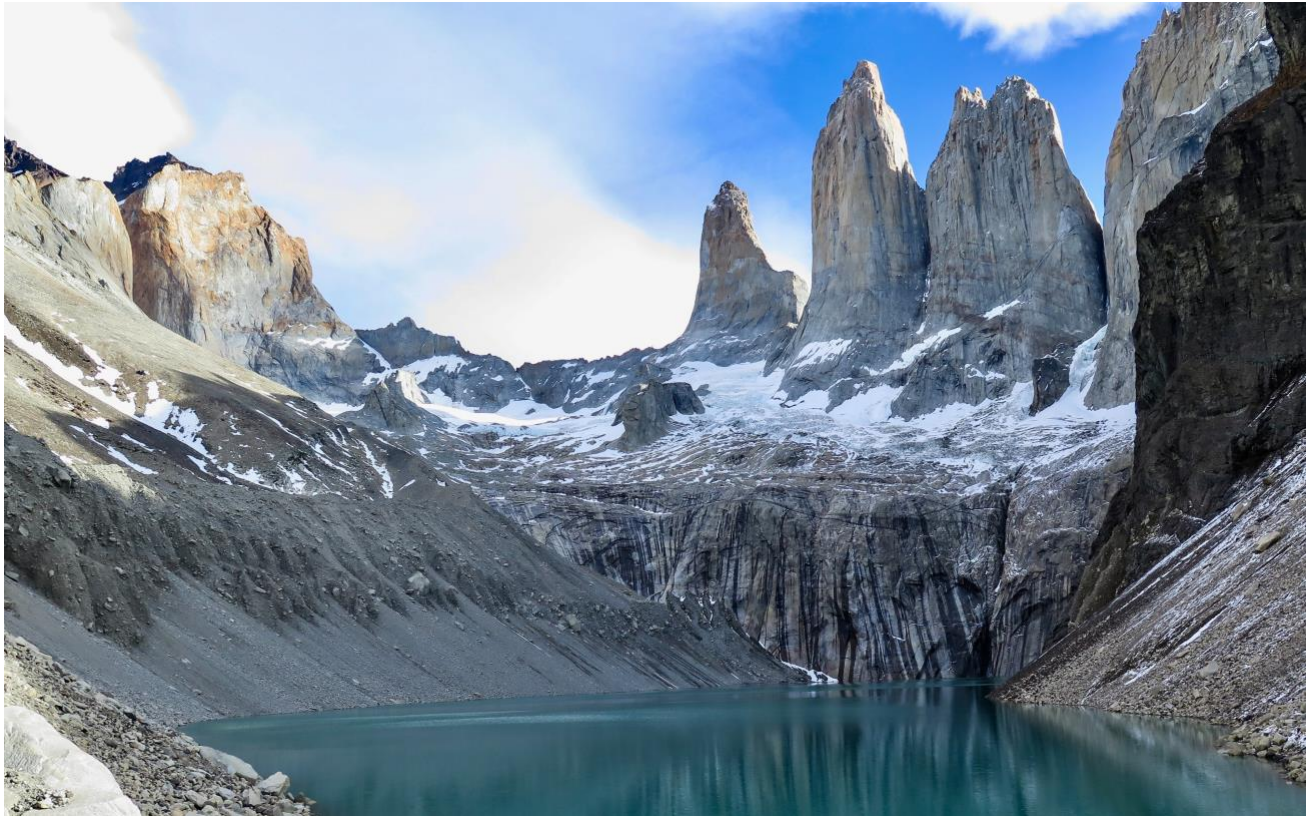
Paine Massif Horns