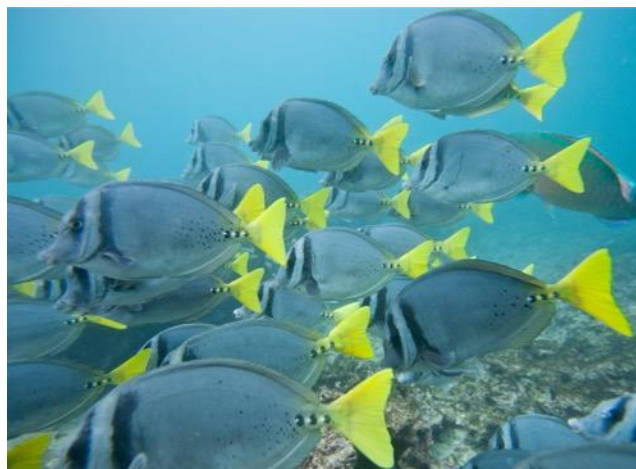
Yellow-Tailed Surgeonfish

This afternoon, you'll sail to Gardner Bay, one of the most beautiful beaches in the Galápagos. A nearby snorkel is likely to find you in the water with playful sea lions. Galápagos sea lions populate the surf while the remarkably brave Española mockingbird may peck your water bottle for water. Enjoy photographing shorebirds and sea lions, looking for the large cactus-finch, or walking along the beautiful beach.