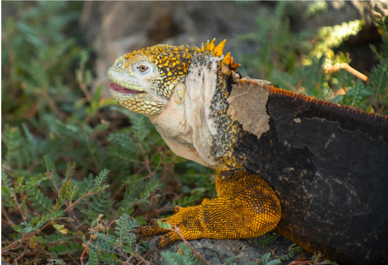
Land Iguana