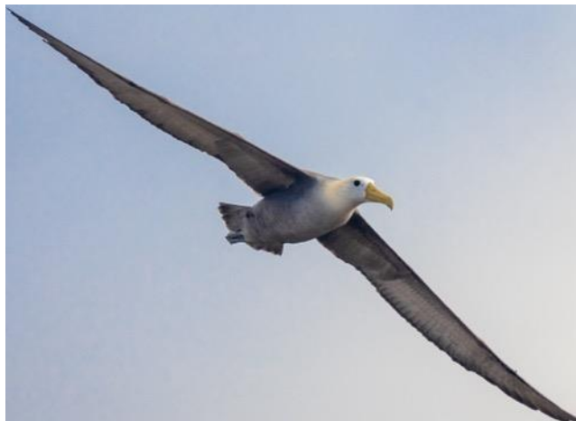
Waved Albatross

In the morning you will land behind Punta Cormorant for a walk to the flamingo lagoon in search of shorebirds and a few flamingoes. The plant life here is unique and includes another species of the endemic composite Scalesia . After returning to the Samba , you will sail to one of the best spots in the world for snorkeling – Devil's Crown. You normally see rays, sea turtles, surgeonfish, parrotfish, jacks, wrasses, and many other tropical fish. Floreana also holds compelling human history that includes pirate caves, European settlers, the islands' first citizen birth, and unexplained disappearances. Experience a piece of this history with a visit to Baroness Lookout.