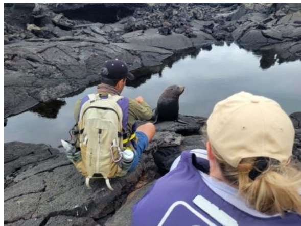
Galapagos Fur Seal

You'll enjoy the last landing site teeming with wildlife and wander past many breeding blue-footed boobies and a large colony of magnificent frigatebirds. Hopefully you'll find males of both species in full display, the boobies sky-pointing and showing off their bright blue feet as they dance and the frigates calling for females with their wings spread wide and their dramatic red throat pouches inflated – an unforgettable sight! You also have the chance to see Galápagos sea lions, marine iguanas, striated herons, brown noddies, swallow-tailed gulls, and lava gulls. The endemic palo santo and low, bushy prickly pear cacti add great scenery to the amazing abundance of Galápagos wildlife. You'll reluctantly depart for Baltra and bid farewell to the Samba and its crew.