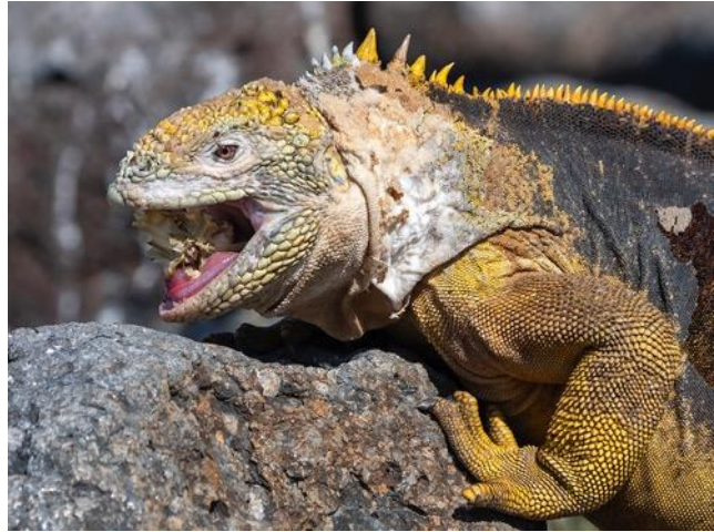
Land Iguana

This afternoon, you head back to Isabela for a very interesting landing at Urbina Bay. In 1954, this portion of Isabela lifted out of the sea so suddenly that fish and sea turtles were literally trapped high and dry on a freshly changed coastline. You will explore this unusual site to examine evidence of the geologic forces that continue to shape these islands. Along your walk, you will find rocks full of bleached shells and massive coral heads now far from the sea. Large iguanas, both land and marine, live here as well as a few giant tortoises, the species for which the Galápagos Islands were named. You will snorkel in some of the coldest water of the trip but, thankfully, your full-length wetsuit will provide insulation as you discover the underwater world.