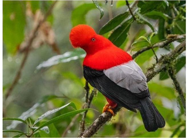
Andean Cock-of-the-Rock

All routings and visitor sites on the Galápagos Islands are subject to change by the Galápagos National Park Service to minimize traffic and impact.