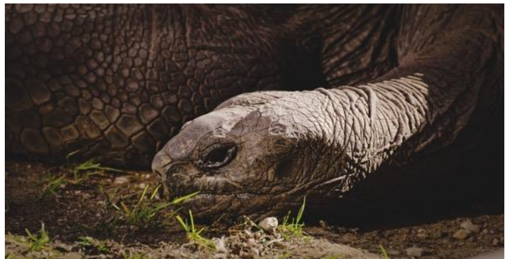
Giant Tortoise

Upon reaching Santa Cruz, you'll anchor in Academy Bay beside the bustling small town of Puerto Ayora, the islands' primary population center. You'll travel to the Santa Cruz highlands to seek out elusive island endemics in beautifully unique habitats. You will explore Los Gemelos, two incredible volcanic sinkholes surrounded by Scalesia