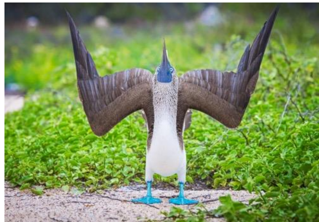
Blue-footed Booby

The small yet incredible island of Plaza Sur (South Plaza) is your afternoon destination. This beautiful island is home to many land and marine iguanas. The colorful landscape is covered with reds and greens of Portulaca that may have yellow flowers the iguanas enjoy eating. In the giant prickly pear cactus you can compare the common cactus-finch alongside small and medium ground-finches. At the top of the island bachelor sea lions escape from the competition of stronger males as red-billed tropicbirds fly gracefully by.