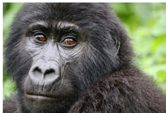
Mountain Gorilla

Spend three days on gorilla treks in Bwindi Impenetrable Forest. The forest is part of a national park that lies on the edge of the Albertine Rift Valley in southwestern Uganda, with a wide altitude range between 1,160m and 2,600m (peaking over 8,500ft above sea level). The forest dates back to the ice ages and is one of Uganda's oldest and most ecologically diverse regions. It is home to almost 400 plant species, 350 bird species, including 23 Albertine Rift endemics, and 120 mammal species including rodents, bats, mountain gorillas, olive baboons, chimpanzees, elephants, and antelopes.