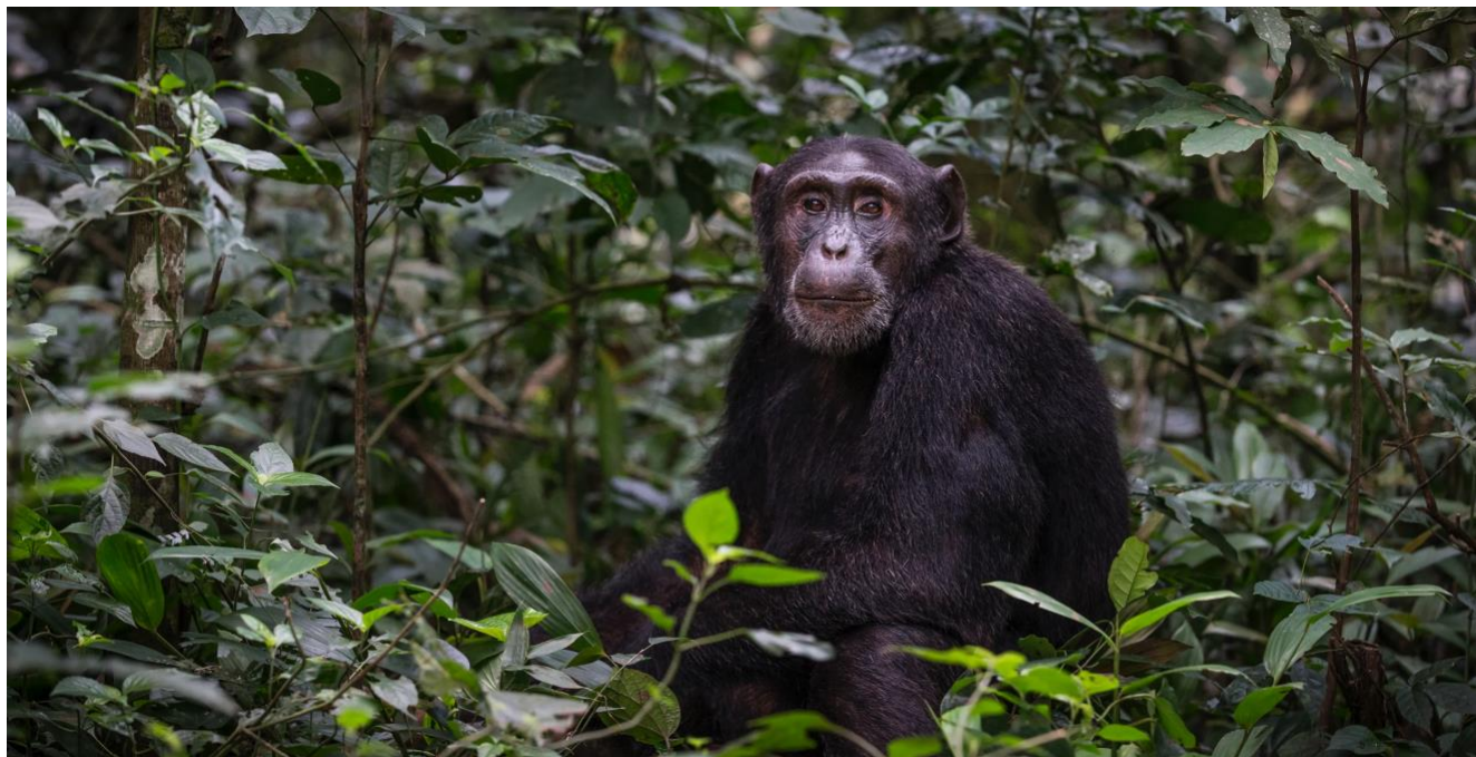
Chimpanzee