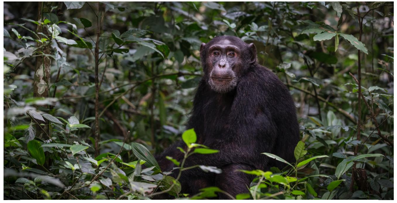
Chimpanzee