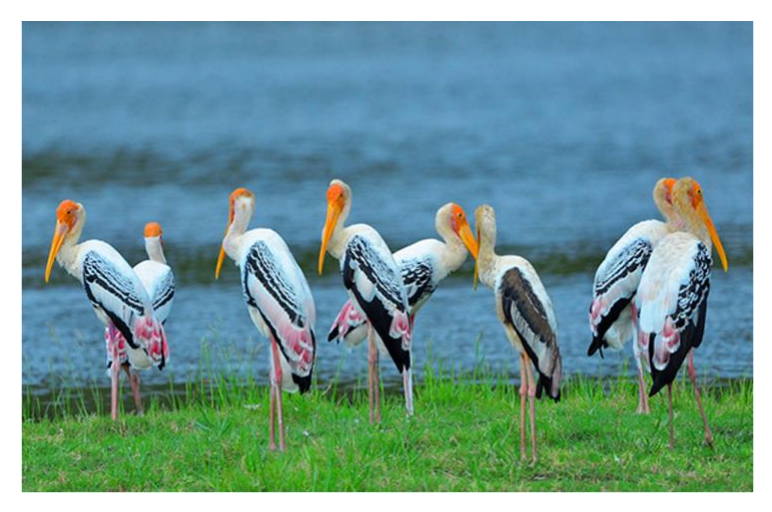
Painted Stork

Gal Oya Lodge is a unique Sri Lankan ecolodge spread across 20 acres of private jungle. Take your time enjoying this natural paradise through the experiences offered, which include a walk with the Vedda neighbors, one of the last remaining communities of the forestdwelling, indigenous people of Sri Lanka. As the tribesman discusses the utilization of medicinal plants, the whereabouts of their age-old hunting territories and cavernous