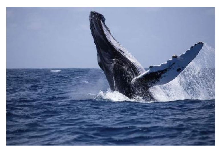
Blue Whale

The South Coast of Sri Lanka boasts one of the very best places to see Blue Whales, and the season is longer than anywhere else. From November to April, when the whales are on their annual migratory route from the Horn of Africa up to the Arabian Sea, they can be seen in the waters around Sri Lanka. Sperm whales with pods as well as other cetacean species, such as Bryde's whale, dwarf sperm whale, spinner dolphin, striped dolphins, and Indo-Pacific bottlenose dolphin can be seen also.