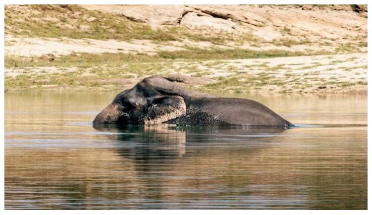
Elephant

Gal Oya National Park is one of Sri Lanka's undiscovered natural treasures. Today, take a jeep into the forgotten Nilgala section of the park, once the protectorate of ancient royalty for the abundant medicinal plants and endemic birdlife unique to this ecosystem. Although shy and sometimes hard to spot, most of the animals found on the island reside in this park. Some of the more likely species to look out for include herds of elephants, four species of deer, as well as many bird species. More intrepid guests may opt for a hike to the Makara River mouth with one of our expert naturalists to further experience the jungle by seeing wildlife on foot.