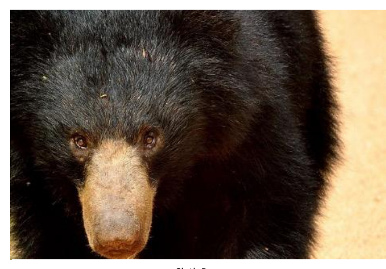
Sloth Bear

Wilpattu retains its status as a preferred safari destination due to a strong prevalence of elusive leopards. Though the present number of Sri Lankan leopards in the park is unknown, it is one of the best wildlife safari destinations to observe these big cats. Another highlight is the dense population of Sri Lankan sloth bears, which are a highly threatened sub species of sloth bear that exists only on the island.