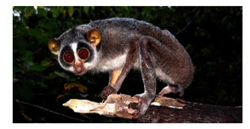
Loris