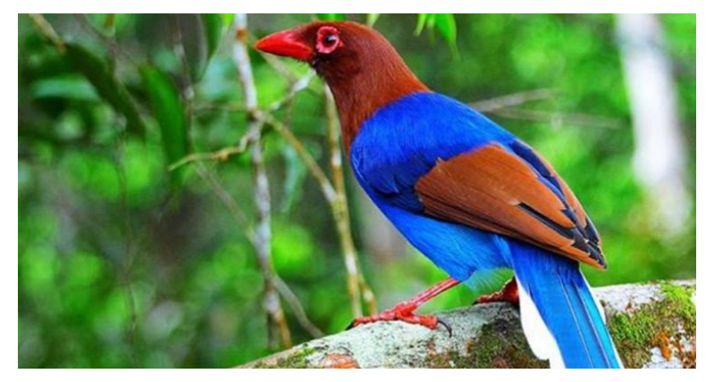
Blue Magpie

Walk along the twisting footpaths over wooden bridges built above small streams, through endless soothing greenery accompanied by bird songs with the smell of the good earth all around, totally surrounded by the beauty of nature. The wilderness with its shady trees and spectacular bird life consists of jungle magpie robins, jungle fowl, the red vented and black capped bulbuls, black headed orioles, crimson backed woodpeckers, brown headed barbets, black headed orioles, paradise flycatchers, flower peckers, sun birds, tailor birds, parakeets, eagles, and plenty more. This natural treasure trove is also home to spotted deer, wild boar, porcupine, mouse deer, black-