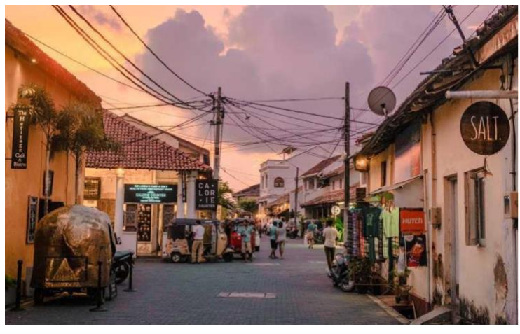
Galle Fort

Mar 11 ~ Transfer back to Colombo and depart for home or join <u>the Ceylon Tea Trails</u> <u>Extension</u>.