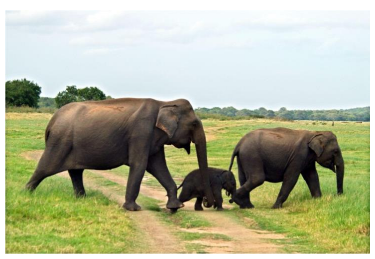
Elephants

In the evening, you'll head for the Minneriya National Park. The park is a protected wildlife reserve in the heart of Sri Lanka's Dry Zone. Its main feature is the Minneriya Reservoir, a true engineering marvel, the largest of 16 built in the 3rd Century AD by King Mahasena. Minneriya National Park is home to 24 species of mammals including the world's largest gathering of Asian elephants. Moreover, Minneriya National Park plays a pivotal role in Sri Lanka's conservation efforts, particularly in safeguarding vital habitats for elephants and other wildlife. This destination is not merely a testament to nature's wonders but also a testament to the rich history and culture of Sri Lanka.