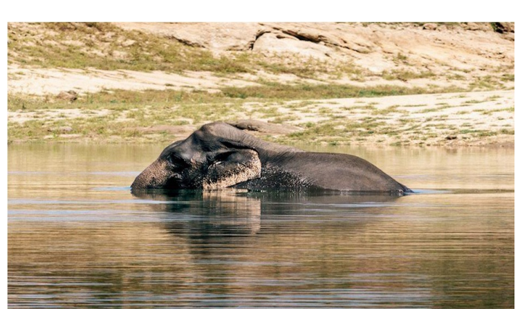
Elephant

Gal Oya National Park is one of Sri Lanka's undiscovered natural treasures. Today, take a jeep into the forgotten Nilgala section of the park, once the protectorate of ancient royalty for the abundant medicinal plants and endemic birdlife unique to this ecosystem. Although shy and sometimes hard to spot, most of the animals found on the island reside in this park. Some of the more likely species to look out for include herds of elephants, four species of deer, as well as many bird species. More intrepid guests may opt for a hike to the Makara River mouth with one of our expert naturalists to further experience the jungle by seeing wildlife on foot.