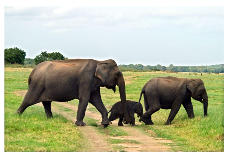
Elephants

In the evening, you'll head for the Minneriya National Park. The park is a protected wildlife reserve in the heart of Sri Lanka's Dry Zone. Its main feature is the Minneriya Reservoir, a true engineering marvel, the largest of 16 built in the 3rd Century AD by King Mahasena. Minneriya National Park is home to 24 species of mammals including the world's largest gathering of Asian elephants. Moreover, Minneriya National Park plays a pivotal role in Sri Lanka's conservation efforts, particularly in safeguarding vital habitats for elephants and other wildlife. This destination is not merely a testament to nature's wonders but also a testament to the rich history and culture of Sri Lanka.