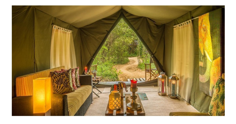
Walpattu Lodge

After a delectable lunch, you begin your afternoon safari until dusk falls. You will be returning to the campsite to enjoy a drink in the jungle bar before dinner in a specially-selected location.