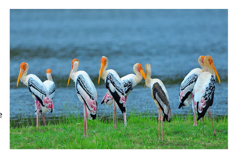
Painted Stork

Gal Oya Lodge is a unique Sri Lankan ecolodge spread across 20 acres of private jungle. Take your time enjoying this natural paradise through the experiences offered, which include a walk with the Vedda neighbors, one of the last remaining communities of the forest-dwelling, indigenous people of Sri Lanka. As the tribesman discusses the utilization of medicinal plants, the whereabouts of their age-old hunting territories and cavernous