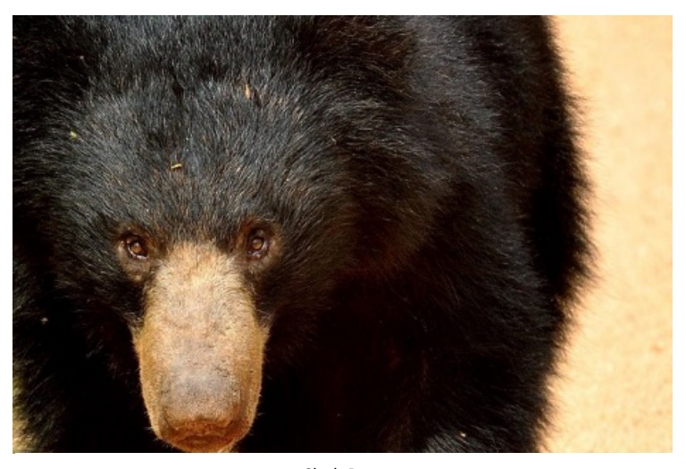
Sloth Bear

Wilpattu retains its status as a preferred safari destination due to a strong prevalence of elusive leopards. Though the present number of Sri Lankan leopards in the park is unknown, it is one of the best wildlife safari destinations to observe these big cats. Another highlight is the dense population of Sri Lankan sloth bears, which are a highly threatened sub species of sloth bear that exists only on the island.