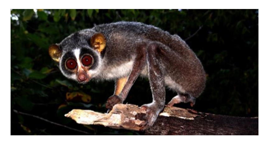
Loris