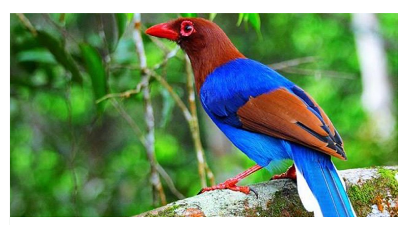
Blue Magpie

Walk along the twisting footpaths over wooden bridges built above small streams, through endless soothing greenery accompanied by bird songs with the smell of the good earth all around, totally surrounded by the beauty of nature. The wilderness with its shady trees and spectacular bird life consists of jungle magpie robins, jungle fowl, the red vented and black capped bulbuls. black headed orioles, crimson backed woodpeckers, brown headed barbets, black headed orioles, paradise flycatchers, flower peckers, sun birds, tailor birds, parakeets, eagles, and plenty more. This natural treasure trove is also home to spotted deer, wild boar, porcupine, mouse deer, black-