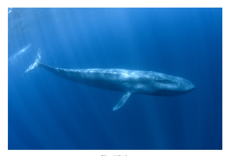
Blue Whale

The South Coast of Sri Lanka boasts one of the very best places to see Blue Whales, and the season is longer than anywhere else. From November to April, when the whales are on their annual migratory route from the Horn of Africa up to the Arabian Sea, they can be seen in the waters around Sri Lanka. Sperm whales with pods as well as other cetacean species, such as Bryde's whale, dwarf sperm whale, spinner dolphin, striped dolphins, and Indo-Pacific bottlenose dolphin can be seen also.