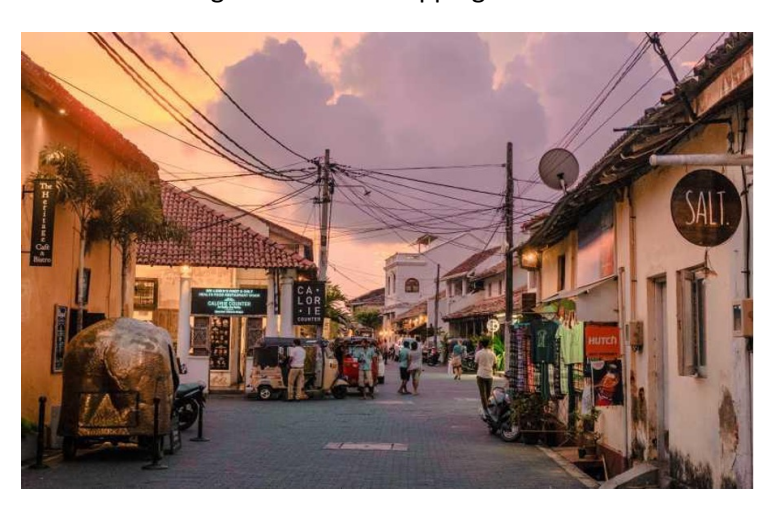
Galle Fort

Mar 11 ~ Transfer back to Colombo and depart for home or join the Ceylon Tea Trails Extension.