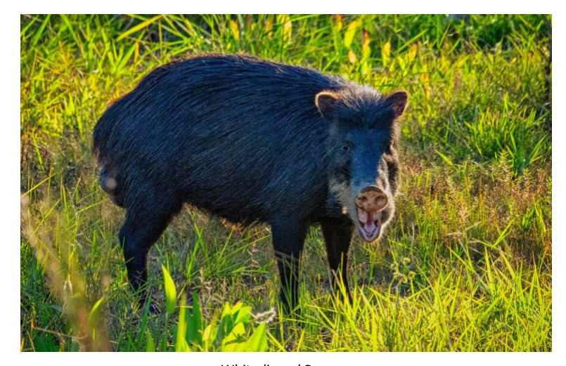
White-lipped Peccary

Here, you'll have your best chances of finding giant anteater and ocelot on game drives and during night spotting, and sometimes you may even see jaguar, maned wolf, and South American tapir. Fazenda San Francisco has extensive native forest, wetlands, and