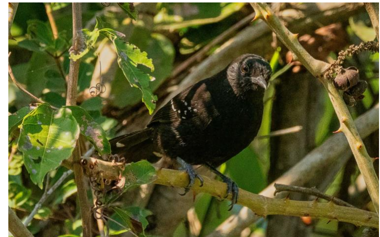
Mato Grasso Antbird

Transfer to the São Paulo Airport for the midmorning group flight to Cuiabá, located in the northern part of the state of Mato Grosso. Upon arrival, drive across 56mi of the Cerrado region (Brazilian savanna) to the town of Poconé, and then drive 26mi south to the entrance of the Transpantaneira Highway – a truly extraordinary gravel road traversing some 93mi of the Pantanal. You will continue south down the Transpantaneira to Araras.