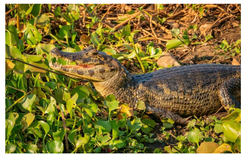
Yacare Caiman

Caiman Lodge, which is best of the best of nature lodges in South America, has charming accommodations, a very experienced friendly staff, delicious food, very high-quality service, and best of all, amazing wildlife! This is our favorite location in all of the Pantanal. You'll begin your explorations in the beautiful surroundings for birds and other wildlife. You'll