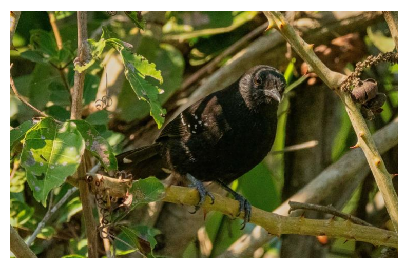
Mato Grasso Antbird

Explore the grounds of the Araras Eco Lodge, which include 7,413 hectares of wetlands, forest, and savannah. You can find birds, such as the cinereous-breasted spinetails and