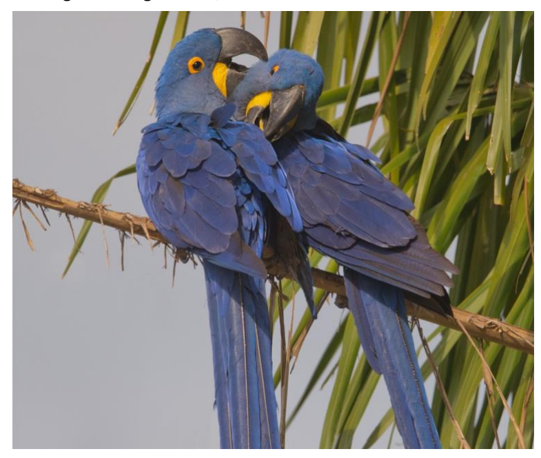
Hyacinth Macaw

The principal avian emblems of the Pantanal are the jabiru stork standing five feet tall and the hyacinth macaw, the world's largest parrot. The hyacinth macaw is usually near lodges where they easily steal the show while