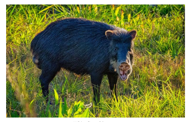
White-lipped Peccary

Here, you'll have your best chances of finding giant anteater and ocelot on game drives and during night spotting, and sometimes you may even see jaguar, maned wolf, and South American tapir. Fazenda San