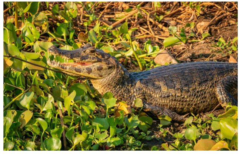
Yacare Caiman