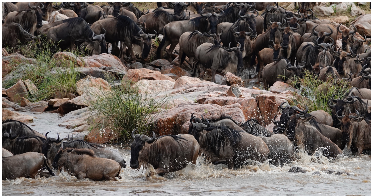
Wildebeests Crossing the River