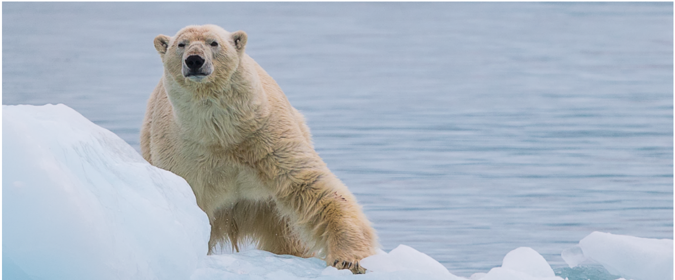
Polar Bear taken through a telephoto lens