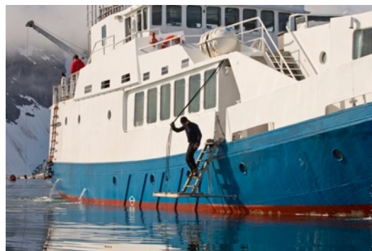
Ladder to Access Zodiacs

Don't let a fear of motion sickness keep you away! Even those who have experienced seasickness reported that the incredible wildlife and overall experience were well worth the temporary discomfort. If you are susceptible to seasickness or are concerned that you might be, please come prepared! The key to avoiding seasickness is to act before you experience nausea. Do your own research and consult your doctor before taking any medications. A good night of sleep, eating well, limiting alcohol, and using your favorite seasickness remedy is sufficient for most travelers. Find more information on our Coping with Seasickness webpage (this information is applicable to any form of motion sickness) and contact us if you have any questions.