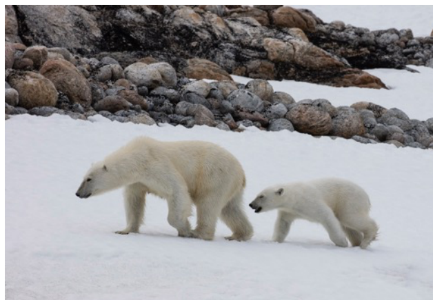
Polar Bears

Your expedition will have an incredible amount of freedom to explore the Svalbard archipelago. In the land of 24-hr daylight, you'll search for Arctic wildlife of all shapes and sizes. The region hosts species that will present you with great opportunities to capture world-class images. Your small group expedition allows for flexibility and freedom to cruise around the shores. When on shore, you'll have the opportunity to hike, explore, and photograph wildlife and landscapes. You'll also find that Svalbard is a geologist's paradise with all the ancient colorful rock strata exposed and ready to explore.