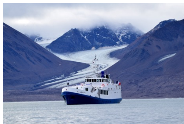
Svalbard Ship

The waters around these islands are very calm compared to the Antarctic. Due to the shallow seas and the warming waters of the Gulf Stream, the climate is much milder than one would expect so far north. During this in-depth voyage, you will have ample opportunities to land ashore, Zodiac cruise, and view wildlife from the decks of our ship.