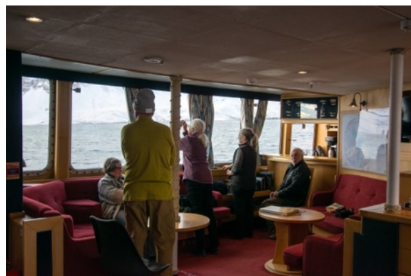
Sights from the Ship

Longyearbyen is a Scandinavian town located on the island of Spitsbergen, the largest in the Svalbard Archipelago. Three other small settlements on Spitsbergen include another 1,000 people with most in the Russian settlement of Barentsburg. The rest of the 62,000 square kilometers of Spitsbergen, and the remainder of the archipelago, are largely pristine. While walking around Longyearbyen, you'll be surrounded by tiny wildflowers beginning to bloom, and may encounter wildlife such as Svalbard ptarmigan and snow buntings nesting on the outskirts of town. Common eiders, parasitic jaegers (arctic skuas) and arctic terns nest along the coastal flats adjoining the town.