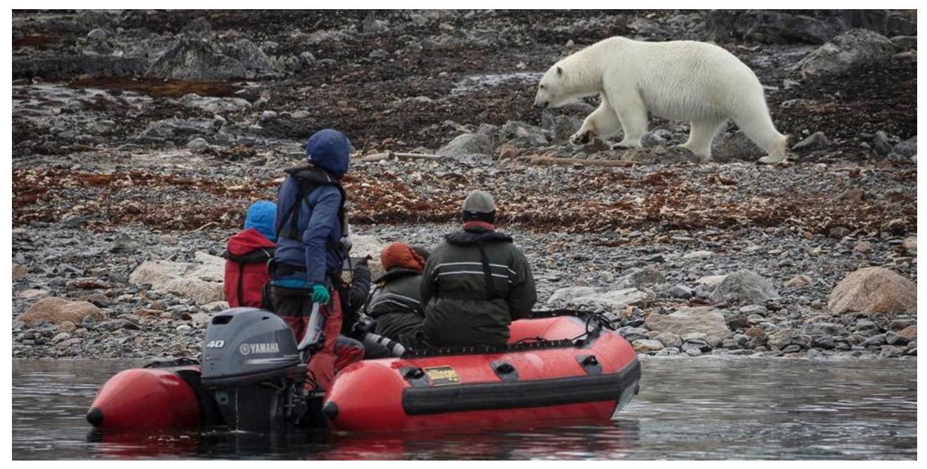
Polar Bear