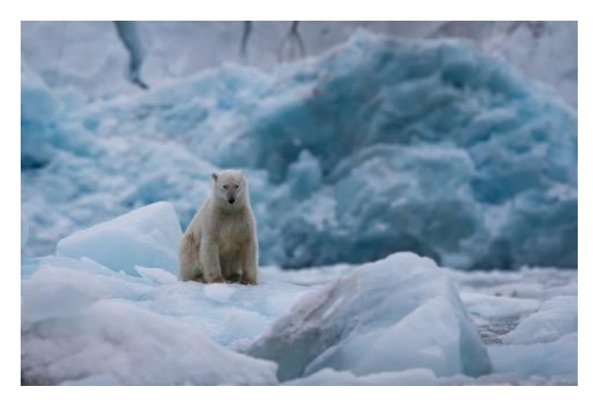
Polar Bear

You'll visit fantastic bird cliffs where black-legged kittiwakes, northern fulmars, and several species of alcids breed which include dovekie, black guillemot, thick-billed murre (Brünnich's guillemot), and Atlantic