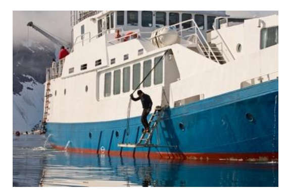
Ladder to Access Zodiacs

Don't let a fear of motion sickness keep you away! Even those who have experienced seasickness reported that the incredible wildlife and overall experience were well worth the temporary discomfort. If you are susceptible to seasickness or are concerned that you might be, please come prepared! The key to avoiding seasickness is to act before you experience nausea. Do your own research and