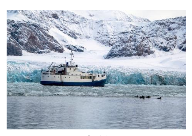
Svalbard Ship

The waters around these islands are very calm compared to the Antarctic. Due to the shallow seas and the warming waters of the Gulf Stream, the climate is much milder than one would expect so far north. During this in-depth voyage, you will have ample opportunities to land ashore, Zodiac cruise, and view wildlife from the decks of our ship.